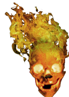
Floating Skull (#37)