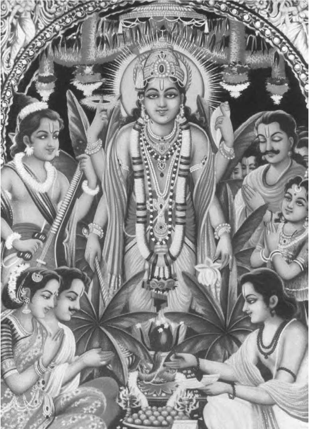
Vishnu, the preserver, who incarnates in time of need to bring righteousness back to earth (TRIP)