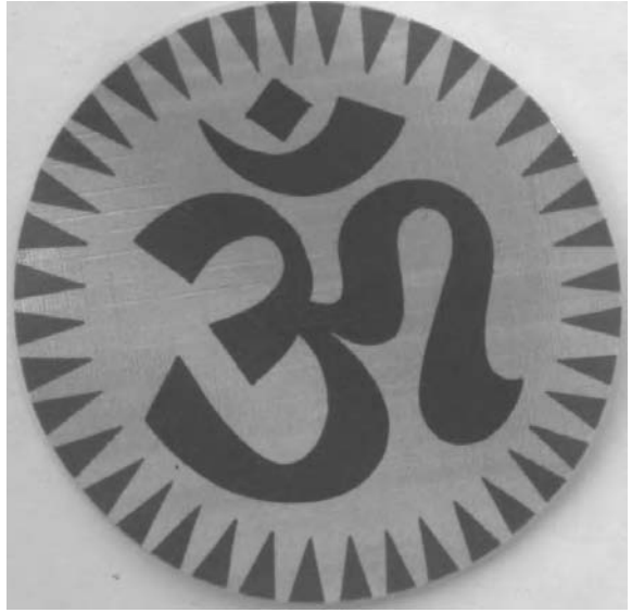
Om or Aum, the most sacred mantra of Hinduism (TRIP)

his life with his brother Nara. Nârâyana and Nara's tapas heated up Indra's throne, so he was determined to bring their tapas to an end. Indra arrived at their aśrama on his elephant Airāvata and roared that he would give the sages a boon ( vara ). But they ignored him. Next Indra sent frightening animals, and finally he sent his best—an army of apsaras (celestial damsels) and their attendants. The apsaras included Rambhâ, Menakâ, and Ghritâcî. The sages came out of their meditation and enjoyed listening to the singing and watching the dancing. Then Nârâyana decided to teach Indra a lesson. He slapped his thigh ( ûru ) and created a young woman more beautiful than all of Indra's army of beauties. He named her Urvaśî (the one from a thigh). Indra's beauties became afraid in the presence of such powerful sages. They apologized and propitiated the sages, who sent them all away with Urvaśî as a gift to Indra.