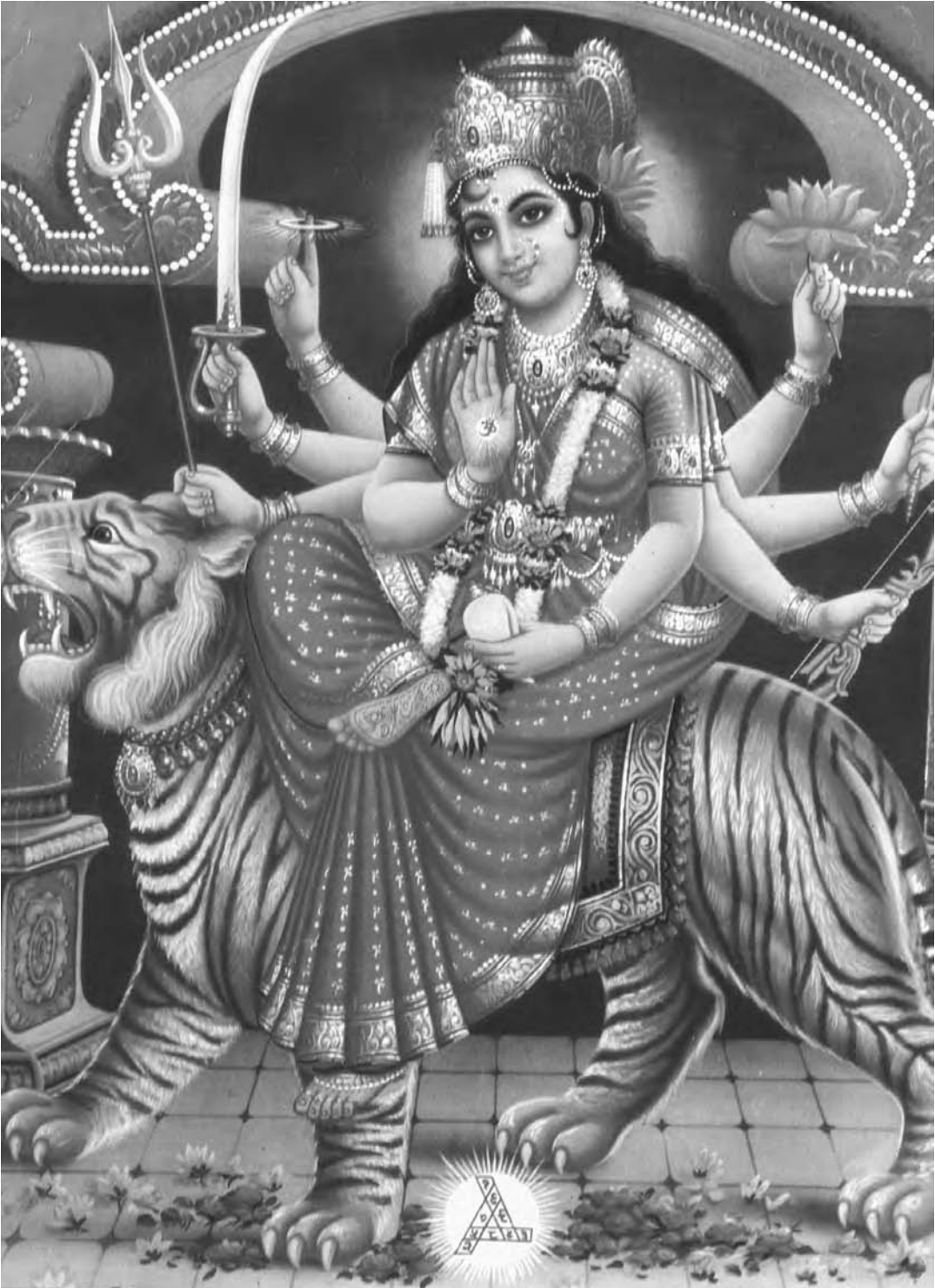
Durgâ in one of her eight-armed forms rides a tiger. (TRIP)