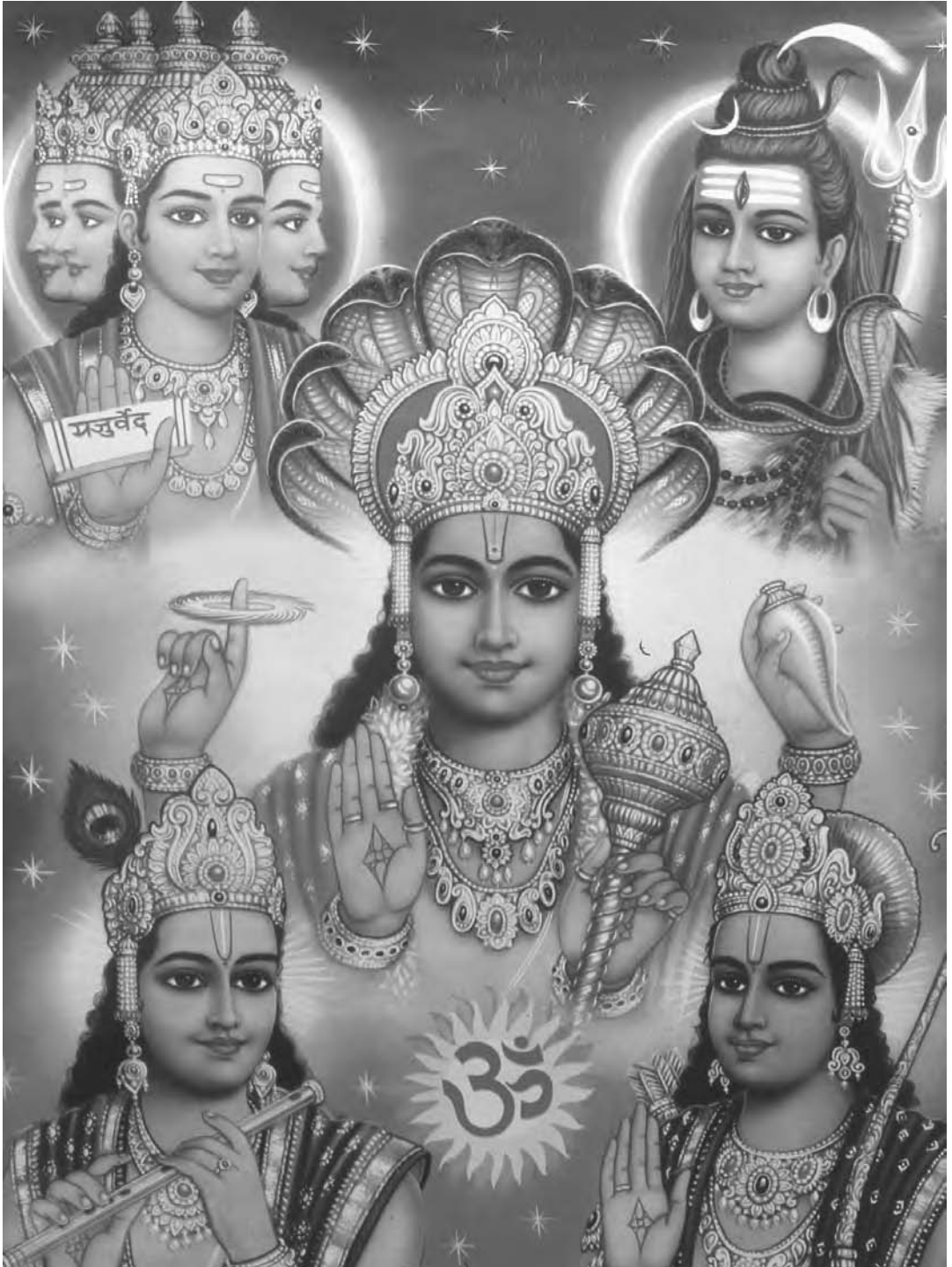
Vishnu is centered in this slightly sectarian image, with Brahmâ and Śiva smaller and above with Krishna and Râma, his avatâras or incarnations, below.