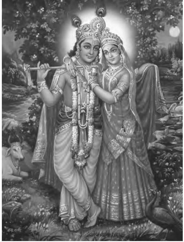
Râdhâ, gopi and favorite of Krishna

Râdhâ is one of the most popular figures in Hindu mythology and is even understood by some to be a manifestation of the Supreme. Râdhâ has many personas and a complex mythology. Râdhâ is the young, innocent maiden coming into the forest at night in response to Krishna's magical flute. Râdhâ is the favorite wife of Krishna (an incarnation of Vishnu) from his many wives among the cowherds of Vrindâvana (Gokula). And Râdhâ is the wife of Adhiratha (or Kalâvati) and the foster mother of Karna (the divine son of Kuntî and Sûrya). Which of Râdhâ's many faces appears in a story is said to be caused by the listener to her myths—she takes the aspects of the listeners' own mâyâ and is born from their projec-