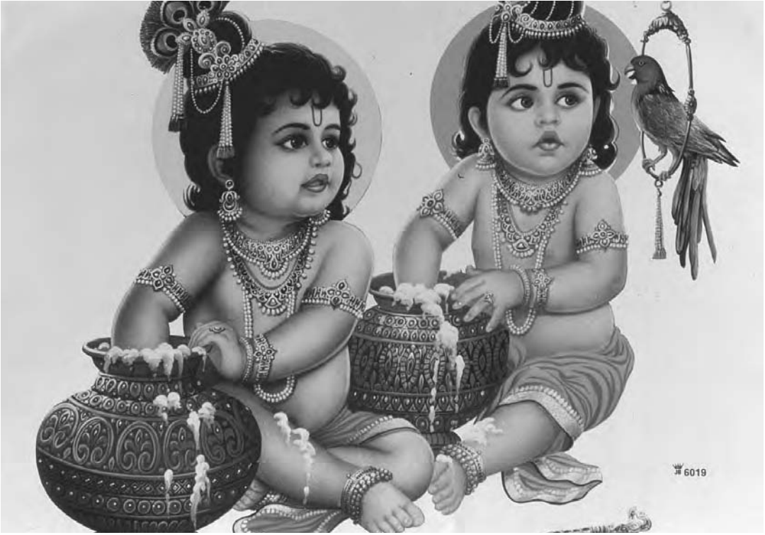
Bala-Râma plays with his younger, dark-skinned brother Krishna. They are both avatâras of Vishnu.