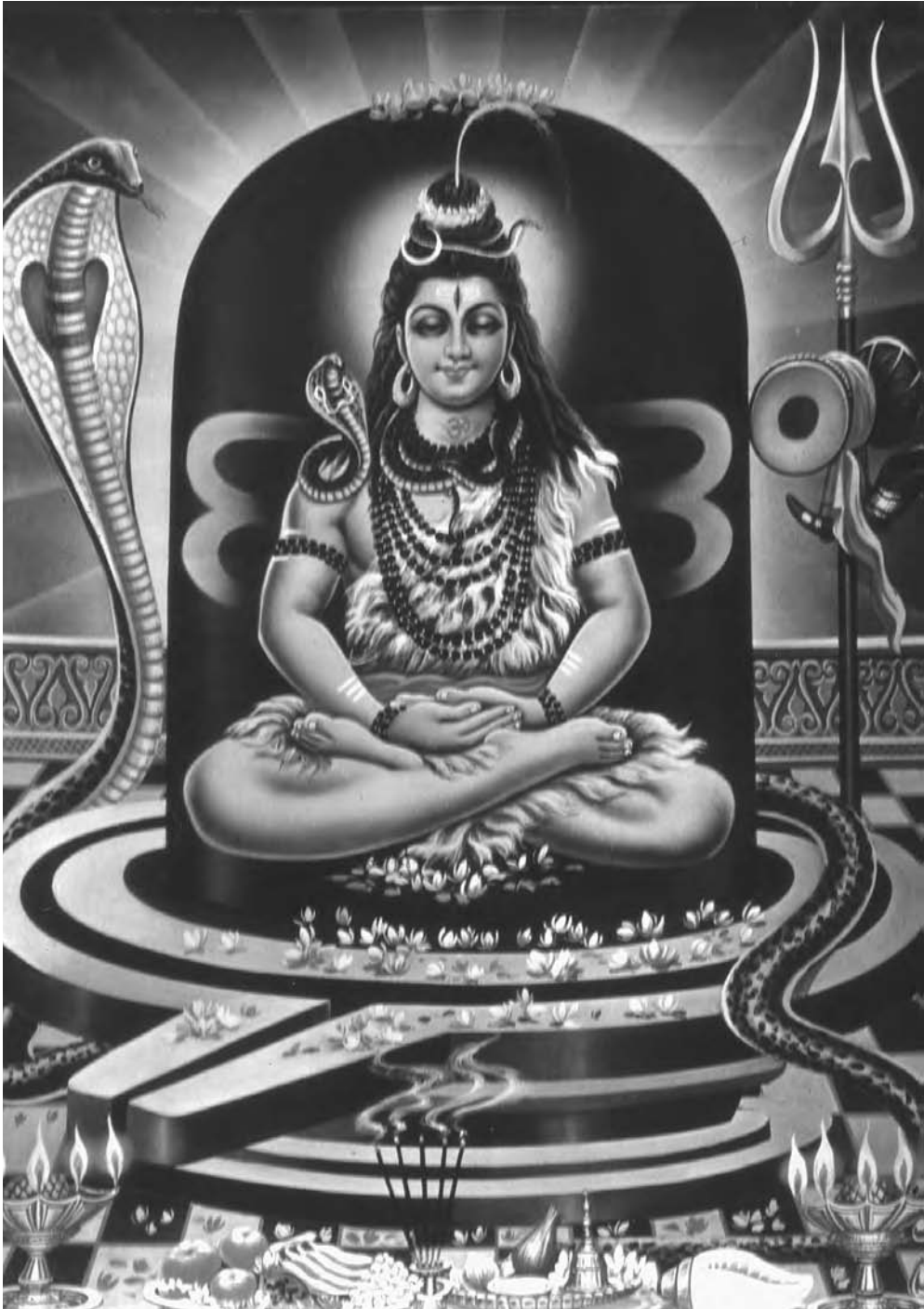
Śiva sitting in front of the Śiva Linga in this common representation (TRIP)