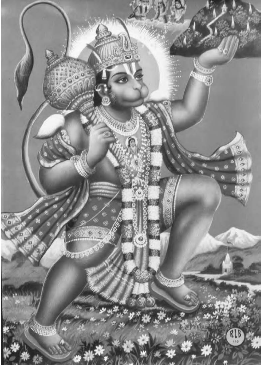
Hanuman, the paradigm of loyal friend in his service to Râma, takes his divine form in order to bring a mountain with healing herbs.