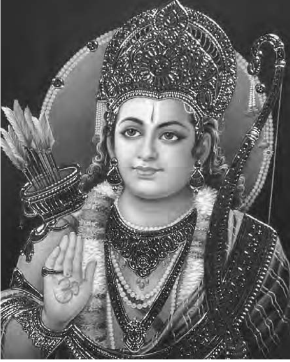
Śrī Râma, divine king and an avatâra of Vishnu

from raping her as he had done to so many women, including his nephew's wife. Râvana took Sîtâ to Lanka. Râma won the aid of Hanuman and Sugrîva and their monkey armies. (Was this a disguised reference to South Indians, Dravidians, helping Râma?) Hanuman built a causeway or bridge from the Indian subcontinent to Lanka, and Râvana was finally defeated. Technically, the reason for Vishnu's incarnation was complete. However, the myth's significance for modern India continued, with Râma's return to Ayodhyâ and setting up of his divine rule there. (In 1992 and 2002 Ayodhyâ was the focus of communal killings in the hundreds provoked by a desire to set up another period of ideal Hindu rule from Râma's birthplace and capital.)