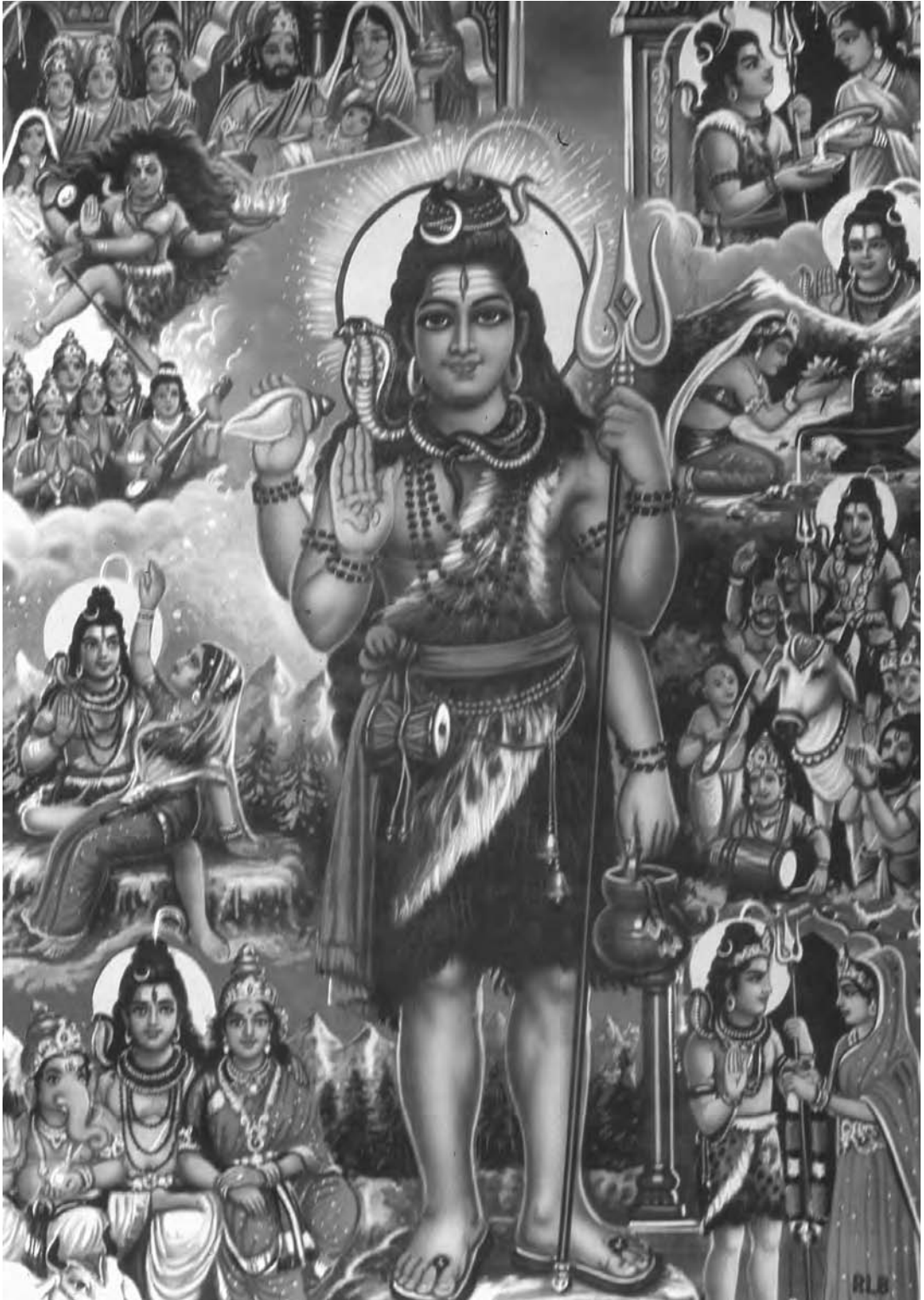
Śiva and key visual elements of his core mythology