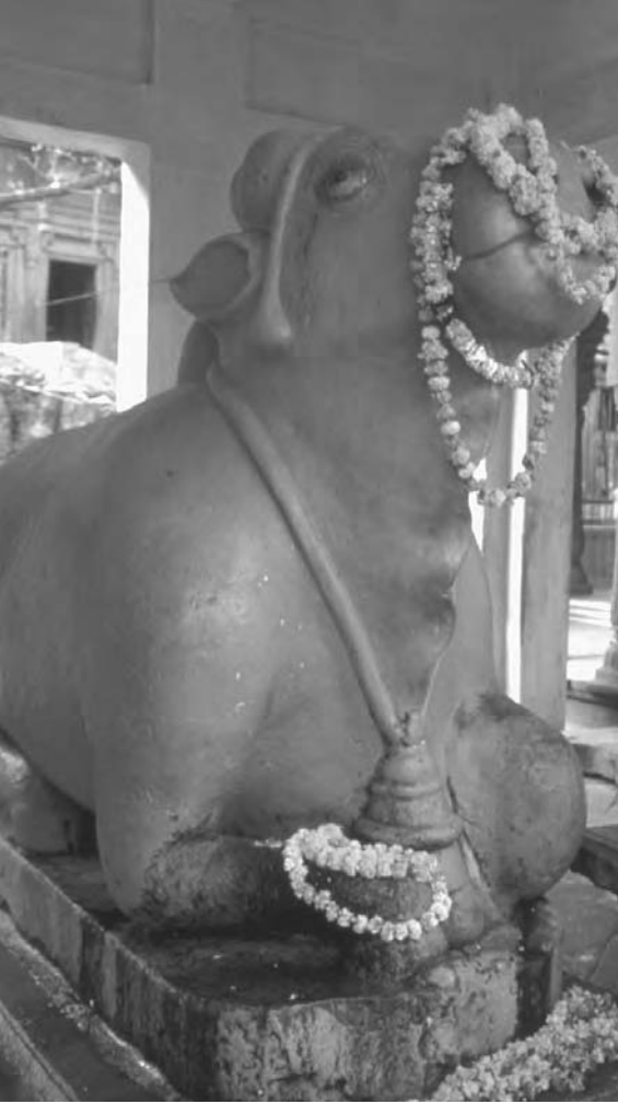
Nandi is Śiva's vâhana, his vehicle or mount.

In their next birth the two brothers became two trees in Ambâdi (Gokula) near the home of Śrî Krishna. One day as baby Krishna passed between the two trees, the two brothers received back their human forms.