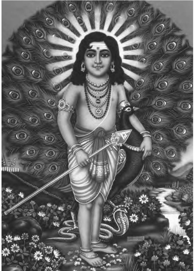
Skanda, the scarlet-hued form of the youthful god of war (TRIP)

See also Kârttikeya; Krittikâs; Pârvatî; Śiva; Subrahmanya