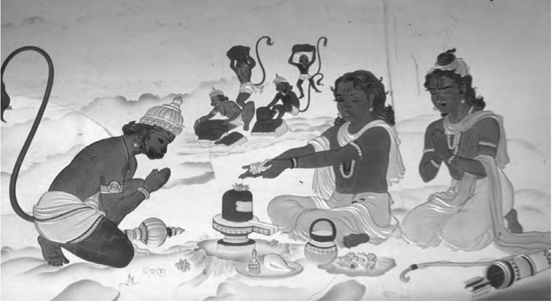
In the epic Râmâyana Hanuman serves Râma with pure devotion. (TRIP)

Bhavabhuti—were more secular than religious, more heroic than ascetic, and all quite tragic. By about the twelfth century the vernacular and regional poets like Ramayanas and Tulsidas had transformed not only Râma into the supreme lord but all elements including Râvana into loving devotion ( prema bhakti ). Everything had become an allegory of devotion, harmony, and bliss.