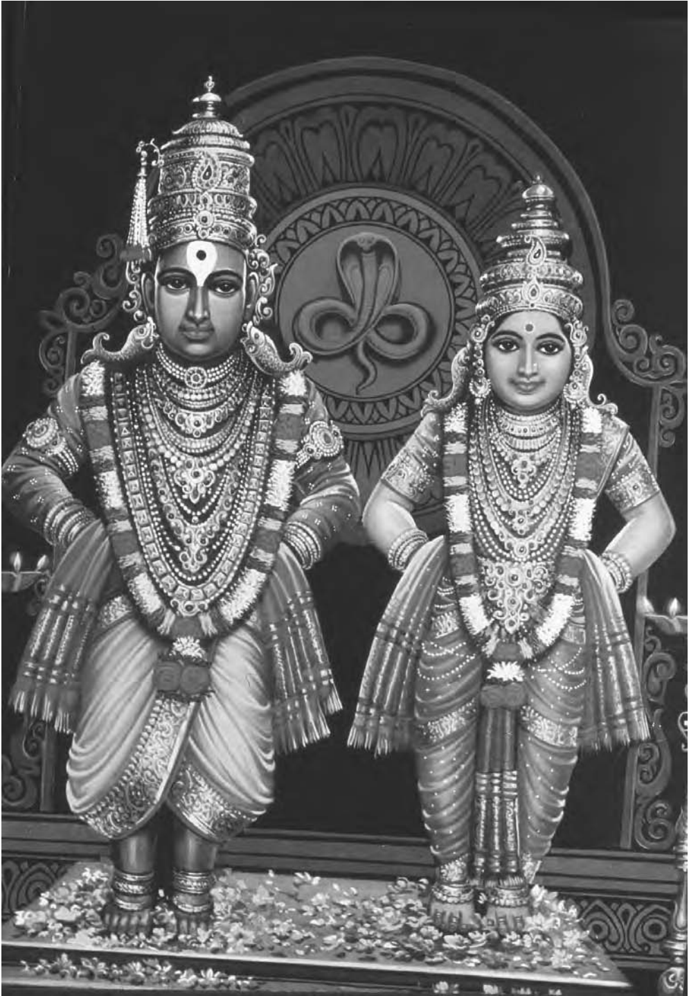
Lord Nārāyana, an incarnation of Mahāviṣṇu, with his wife Lakshmi, goddess of wealth