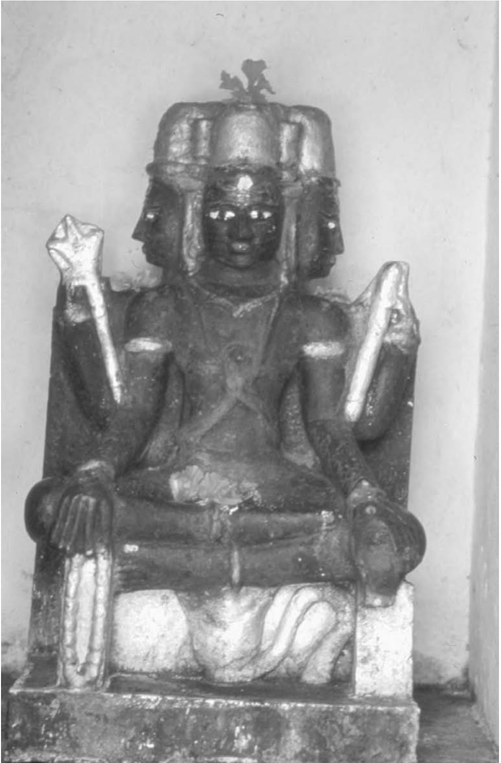
The four-headed Brahmâ is the creator in the Trimûrti or Hindu Triad, which also includes Śiva and Vishnu. (TRIP)