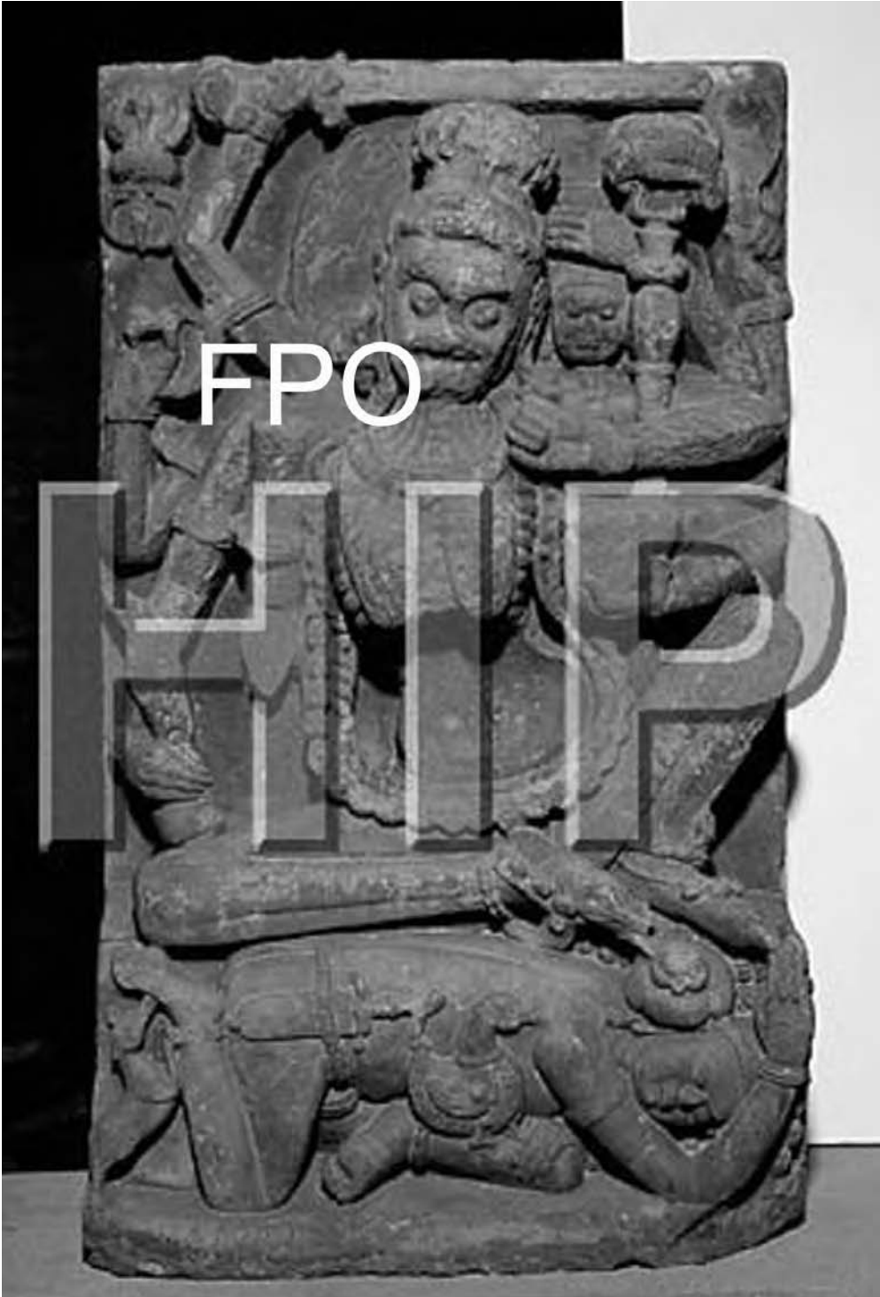
Sandstone figure of Cāmundâ, the fierce, protective eight-armed mother, from Orissa, eastern India, ninth century.