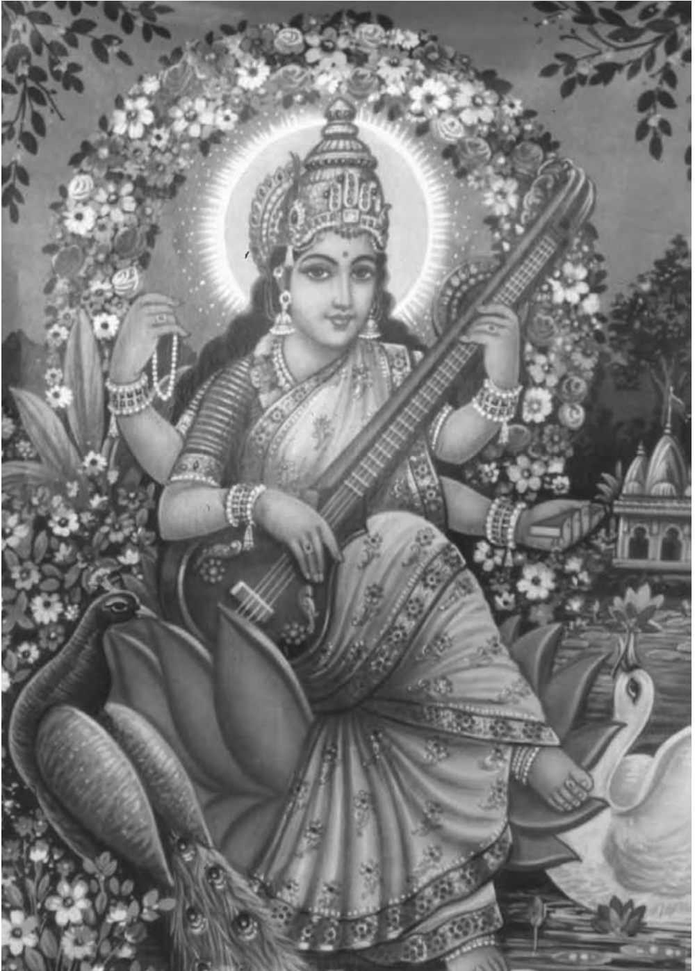
Sarasvatî, goddess of music, literature, and learning, was wife of Brahmâ but increased in popularity and importance. (TRIP)