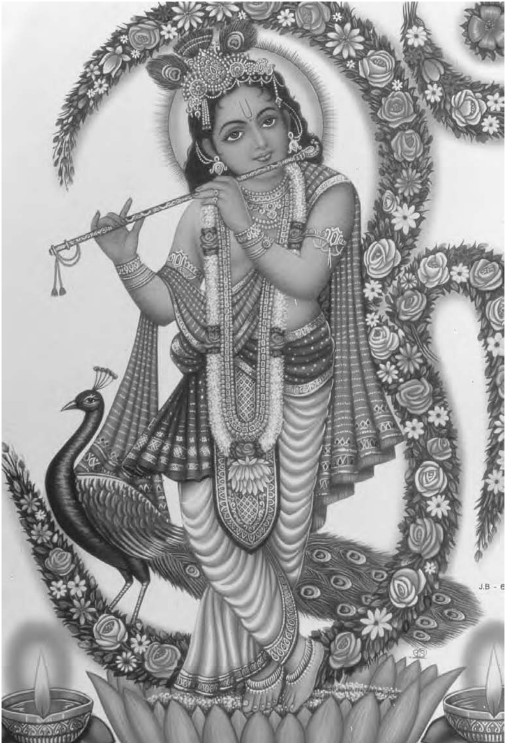
Śrī Krishna manifests in pure love, playing his magical flute in a call to devotion.