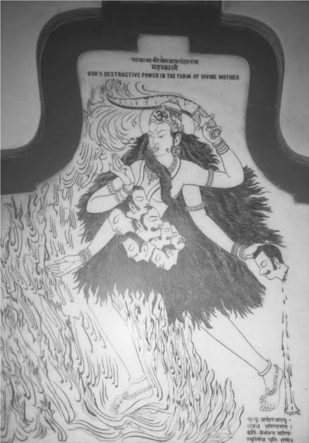
The Great Mother as Kali (TRIP)