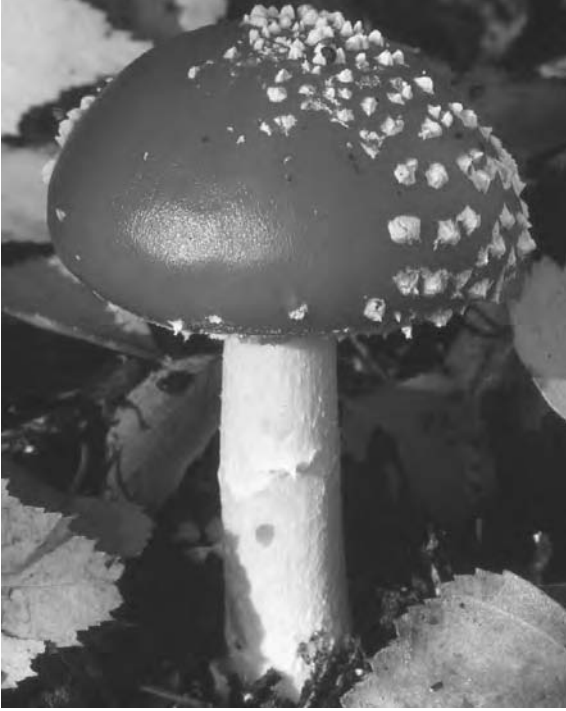
Soma, an ancient solar deity (the moon) and the drink of immortality, possibly from the pressings of a poisonous mushroom (TRIP)

driven away, reenacting the primordial combat between gods and demons or the conflict of the demons with the later guardians of soma, the gandhârvas .