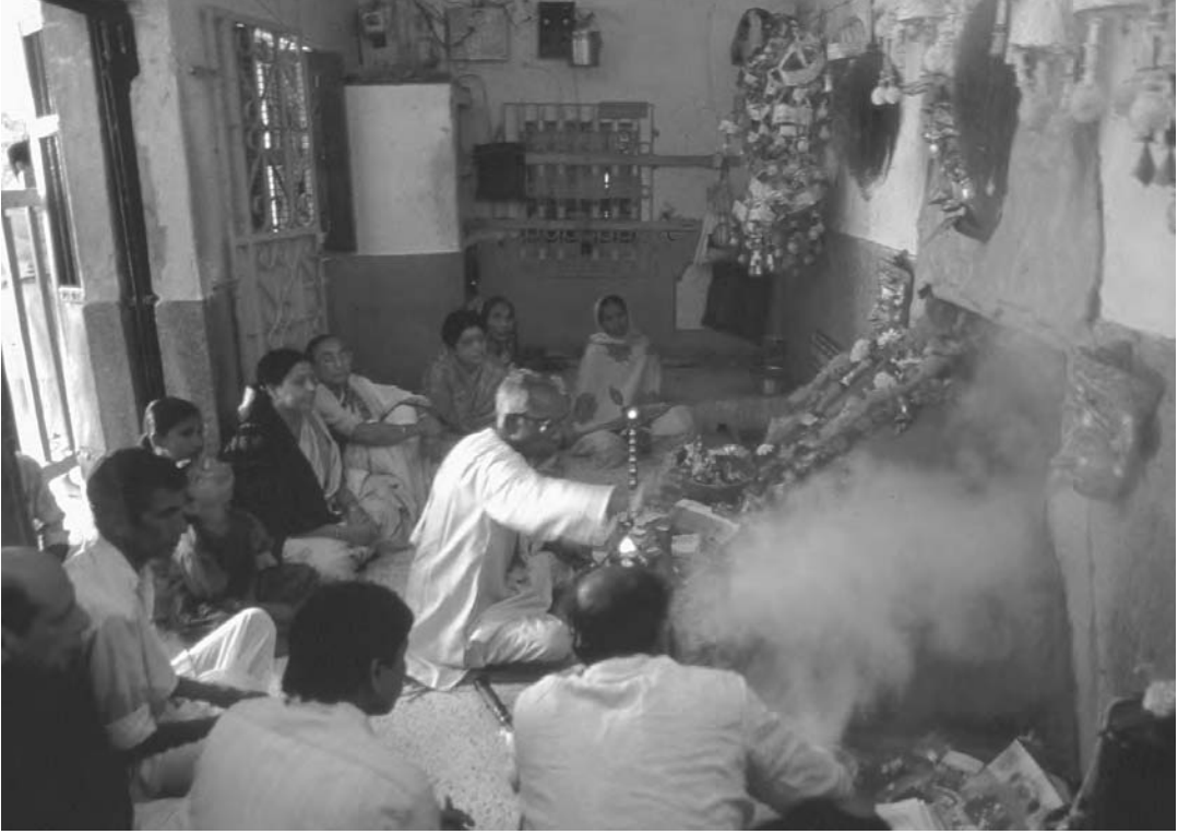
Pûjâ is worship, devotion, service to the divine, and a means to acquiring merit.