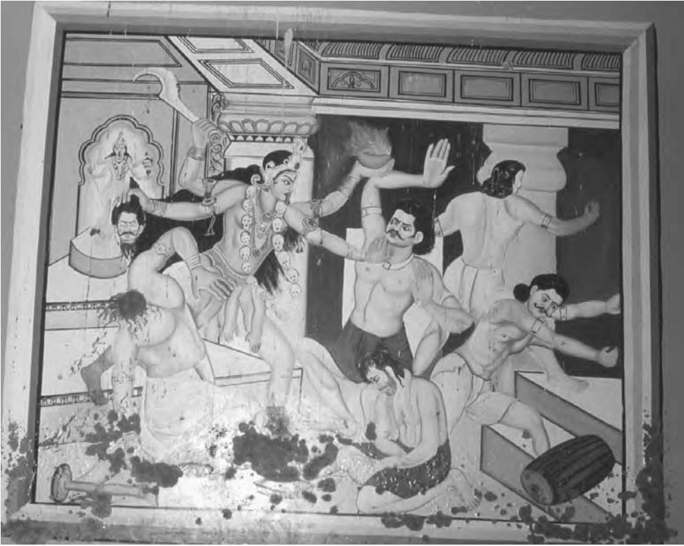
Devî manifests in many ways; here she kills yet more personifications of evil. (TRIP)