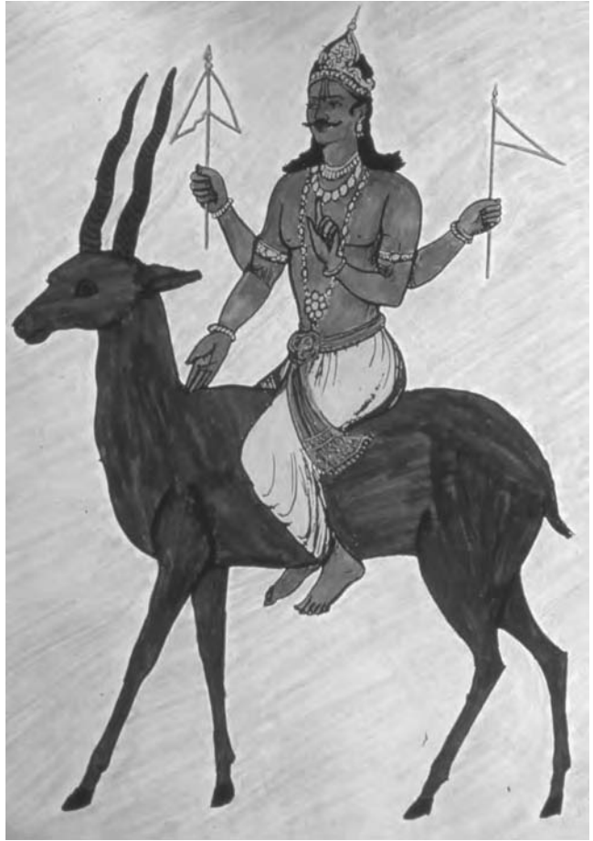
Vâyu, the wind, shown riding his vâhana, the antelope

Even so, many believe that the Vedas contain all knowledge ( veda ) past and future. All science has been discovered in some previous age, and there is evidence of the gods or demons using airplanes to cross the sky, as does Râvana