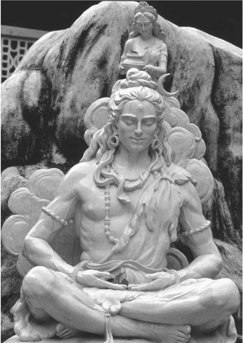
The heavenly Gangâ prepares to flow to earth through Śiva's matted locks.