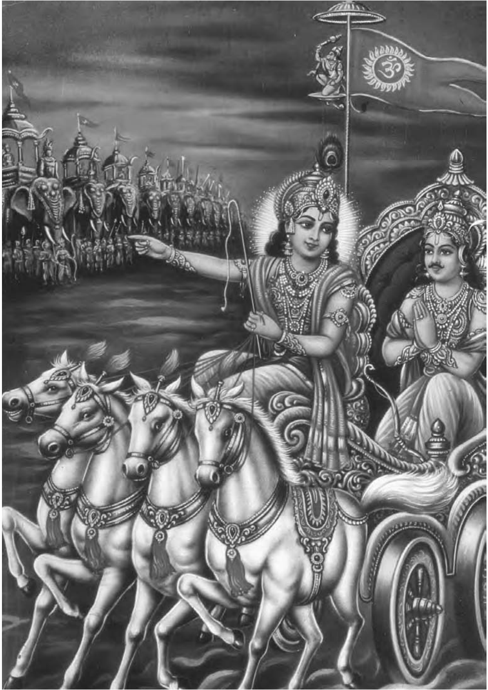
Arjuna is driven into battle by Lord Krishna.