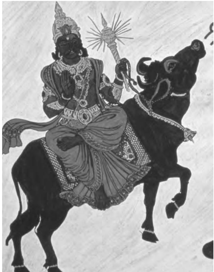
Yama, lord of death, riding his vâhana, the water buffalo

Yama came to be the god of death in later mythology, but he had wide range of roles in the earlier mythology. In the Rigveda Yama was one of the first pair. As such he was referred to as the first mortal (later being called the first human). His twin sister Yamî wanted him as her partner, but he refused. Later mythology charged him with incest. In the earliest mythology he was the son of Vivasvat, an early solar deity. Later he was assimilated into Dharma, god of social order, and made one of the guardians of the four corners of the earth (Lokapâlas). Yama was personified in the Katha Upanishad , and his talk with the youth