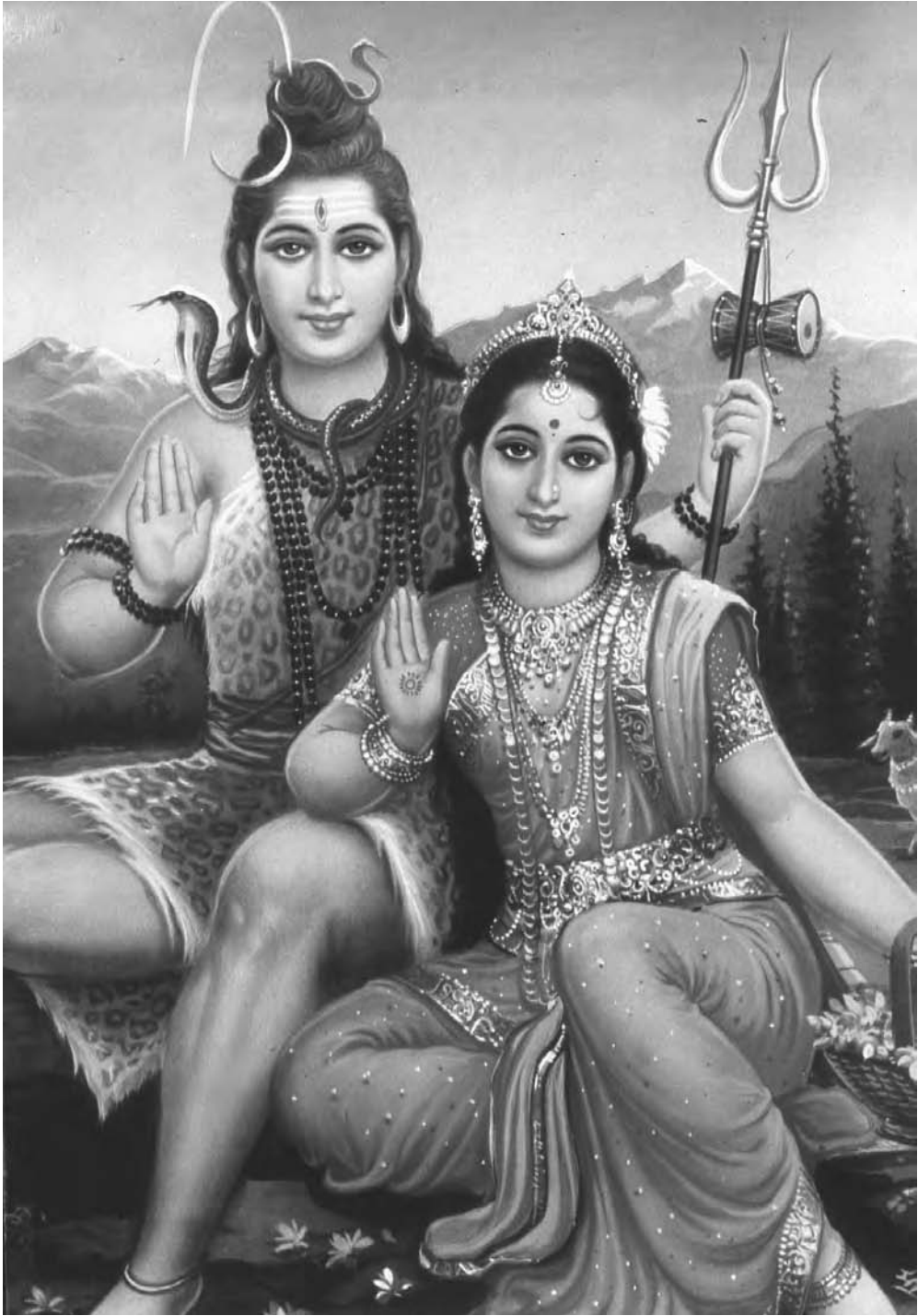
Pârvatî, daughter of Himalaya, wife of Śiva, and one form of the Mother, Devî (TRIP)