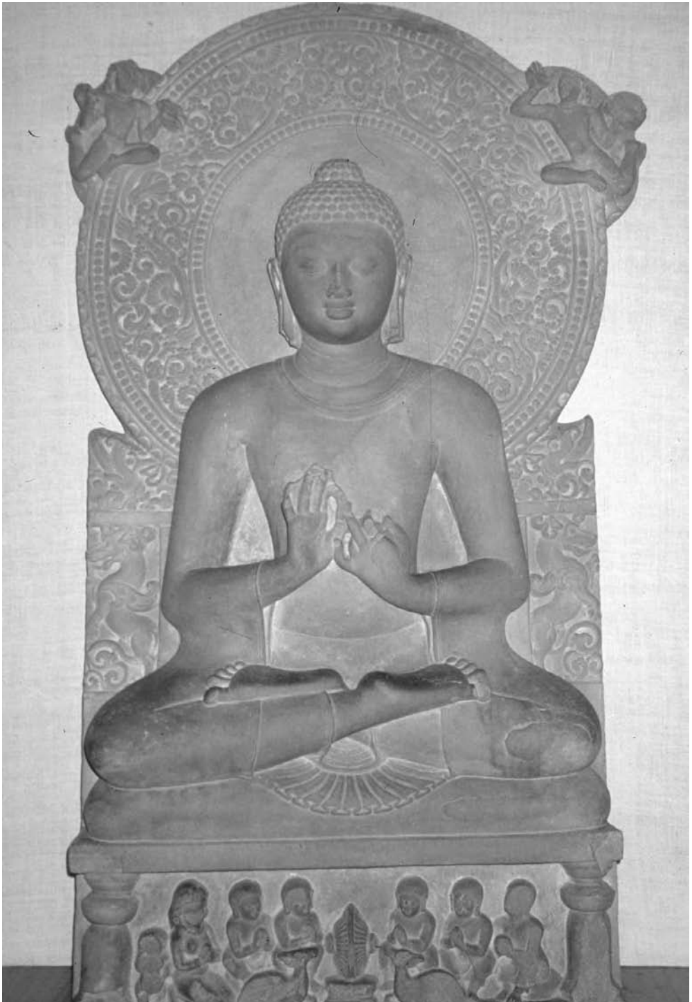
Gautama Buddha becomes merely an avatâra of Lord Vishnu in order to lead sinners astray with false teachings. (TRIP)