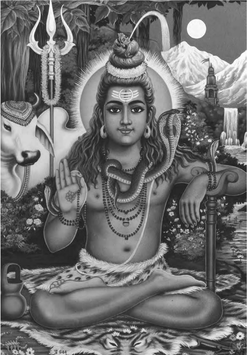
Śiva as Mahâyogi is the master ascetic.