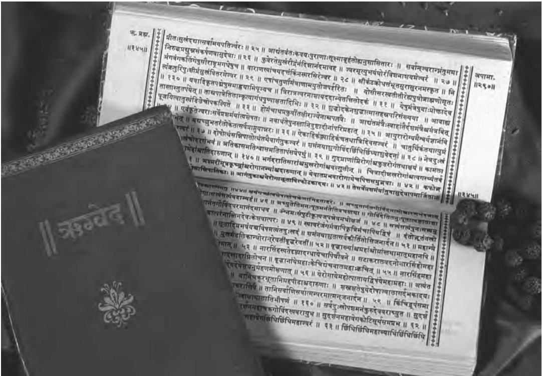
The Rigveda is one of the oldest continuously used scriptures in the world and Hinduism's most sacred. (TRIP)

contain a treasury of mythic themes, which were shaped and reshaped over the succeeding periods. There are several theological-philosophical hymns, such as the Purusha Śukta and the Nāsadiya Śukta , that suggest a high level of reflexive thought, reminding the student of Hindu mythology to look for multiple meanings in the same passage—metaphor, allegory, nonliteral allusions. This flexibility of Vedic thought encouraged later Hindu mythmakers to elaborate, conflate, and exchange quite freely the gods' life stories and personal characteristics, timelines, epithets, achievements, and failings.