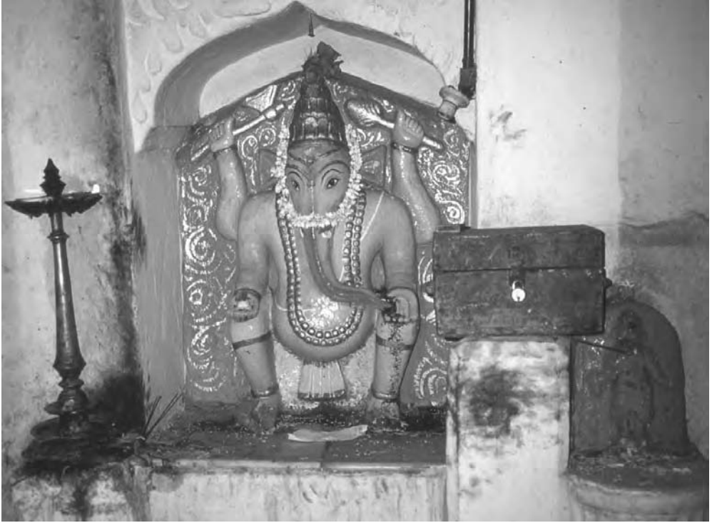
Ganeśa, son of Śiva, is worshipped for protection and as giver of wealth and remover of obstacles.

presided over by her husband Śiva, and presented her son. Śiva promptly apologized to all and gave Ganeśa command of his demon forces ( ganas ), acquiring a role that gained him the title Ganapati. Thus this version accounted for the origin of Vighneshvara, Gajânana, Ekadanta, and Ganapati, all different names of Ganeśa, without compromising Śiva as Lord of Yoga, asceticism. He was both father of Vighneshvara and still chaste.