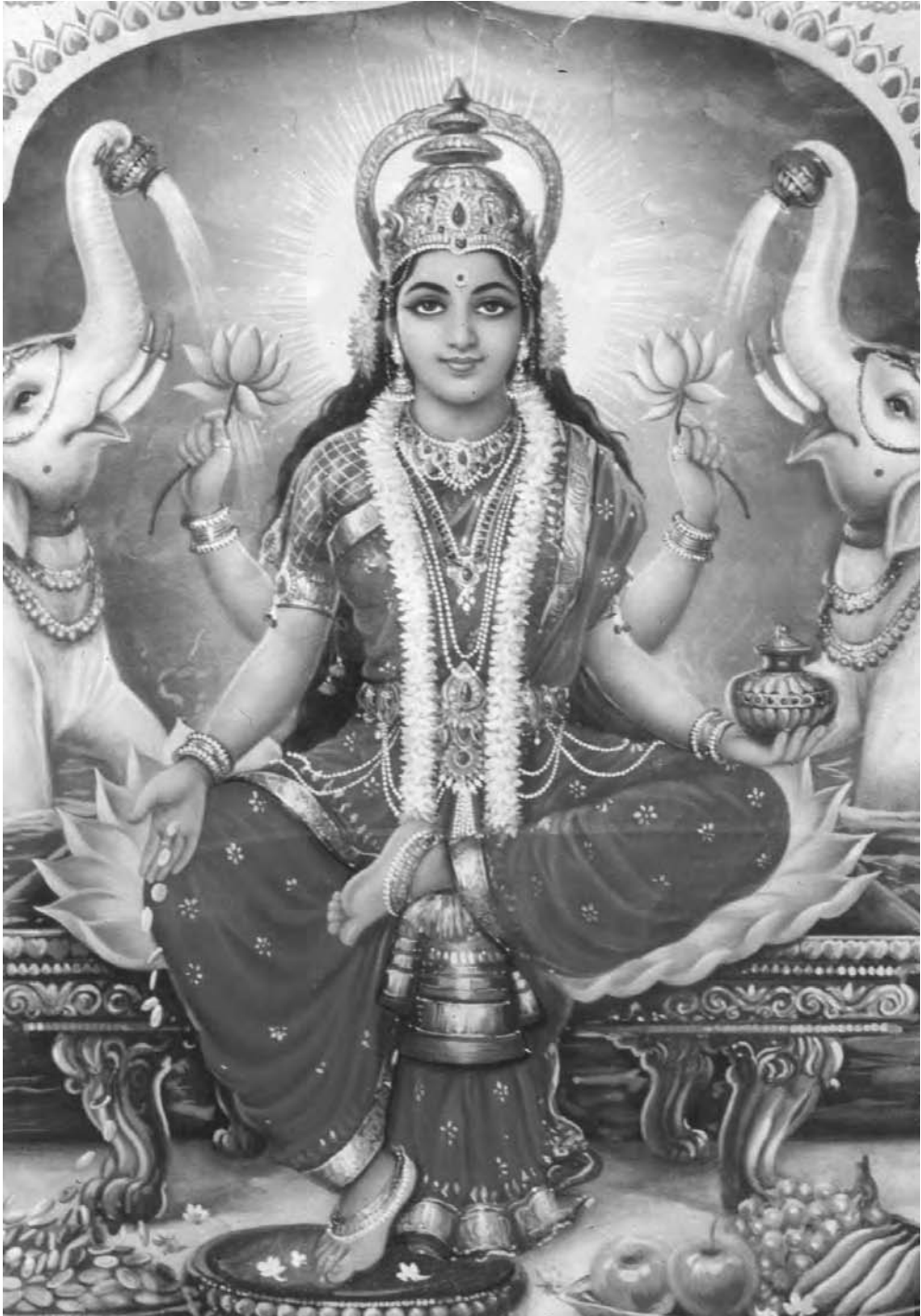
Lakshmi appears as Gajalakshmi, goddess with the elephants, giver of all that is good and bountiful in life.