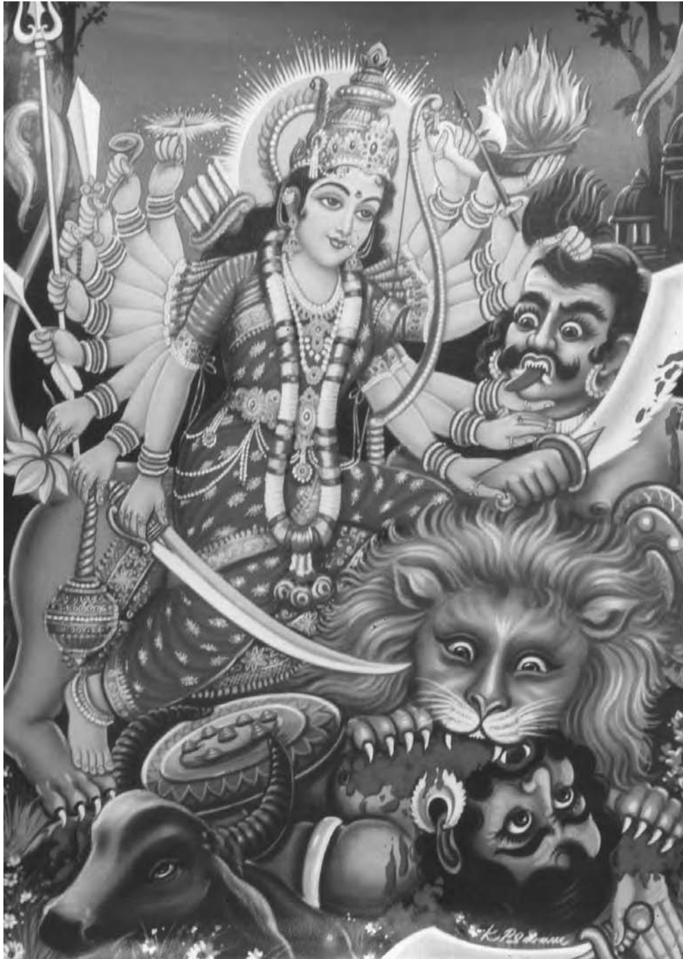
Devî manifests as Durgâ to destroy Mahesha, the buffalo demon. (TRIP)