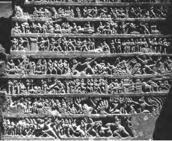
Battle scenes from the great or Mahâbhârata war

ally been said to have been dictated by the sage Vyâsa to his divine scribe, Ganeśa, who wrote it all down using his single tusk as the stylus. It is currently divided into eighteen parts, with two important appendices: the Harivamsha and the Bhagavad Gîtâ .