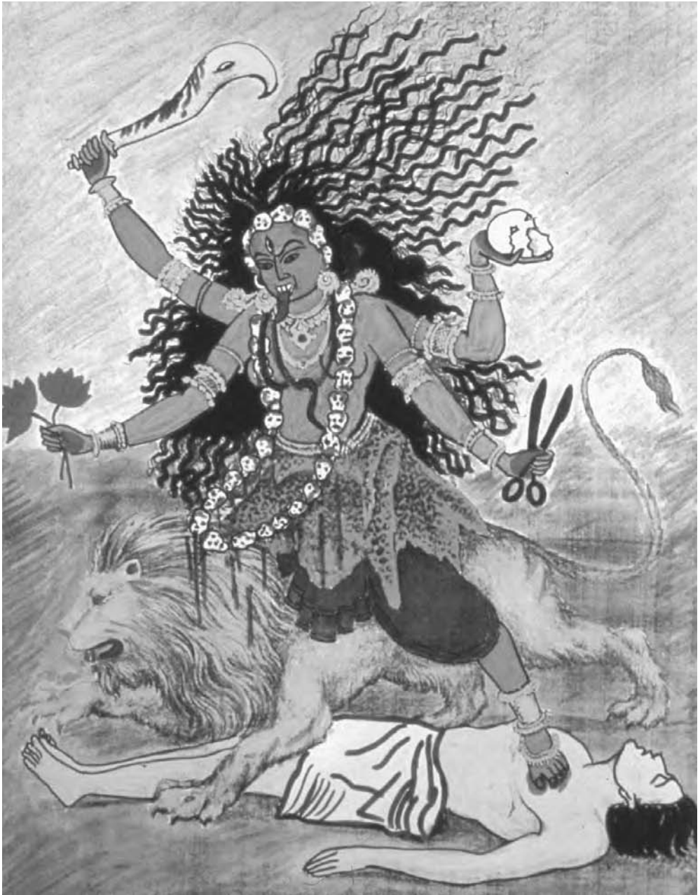
Kâlî, wearing a kapâla-mâlin (garland of skulls) and leaving all evil as a corpse, is the destroyer of fear. (TRIP)