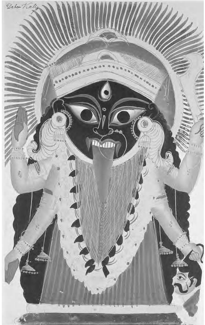
Kâlî, Hindu goddess of destruction, in an Indian painting from the nineteenth century

In some myths Kâlî appears as a voluptuous woman enticing both