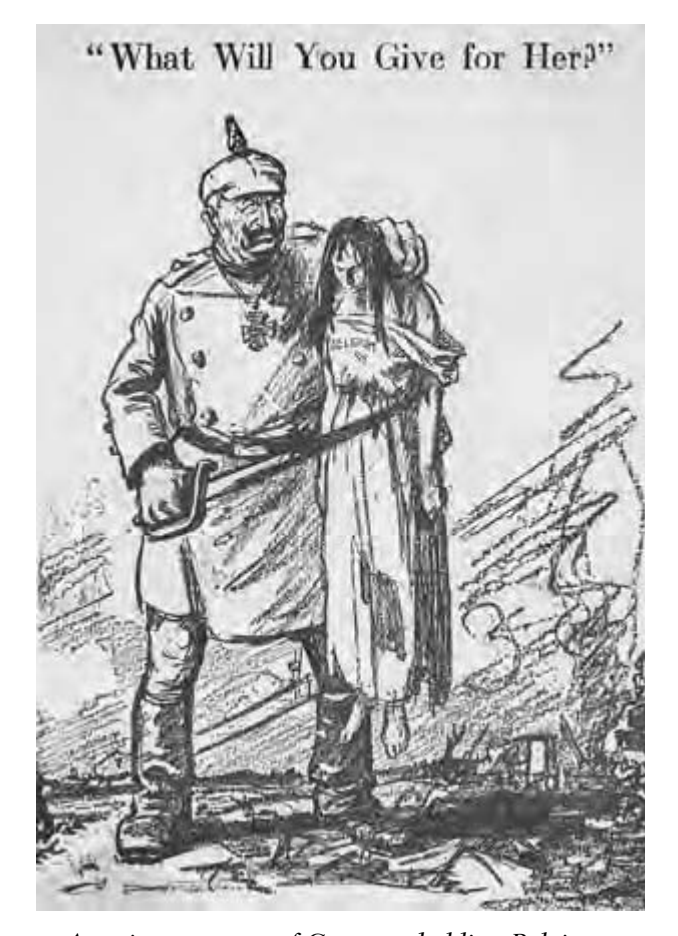
American cartoon of Germany holding Belgium, "What Will You Give for Her?"