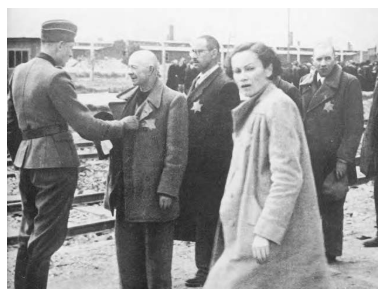
Selection process at Auschwitz concentration camp, Poland, ca. 1944. A German soldier stands with Jewish prisoners, identified by the yellow stars sewn on their coats.

woman-strong Women's Employment Service in Theresienstadt, the one concentration camp open to international inspection. The unique female labor service managed multiple industries and ensured that the women of this unusual concentration camp were fed properly until the camp was liquidated in the final months of World War II. In most ghettos, however, the Jewish councils decided that able-bodied men should be given the best chance for survival. Consequently, young men received the lion's share of the ghetto's food and resources. After the Nazis dissolved the ghettos in the autumn of 1942, the fragile Jewish communal structures disappeared, and voluntary, informal communities took their place. It was under these desperate conditions that women demonstrated