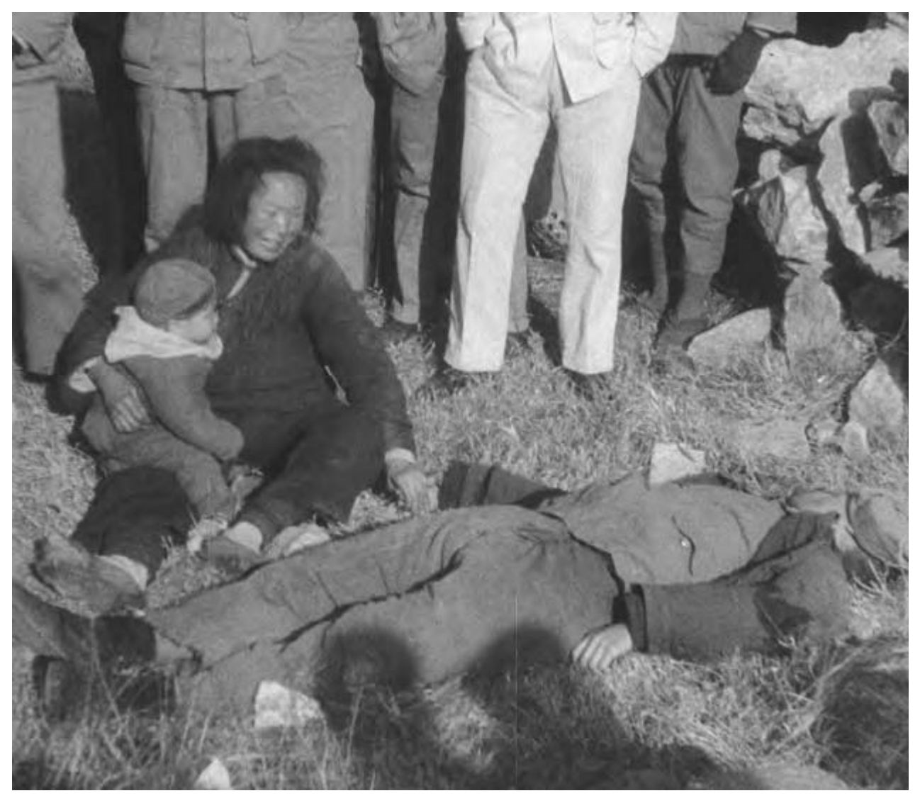
Chinese wife with body of slain husband in Nanking, China, December 30, 1937.