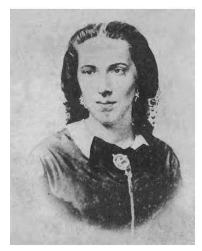
Belle Boyd, Confederate spy during the American Civil War.

England where they married in August and later had a daughter. He died soon after that. From England, Boyd published her memoirs, Belle Boyd in Camp and Prison (1865) in her continuing effort to recruit support for the Confederacy.