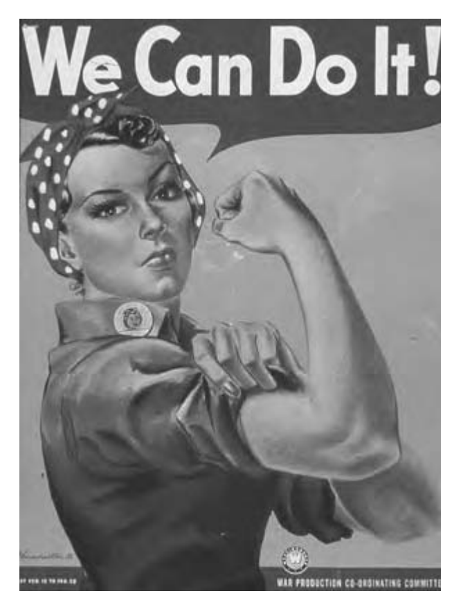
We Can Do It poster, featuring Rosie the Riveter.

berment. In addition, the work was often monotonous and highly repetitive, causing high levels of boredom that was often relieved through singing. This new image of femininity challenged earlier gender conceptions. Men, who were unhappy to see women do well in occupations that were previously only open to males, often subjected women to harassment and other forms of discrimination.