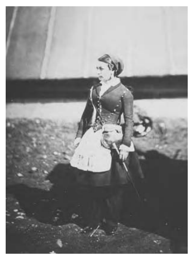
A vivandière, wearing Zouave regiment dress, during the Crimean War, 1855.

The French invasion of Algeria in 1830 returned vivandières to new prominence. Many women served in the bitter guerrilla warfare there for the next forty years. In 1832 the government reorganized vivandière regulations, and from 1830 to 1840 it reorganized education for enfants de troupe, making it much more formal and uniform. During the same period vivandières began to wear French army uniforms that were distinctly feminine but patterned on the uniforms of their regiments. These included trousers, which were illegal for French women to wear at the time. Though the law was enforced on civilian women, vivandières broke it with impunity. The midnineteenth century saw vivandières held up as examples of fashion and feminine virtue; ironically these examples also smoked, drank, used firearms, and wore trousers. Although some French feminist movements such as the Vésuviennes adopted vivandières' dress, feminism was unknown within the vivandière corps, and the women's rights movement entirely passed them by. This likely occurred because all of the feminists' demands that mattered to military