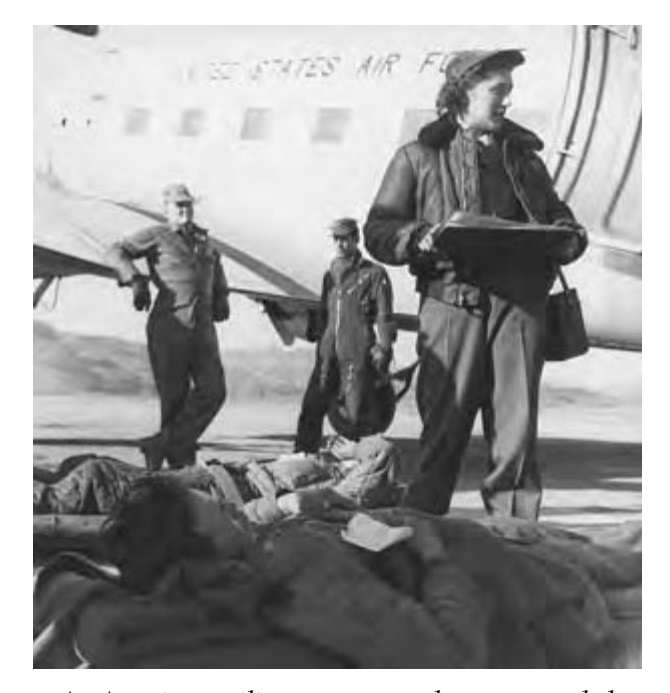
An American military nurse stands over wounded soldiers before directing the medical service technicians to load the soldiers on the military medical aircraft, 1953.

Korea were fully integrated in the military, serving in guerrilla units alongside their male counterparts as well as serving in military support roles.