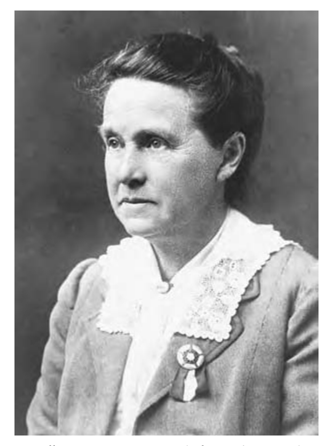
Millicent Garrett Fawcett.

full time to the cause of female suffrage. She was not a radical feminist but believed that women could fulfill their "female roles" better if they were given the right to vote. She supported the causes of safe working conditions and increased pay for women workers and worked against the female slave trade. She strenuously advocated the right of women to receive quality education and attend college. Her major contribution to the women's movement was her ability to organize and mediate between factions of the movement at a time when it splintered into many directions. She served as president of the National Union of Women's Suffrage Societies (NUWSS) from 1897 to 1919.