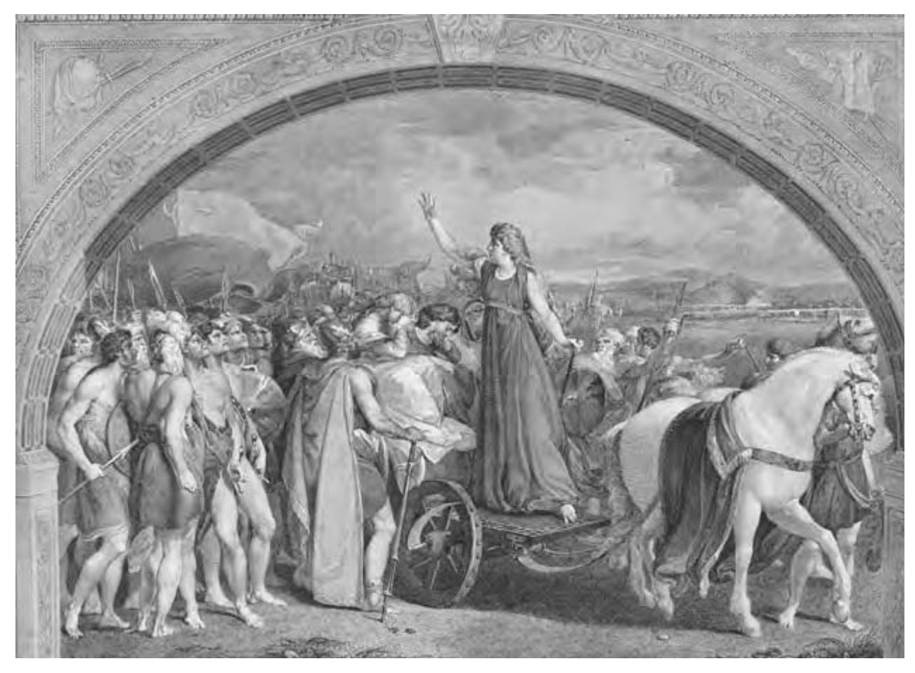
Celtic Queen Boudicca, who led Britons in rebellion against the Romans during the first century A.D.

terrain allowed Suetonius to hold off the Celts and, even though the numbers are probably exaggerated, may have killed 80,000 while losing only 400 Roman legionaries. Boudicca could expect no clemency from Rome after the atrocities committed at London and left the battlefield for Iceni lands, where she died shortly after the battle, although from wounds or self-administered poison is not known. She was buried secretly, probably with a royal horde of gold.