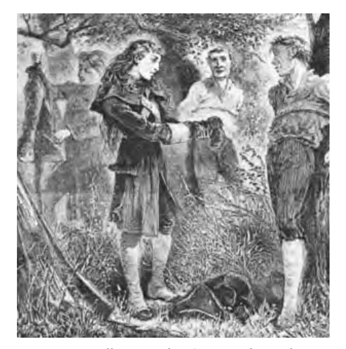
Women intelligence riders from South Carolina during the Revolutionary War intercepting dispatches.

allowed to go with them. Some women brought their children with them as well.