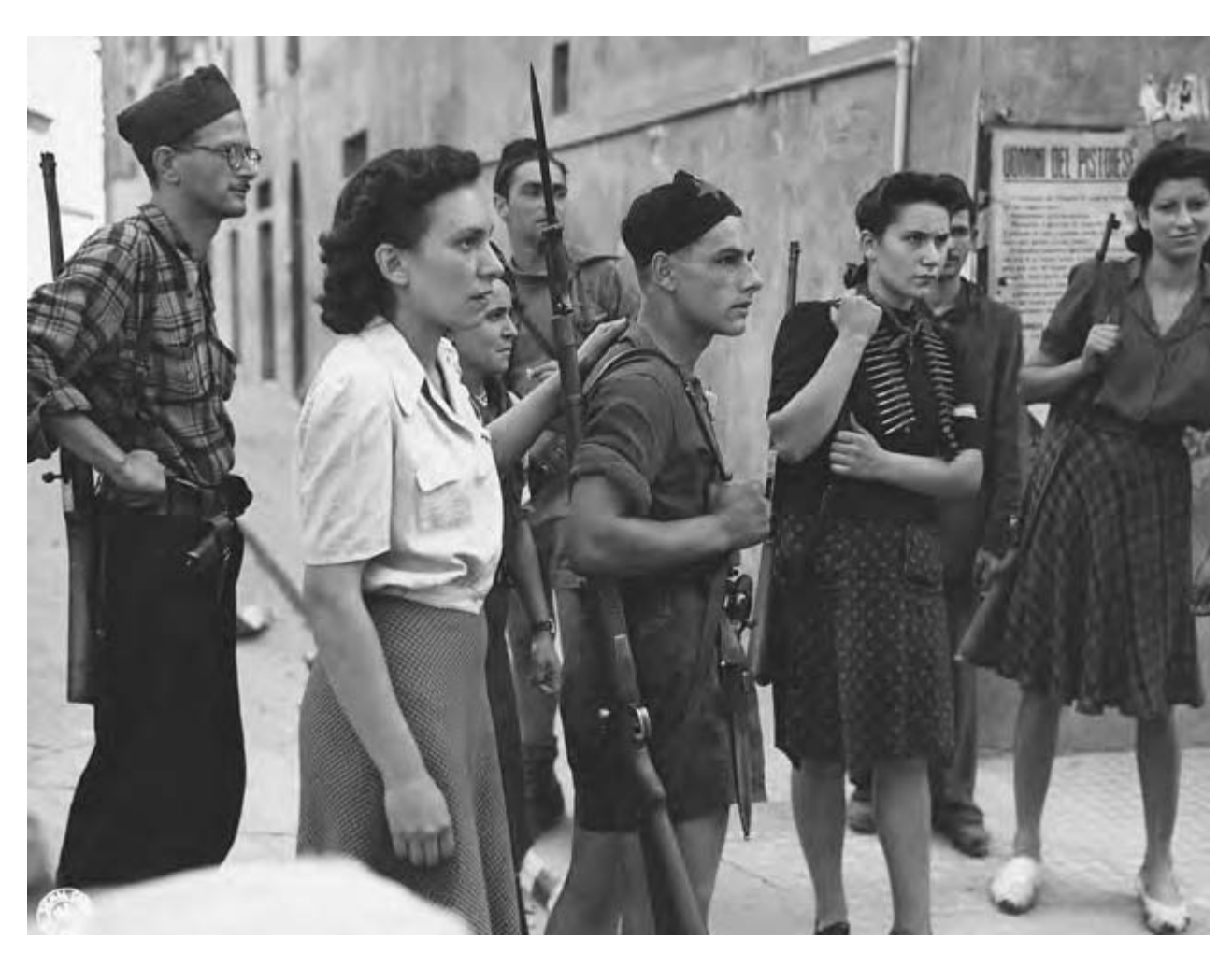
ITALY, WOMEN IN THE RESISTANCE DURING WORLD WAR II