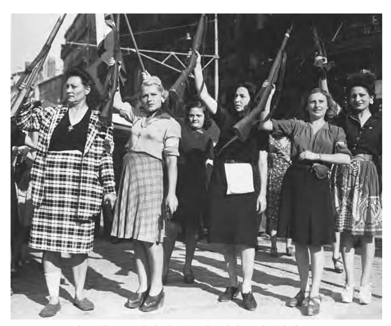
FRANCE, RESISTANCE DURING WORLD WAR II, WOMEN AND