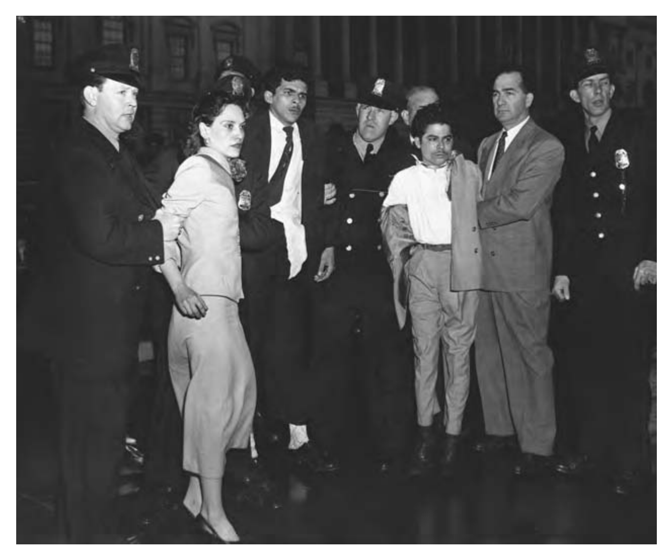
Puerto Rican nationalists, including Lolita Lebrón, seized by Capitol police after firing into the House chambers from the gallery and injuring eight congressmen, Washington, D.C., March 1, 1954.

Puerto Rican nationalist who led an armed attack on the U.S. Congress. On March 1, 1954, Lolita Lebrón led three male members of the Puerto Rican Nationalist Party into the U.S. House of Representatives. From the gallery above the members of Congress the attackers fired shots at the ceiling, unfurled the Puerto Rican flag, and shouted, "Viva Puerto Rico Libre!" (Long Live Free Puerto Rico!). No one was killed in the action. Lebrón was convicted and sentenced to fifty-six years in prison.