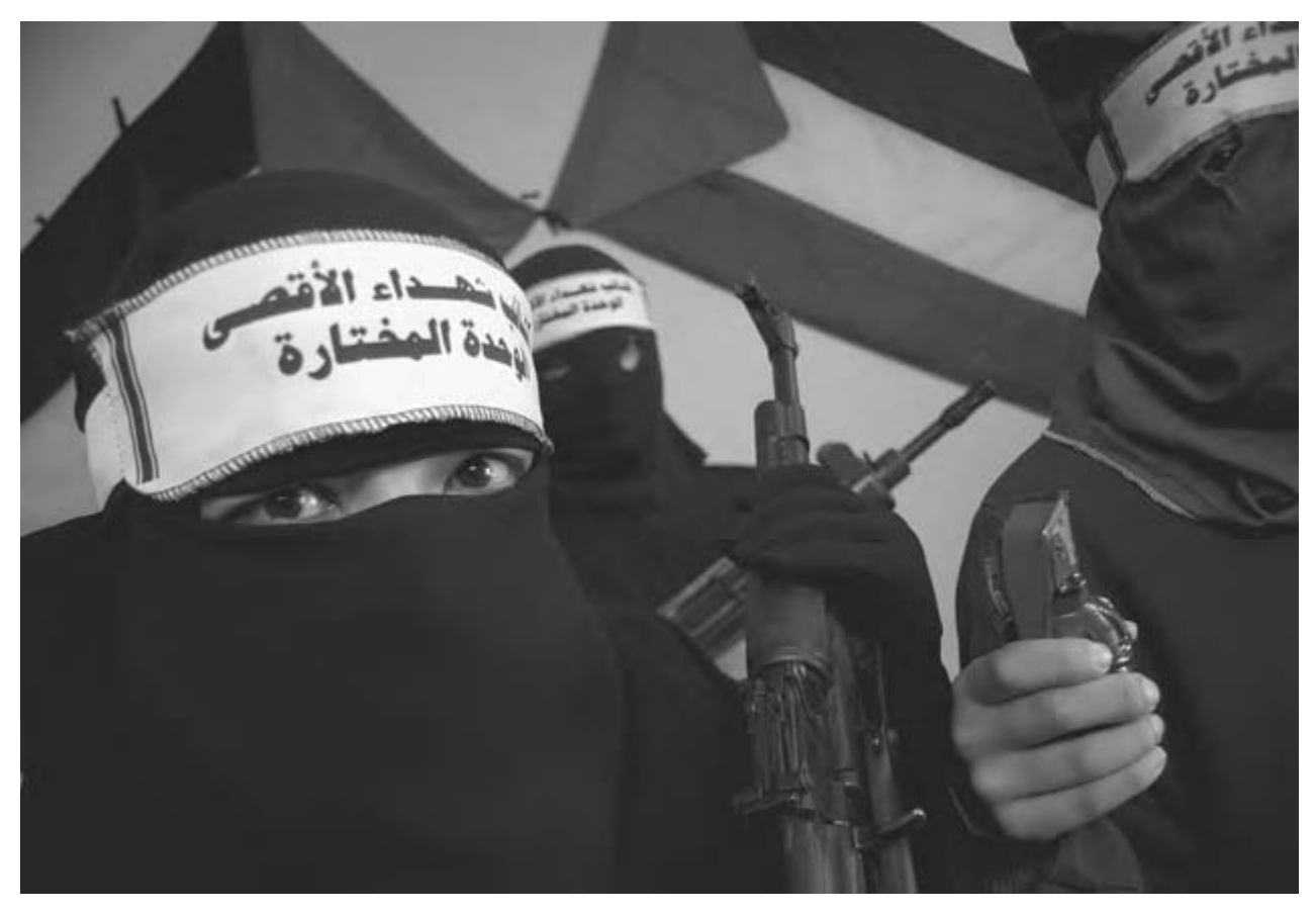
Three young women from the suicide bomber unit of the Al-Aqsa Martyrs' Brigade, Gaza Strip, 2004.