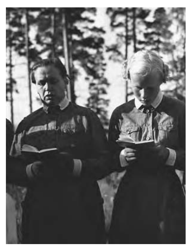
Two women of the Finnish Lotta Svärd read from books, 1942. The purpose of the Lotta Svärd, a volunteer organization made up of Finnish women, was to boost national morale and support the civil guard.

During the Winter War with the Soviet Union, Lotta members were not allowed into combat, but they did take up tasks in air raid and naval defense and in military communications, as well as in the supply, maintenance, and production of military clothes and equipment, in