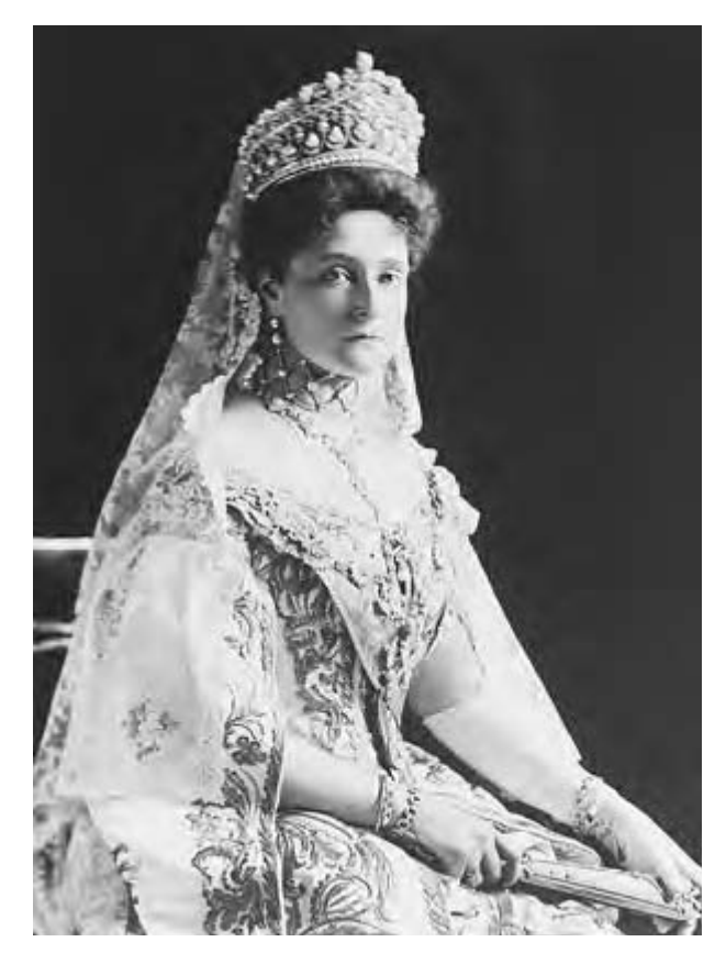
Russian Czarina Alexandra Fyodorovna.

forms such as giving more power to the Duma, Russia's representative assembly, and arranged the dismissal of capable government leaders such as the war minister, Andrei Polivanov. She also arranged the appointment of incompetent protégés of Rasputin, including Russia's new prime minister, Boris Stürmer, in January 1916. Alexandra ignored warnings that appointing a top official with a German name would be a grave provocation for the Russian public in the midst of a bitter war.