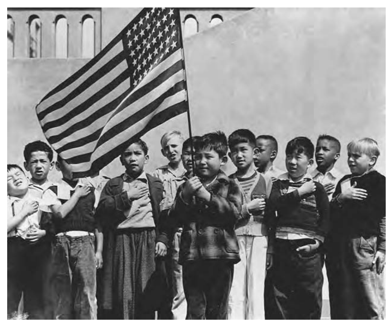
Dorothea Lange's photo of school children of mixed ethnicities, including those of Japanese descent, reciting the Pledge of Allegiance while holding an American Flag in San Francisco, just days before the relocation and internment of all Japanese Americans in San Francisco, 1942.

neighborhoods, processing centers, and camp facilities.