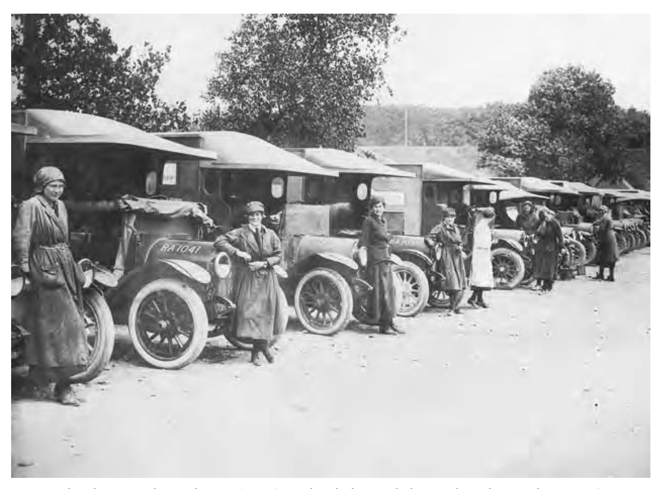
GREAT BRITAIN, WOMEN IN SERVICE DURING WORLD WAR I