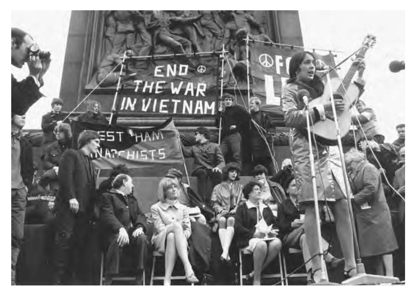
Joan Baez, American folk singer, in performance at an Anti–Vietnam War demonstration in Trafalgar Square, London, 1965.

Government agencies, including the Federal Bureau of Investigation and Central Intelligence Agency, followed her movements and attempted to silence her; she was also censured by various mainstream media and conservative organizations.