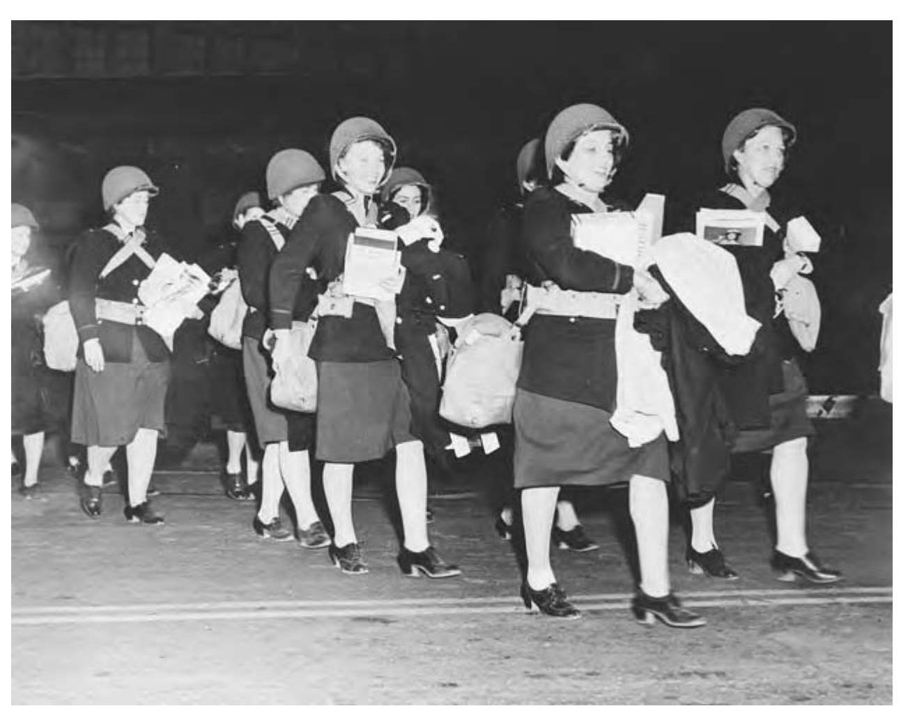
NURSES, U.S. ARMY NURSE CORPS IN WORLD WAR II