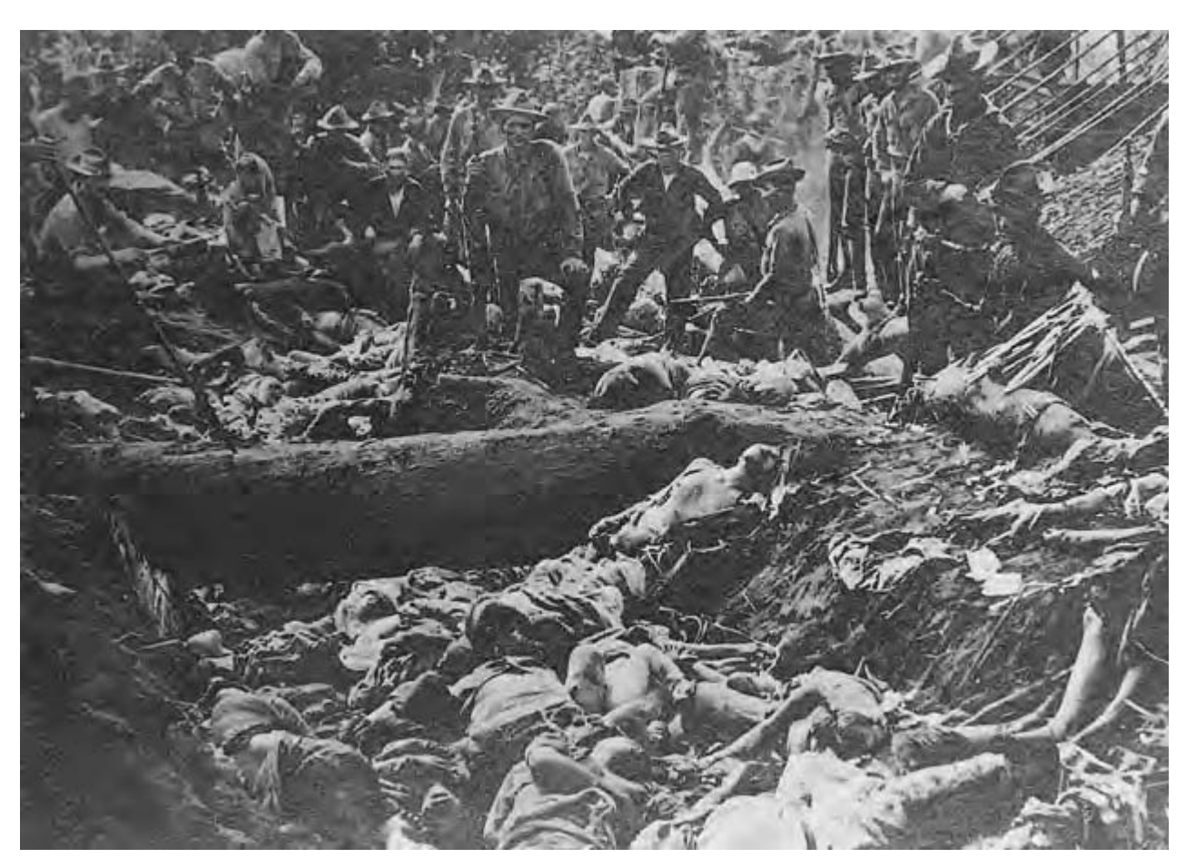
Philippines, Women during Suppression of the Insurrection in