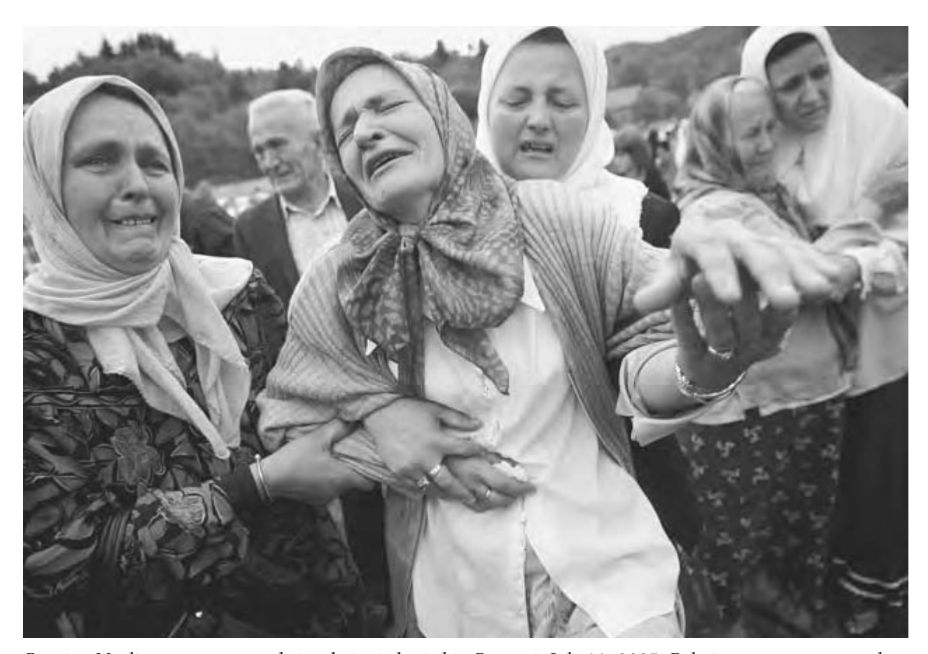
YUGOSLAVIA, WOMEN AND THE DISINTEGRATION OF YUGOSLAVIA