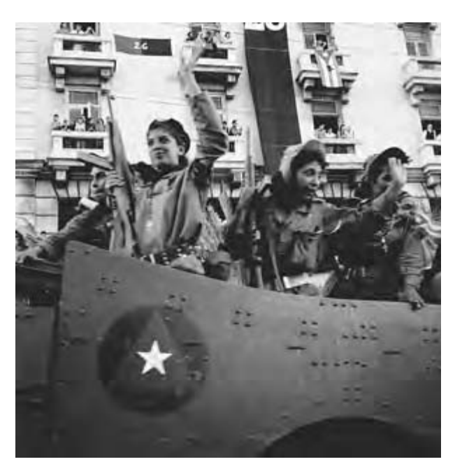
Women Cuban rebel soldiers wave on arrival in Havana, Cuba, 1959.

According to Che Guevara, women would constitute a necessary part of the revolutionary