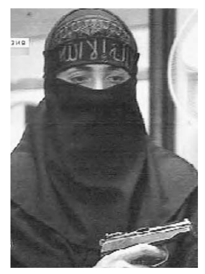
A woman, one of fifty armed Chechens who seized a crowded Moscow theater in October 2002, poses with a pistol somewhere inside the theater in this image from a Russian television station. Some of the women claimed to be widows of ethnic Chechen insurgents.

2003, after a referendum managed by the Russians, the Chechen Republic adopted a new constitution and organized a contested election that led to the nomination of a pro-Russian Chechen president. Russia subsequently claimed that the situation was improving, but, by early 2005, it remains dramatically unchanged.