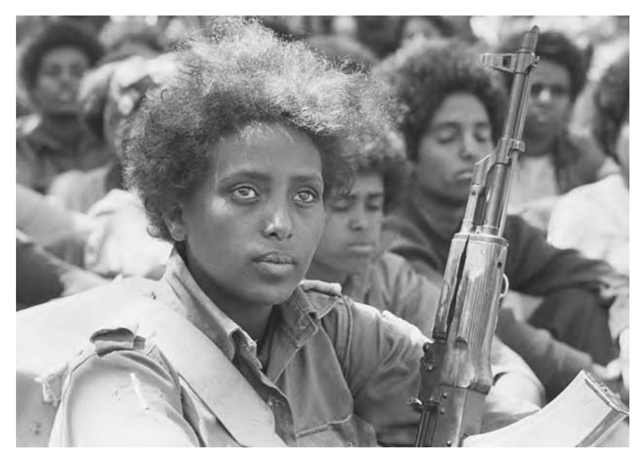
Young female soldier of the Eritrean Liberation Front, Eritrea, 1975.

After Eritrea won its independence on May 24, 1993, women were rewarded with legal guarantees, including the right to own property, to initiate divorce, and to gain custody of children. Thirty percent of the seats in the Eritrean parliament were set aside for women. One of independent Eritrea's leading political figures, Fawzia Hashim, the minister of justice, had gained prominence as a fighter during the war of independence. The independence war and the subsequent border war had a devastating impact upon Eritrea, however. More than 550,000 people were displaced and reduced to desperate conditions. The 30-year struggle left the countryside planted with 150,000 to 200,000 land mines. The death toll left 30 percent of Eritrean