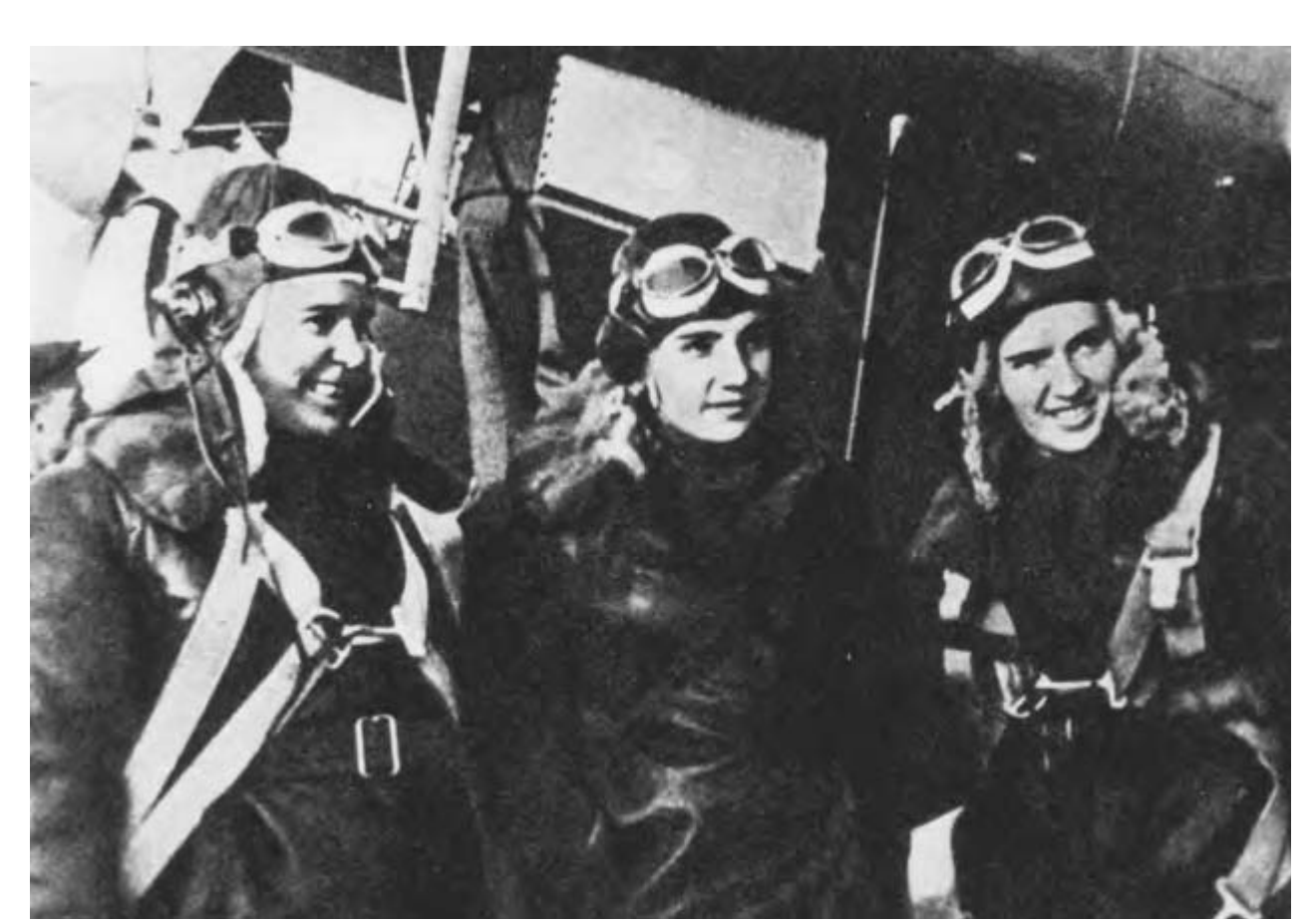
Soviet Union/Russian Federation, Women Heroes of the