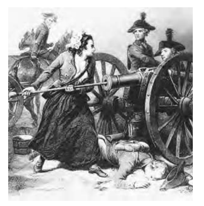
Mary Ludwig Hays—one of the women on whom the legend of Molly Pitcher might have been based—at the Battle of Monmouth during the American Revolution.

According to De Pauw, despite the legendary nature of the Molly Pitcher story, two men pres-