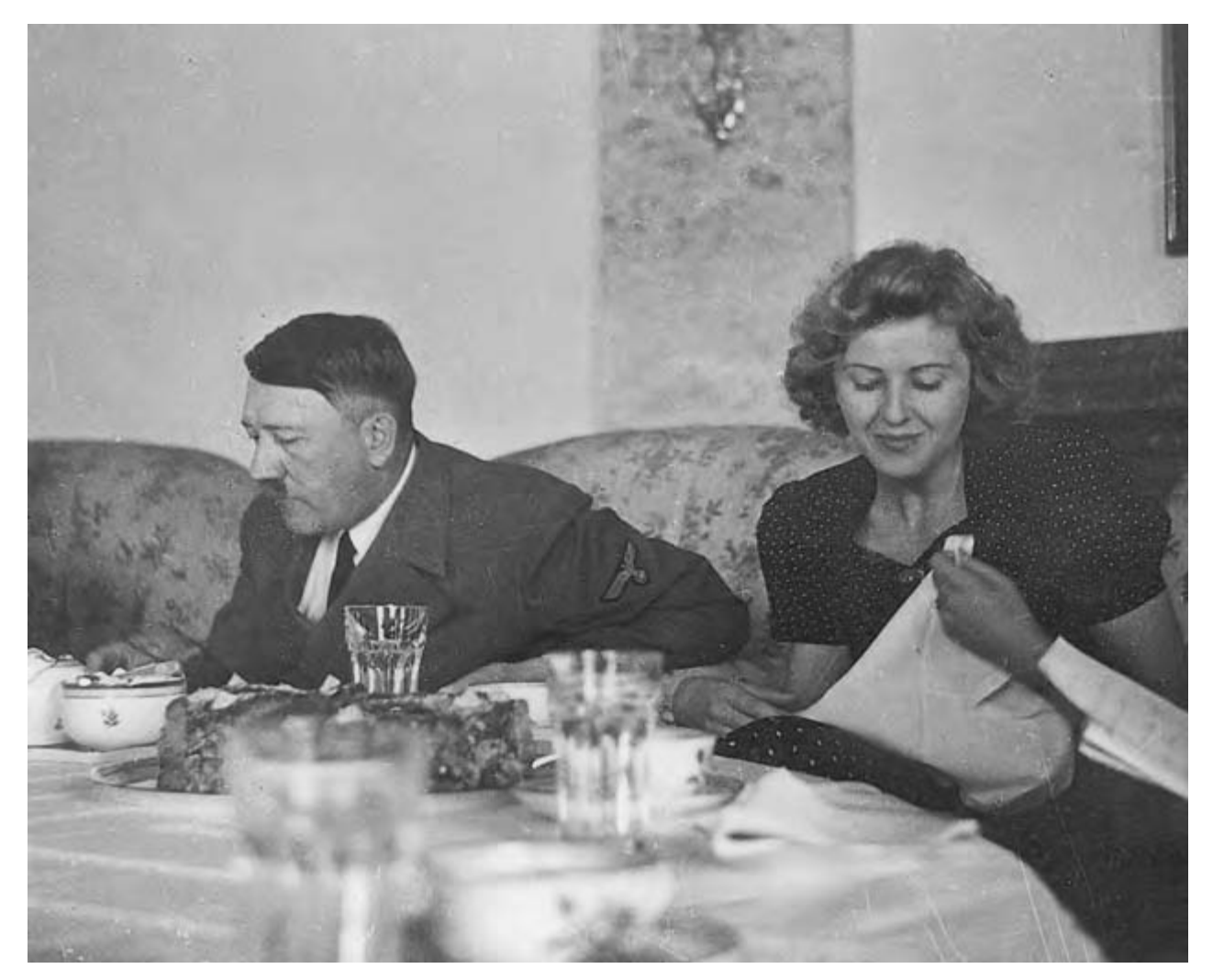
Eva Braun dines with Adolf Hitler.

their charred cadavers when they occupied the chancellery grounds.