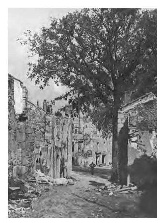
Oradour-sur-Glane, September 26, 1944.

The SS unit entered Oradour after driving people from surrounding farms and hamlets into the village. The troops ordered all the people in the village to assemble in the village center for an identity check. The men were separated from the 400 to 500 women and children, who were then forced into the village church (Kruuse 1968, 52). The SS then began the slaughter, shooting the men or forcing them into buildings that were set afire. Killings also began at the church and the building was set afire, incinerating those who had not been shot. More than six hundred men, women, and children were murdered (Kruuse 1968, 81). Few escaped the slaughter.