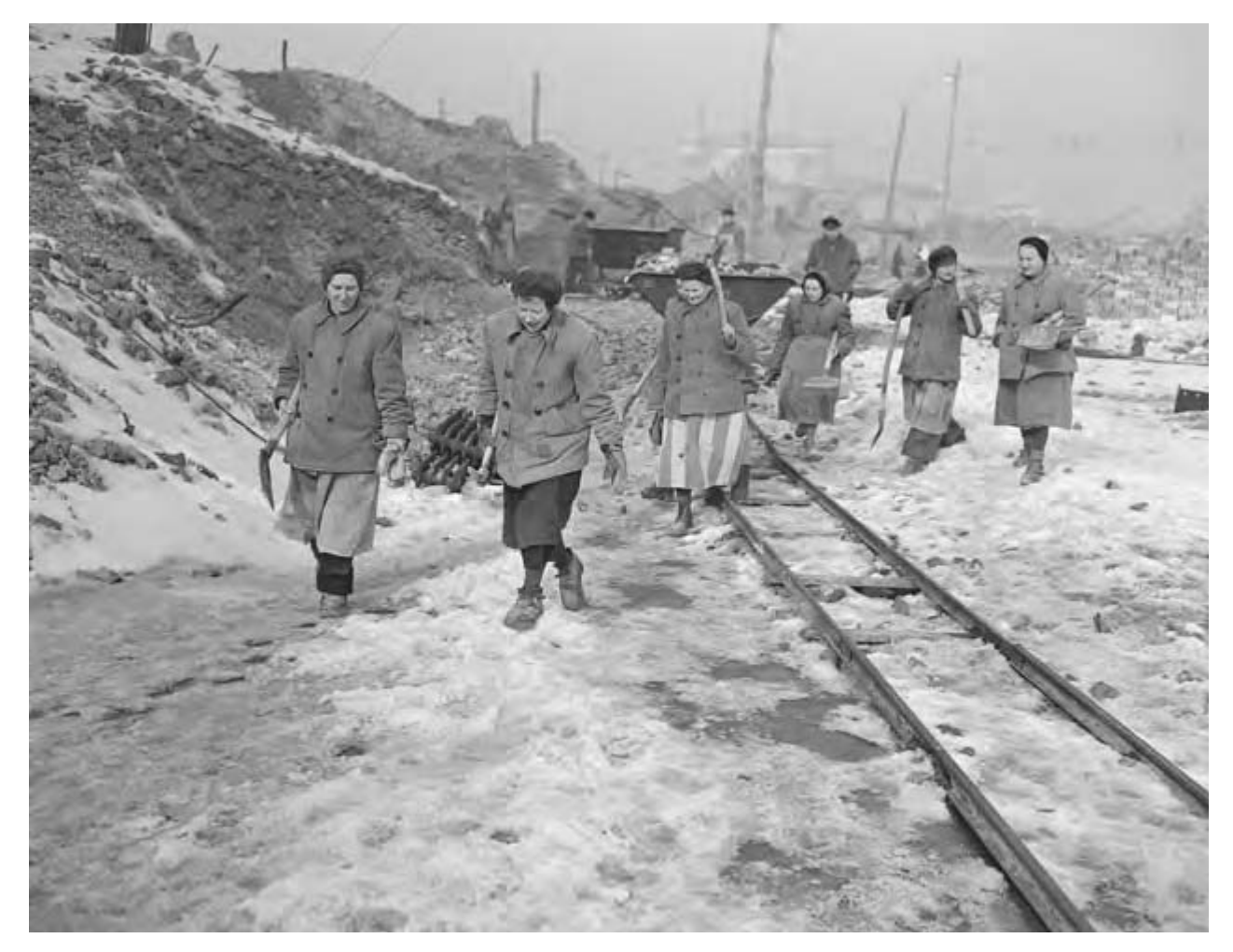
Trümmerfrauen, or rubble women, in the British section of Berlin as they leave work for the day, 1948.

Originally, occupation authorities forced families of National Socialist party members to clear rubble as part of the denazification process. The intense destruction of German cities, however, required authorities to compel larger sections of the populace to work removing debris. Almost all women ages 15 to 50 and men ages 14 to 65 were legally required to register with the unemployment office, although mothers of young children, students, and the disabled and sick were exempt from employment. The type of employment determined the level of ration card they received. Those involved in more strenuous labor, such as Trümmerfrauen, received a card that allowed them more calories per day. Immediately after World War II, each German received on average 1,100