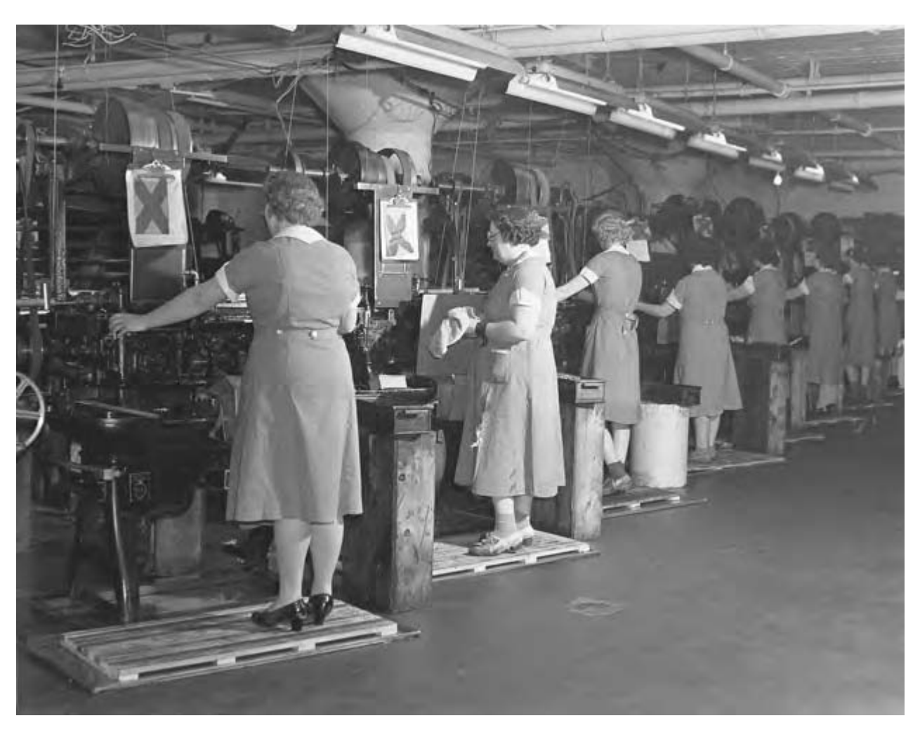
UNITED STATES, HOME FRONT DURING WORLD WAR II