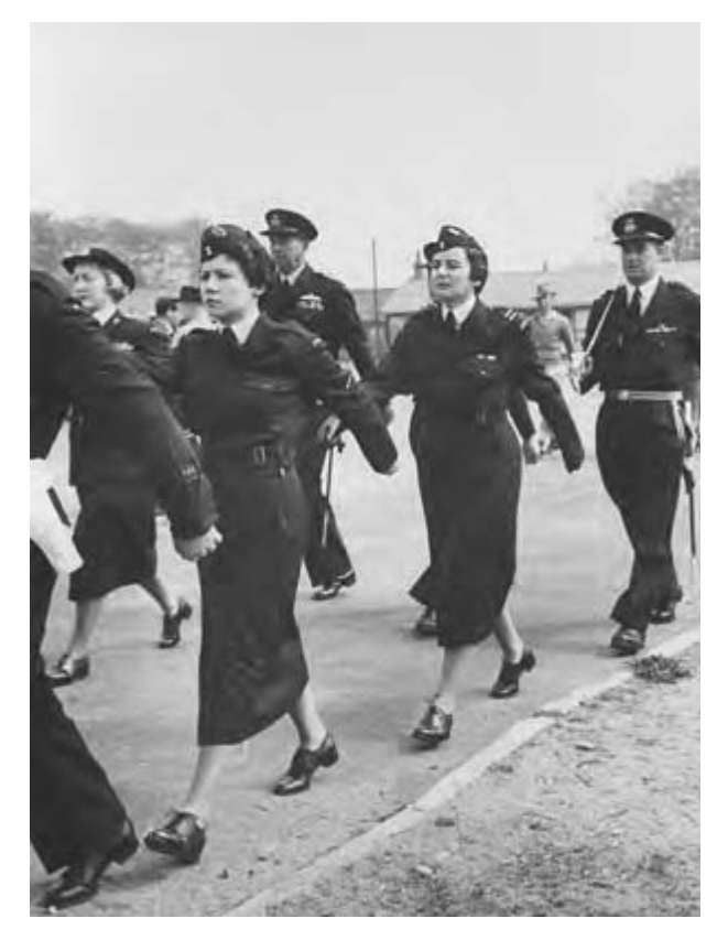
Women officers in the Australian Armed Forces.

Role of Australian women during World War II. During World War II, Australian women played a broader and more active role in the war effort than they had in World War I. The Australian Army Nursing Service served abroad as it had done in World War I. In addition, Voluntary Aids Detachments (VADs) were set up to provide needed service in Australia. The women's services of the Australian army, navy, and air force were initially organized to provide radio operators. By June 1941, voluntary aides, who had been mobilized into special Australian Army Voluntary Aid Detachments, were permitted to volunteer for service in North Africa. By December 1941, the Australian Army Medical Women's Service was formed from VADs working in military hospitals. Fifty thousand women enlisted for the various Australian female military services, and in 1945 the number serving was fortytwo thousand.