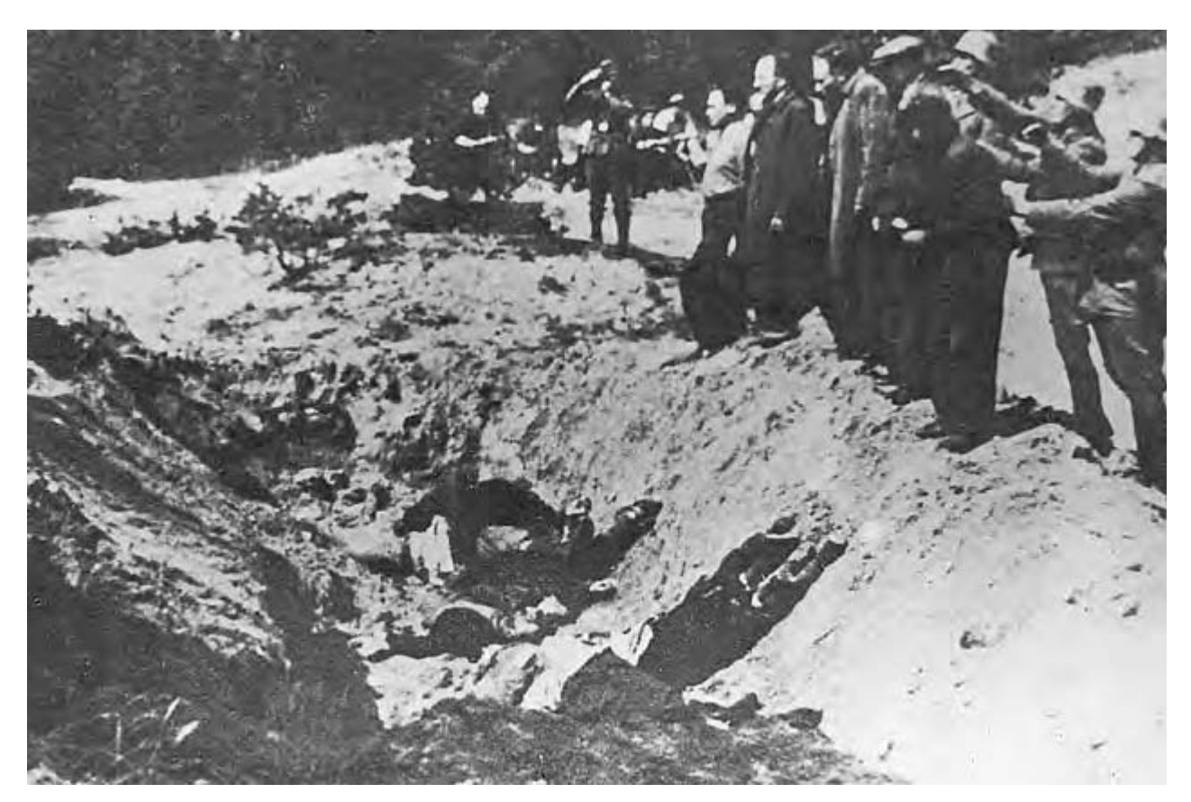
Nazi Shutzstaffel Einsatzgruppen (SS mobile killing squads) line up Jews to execute them before a ditch, Babi Yar Massacre, Ukraine, 1941.

EL SALVADOR, WOMEN AND THE CIVIL STRIFE IN