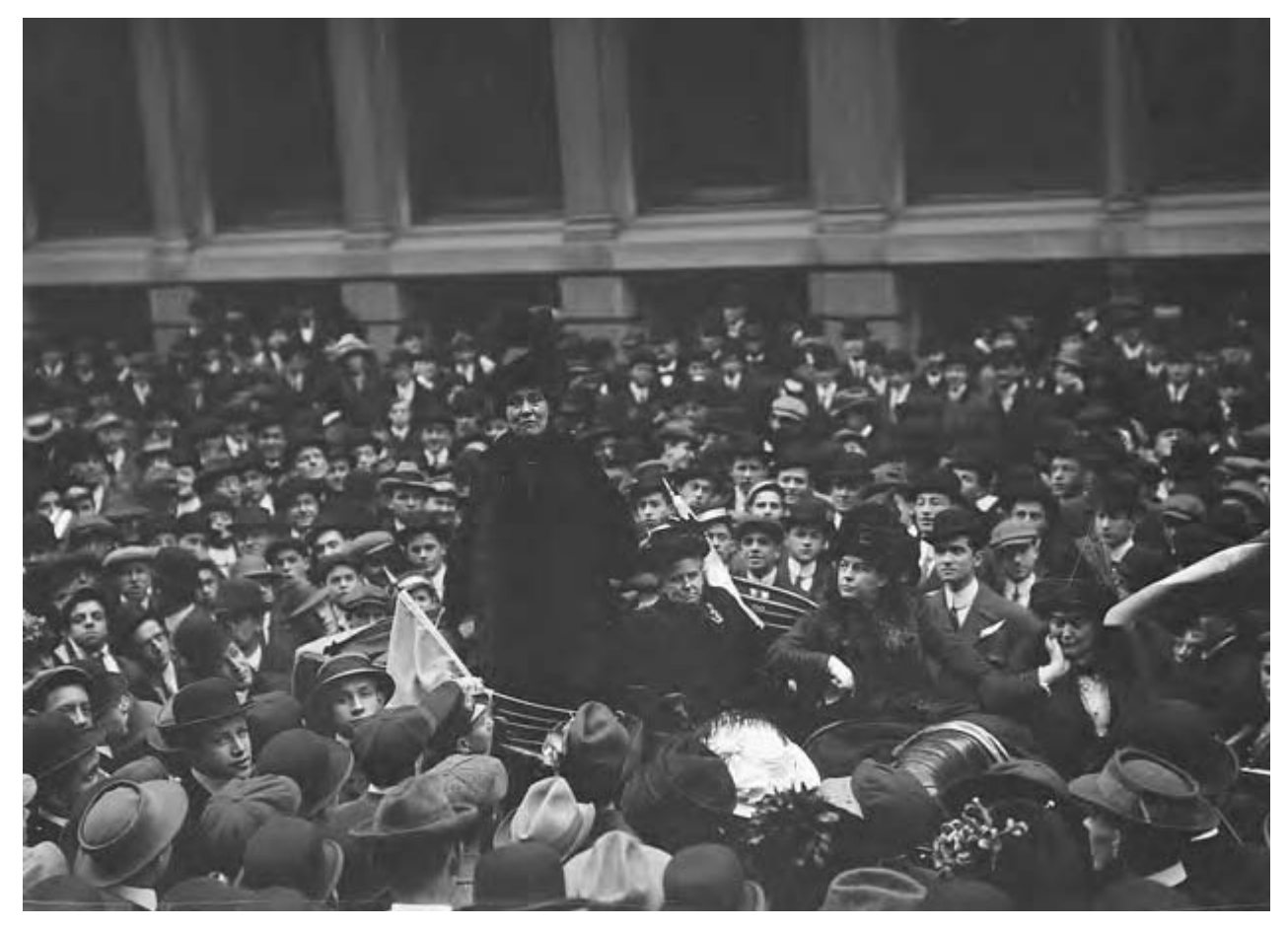
Emmeline Goulden Pankhurst on Wall Street.

Ethiopia, where she remained active in work for peace and social welfare. When she died in 1960, the grateful Selassie ordered a state funeral. In Britain, however, it was the pro-war Emmeline and not the pacifist Sylvia whose statue was raised in 1930 outside of the Houses of Parliament.