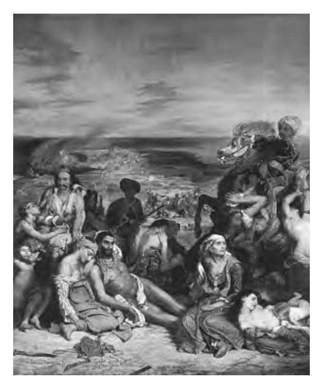
The Massacre at Chios, by Eugene Delacroix (1798–1863).

Apart from Bouboulina and Manto, thousands of Greek women were involved in the revolution. As part of the unarmed civilian population, they faced starvation, capture, enslavement, rape, and death. During battles or sieges, many women supported the fighters by building fortifications; transporting guns, ammunition, food, and water; looking after the wounded; and even using the guns of their dead husbands or sons and fighting the enemy to avenge their death. There are many reported cases of young girls who participated in battles dressed as men or who followed their lovers in battles. Because of her beauty, loyalty, and courage, the lover of Captain Georgios Karaiskaki obtained the privilege of participating in military counsels. Women also played leading roles in committees that sheltered refugees and orphans and collected material support for the revolution. A famous case is that of Psorokostaina, a woman beggar who donated the only penny she had to the revolution.