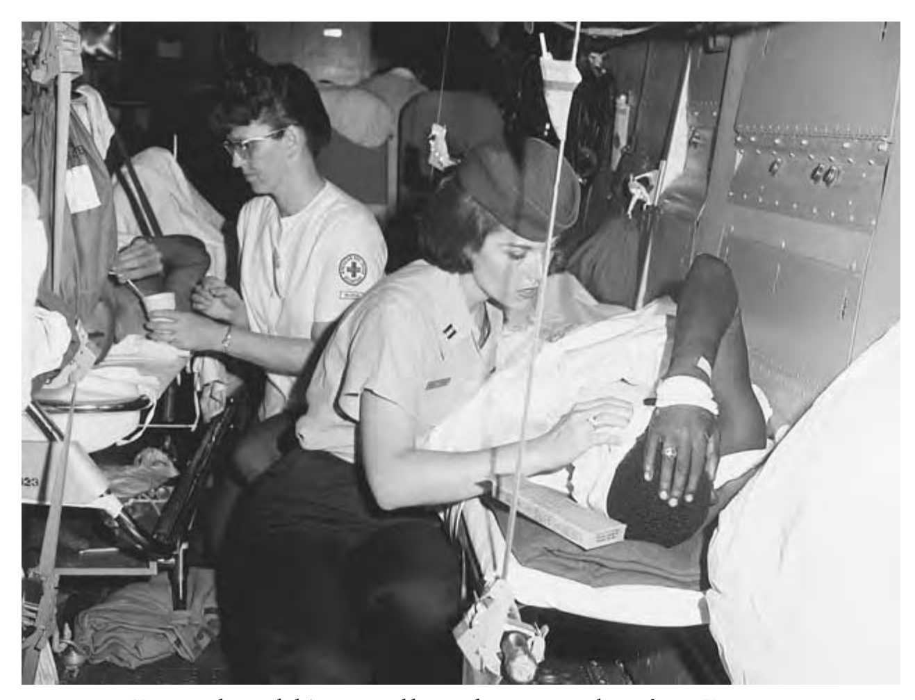
Nurses tend wounded American soldiers as they prepare to depart from a Vietnamese air base for the United States, 1967.

worked as medical personnel in the army or air force. But women were also deployed in nonmedical positions, as secretaries for the Military Assistance Command, Vietnam, which was located in Saigon, and on U.S. bases throughout the country. They also served as air traffic controllers, photographers, cartographers, with the Army Signal Corps, in intelligence, and in other jobs requiring security clearance. All women held officers' ranks. With an average age of 23, the medical personnel in Vietnam were the youngest in the history of U.S. wars. Women were not subject to the draft; they joined the military voluntarily, and with a few exceptions, all female personnel deployed to Vietnam had volunteered for service in the war zone. Like their male peers, they served an individual 1-