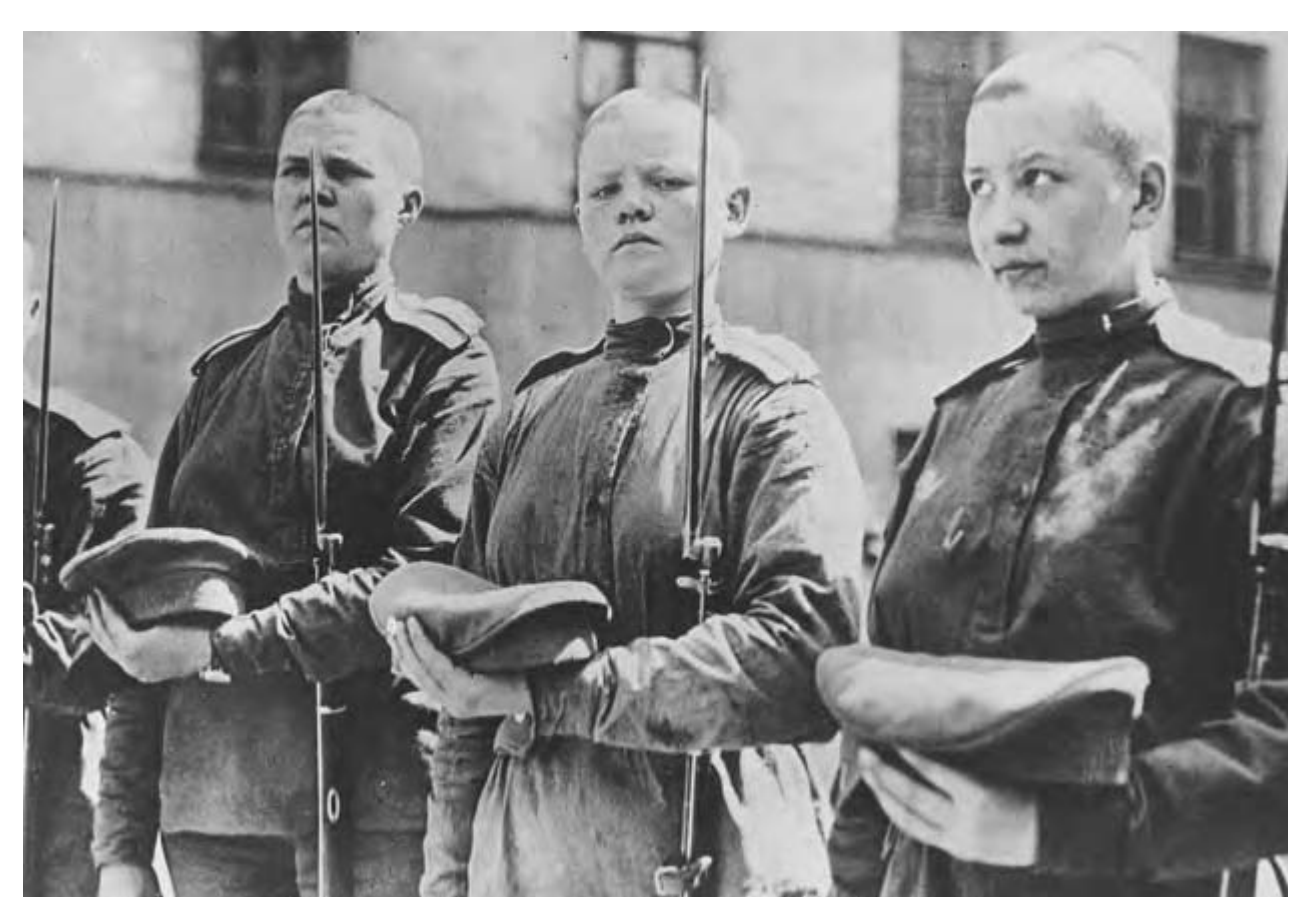
Russia, Women Recipients of the Order of St. George