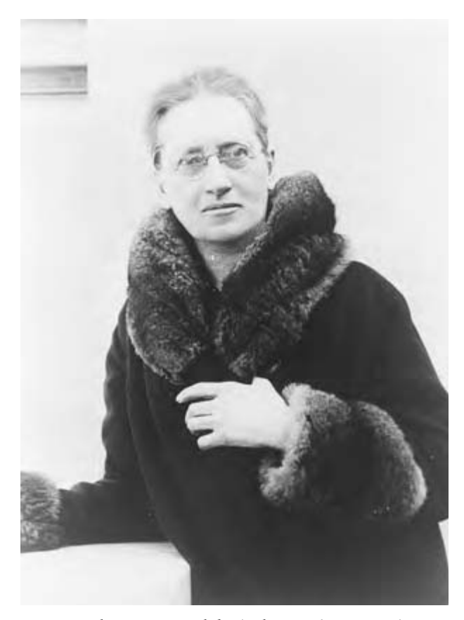
Emily Greene Balch.

Balch attended the 1919 conference of the International Congress of Women in Zurich and agreed to become secretary of its Geneva-based Women's International League for Peace and Freedom (WILPF). She left that position when the league experienced financial difficulty in 1922 but assumed it again in 1934 for a year and a half without compensation. She was an early critic of the Versailles Treaty that ended World War I. Between the wars, she participated in League of Nations programs related to peace and international cooperation and served on a WILPF commission investigating conditions in Haiti under U.S. occupation. The plight of the victims of Nazism led Balch to alter her pacifism in favor of a forceful defense of human rights. Nevertheless, she continued to emphasize internationalism and cooperation. After receiving the Nobel Prize, which she donated to the WILPF, Balch continued to serve the league in an honorary capacity. During her