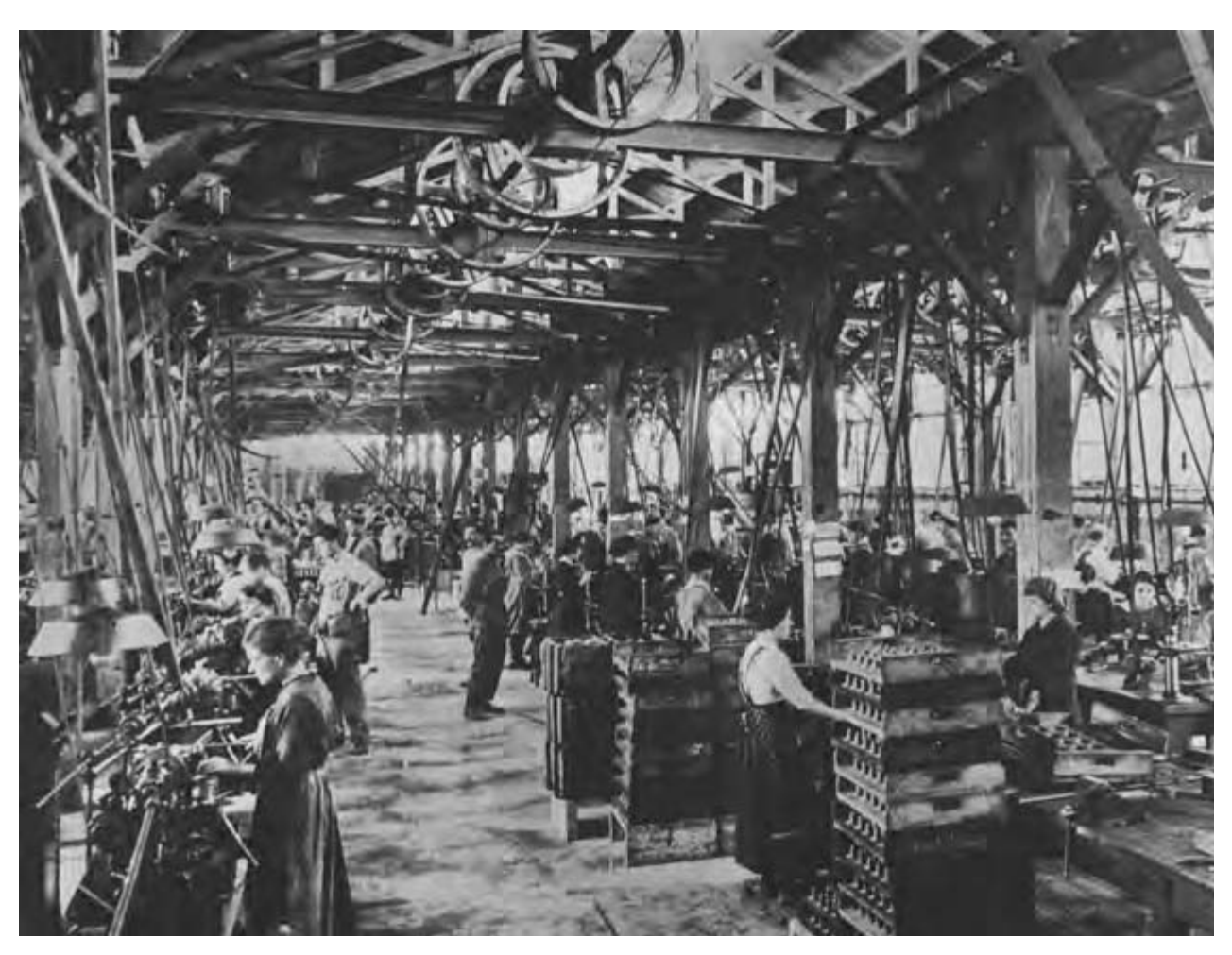
FRANCE, WORLD WAR I, WOMEN AND THE HOME FRONT