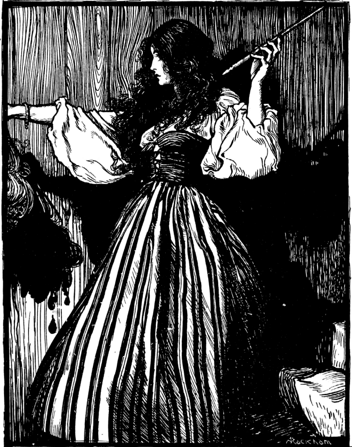
Arthur Rackham 1867-1939, The Fairy Tales of the Brothers Grimm

Finally, fifth, you gain an additional final metamagic ability, granting you two total at 17 th level. This gives you seven total metamagic abilities known.