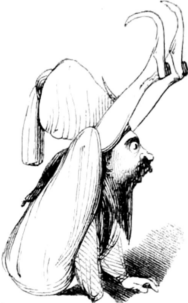
Richard Doyle 1824-1883, The Book of Ballads

At 17 th level, anyone who uses a melee attack action against you when you have taken the Dodge action grants you advantage on your next attack against them. This allows you to do sneak attack damage. This effect only lasts until the end of your next turn.