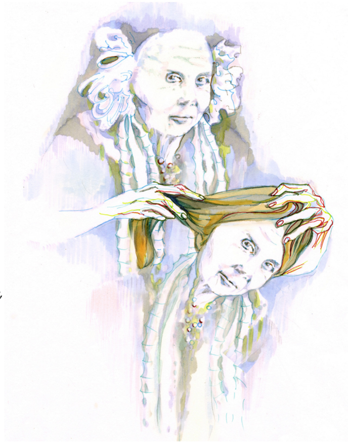
Illustration 13: Doppelganger by Galiaoffri on Wikipedia

There's a deeper secret. All doppelgangers belong to the Doppelganger Hegemony, a secret cabal that meets regularly. It pools the doppelgangers' stolen wealth and power. Nobody yet knows its mission.