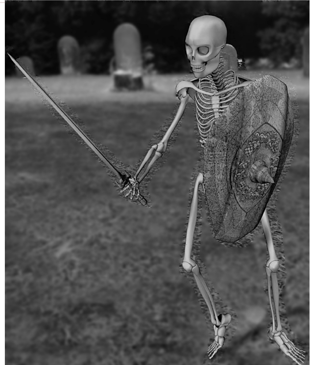
Illustration 3: CG art skeleton by DreamGuy

Silent: Skeletons make no noise during any movement other than attacking.