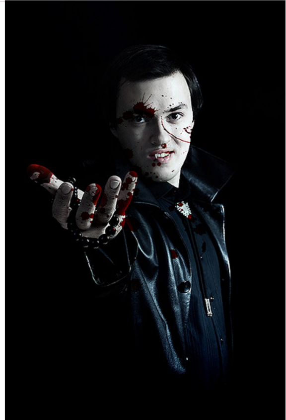
Illustration 16: The Vampire by Andrew Kuznetsov on Flickr

Sucks to Be You: When the vampire bites, its victim must make a 20+ Avoiding Poisons rolls or turn into a vampire thrall. The killing bite automatically turns a creature into a vampire thrall.