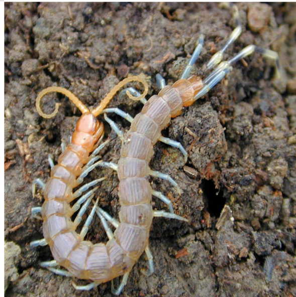
Illustration 1: "Centipede in peat marshlands of Kawai Nui, O'ahu, Hawai'i"

Giant centipedes are nearly as common as squirrels and deer. They can be encountered in practically any situation outdoors (or underground, for that matter), and are an effective way to increase the danger of any encounter. Indeed, a giant centipede (or two) can appear to feed on the corpse of the first monster that the murderhobos murder in any given encounter.