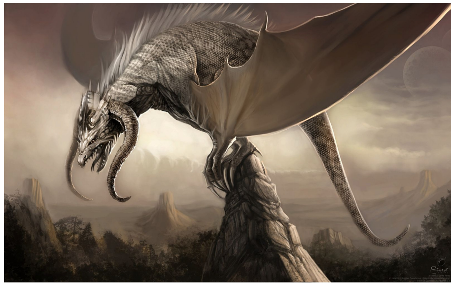
Illustration 14: By David Revoy

Note that a dragon can make all of its attacks on its turn.