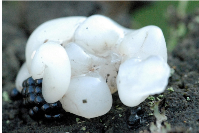
Illustration 5:

Paralyzing Touch: If an enemy shares the same area as a living cyst, at the beginning of its turn the enemy must make an 8+ Avoiding Poisons roll or it is paralyzed and cannot move (though it can still attack, communicate, etc.). On its next turn, the poisoned creature must make a 10+ Avoiding Poisons roll or fall unconscious.