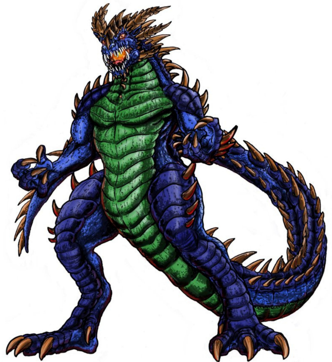
Illustration 9: The Last Titan by Deadpoolrus on DeviantArt

Kobolds are almost always encountered either in raiding swarms, or at home in their nests.