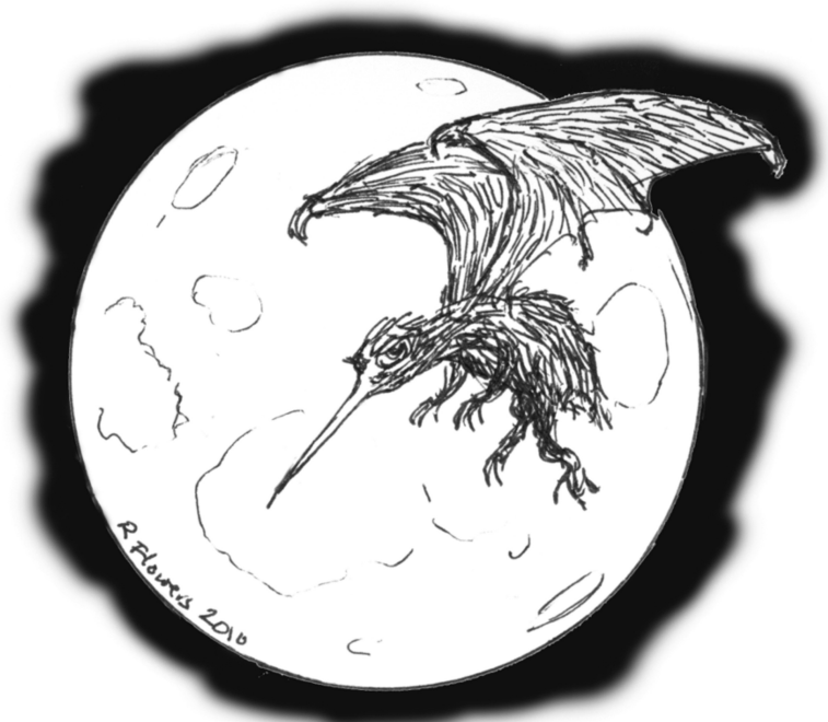
Illustration 4: Stirge WBG by RFlowers on DeviantArt

Stirges like to nest in old, abandoned buildings. A classic would be a nest of 2d6 stirges in the roofed entrance to an old temple that's been attracting attention from other murderhobos. The nest consists mostly of the stitched-up remains of other murderhobos.