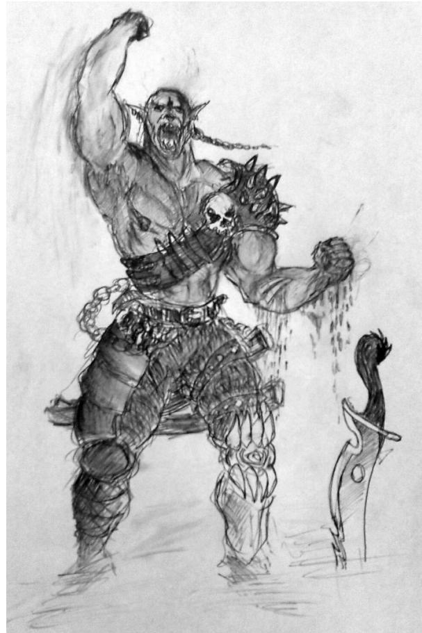
Illustration 11: Orc 1 by RisTheBeast on DeviantArt

Rage: The orc makes an extra attack. If unsuccessful, it may rage again next turn (continually until a successful attack). After successfully raging, it takes a -2 on all rolls on its next turn.