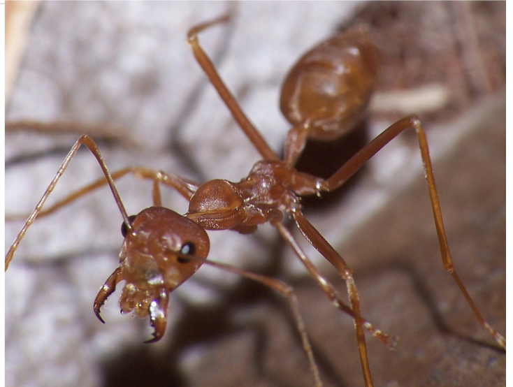
Illustration 2: Ant Actions by Charles Lam on Flickr

Poisonous Saliva: If an enemy is bit by a giant ant, on the enemy's next turn it must make a 10+ Avoid Poisons roll or take 1 extra hit.