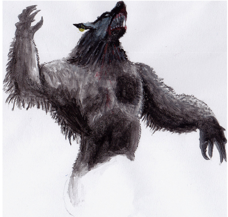
Illustration 15: Werewolf by sappirex96 on DeviantArt

Lycanthropes often live in packs of 3d4 members, with one alpha. Alphas have +1 to all their primary stats.