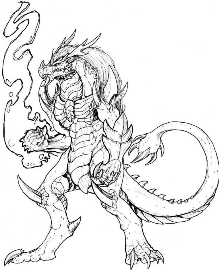
Illustration 10: The Forgotten Warrior by Deadpoolrus on DeviantArt

Some lizardfolk roam the world in search of lost knowledge. They are often found scavenging strange artifacts from old ruins. While occasionally alone, they are usually accompanied by one or two fellow seekers and a few hunters.