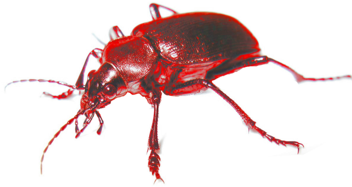
Illustration 7: Original photo by Jon Richfield

Highly Corrosive: Whenever an enemy hits this creature with a weapon, the enemy's weapon has a 10% chance of breaking. Each hit increases the chance by 10%, so the second hit has a 20% chance of breaking, the third a 30% chance, etc. This effect is permanent.