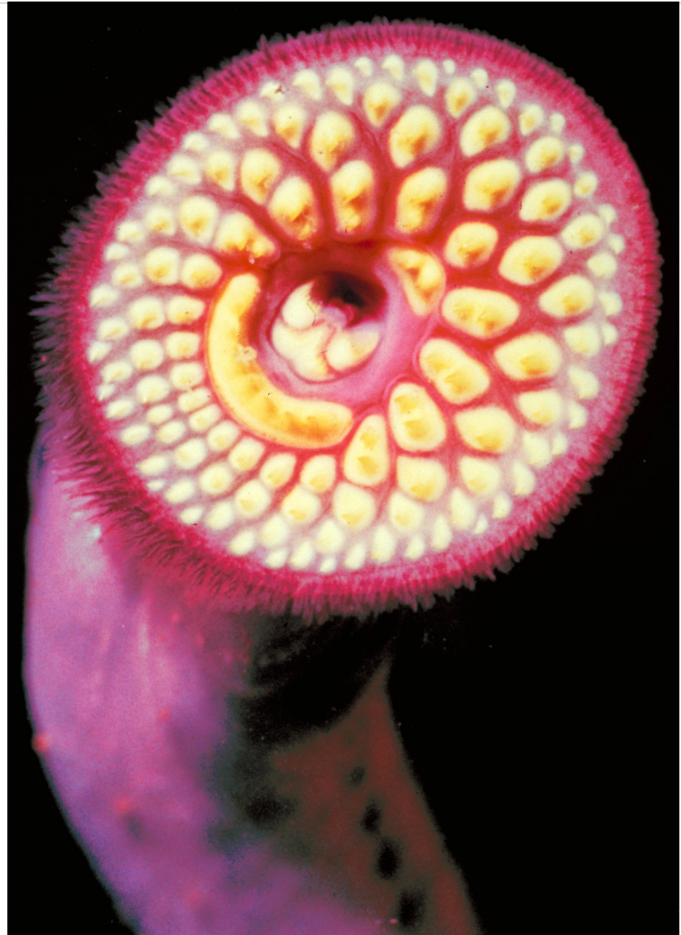
Illustration 6: Sea lamprey mouth by PDH

About every 6 months, a gibbering mouth will lay 2d10 eggs, which are valuable spell components. After 1 month, the eggs hatch into gibbering larvae, which grow into adults after 3 months. The larvae are quite weak and make popular food sources for other underground inhabitants. Some creatures, particularly kobolds, even capture and breed gibbering mouths just to feed on the larvae.