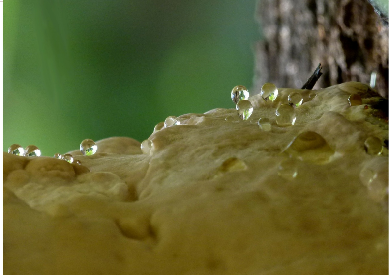
Illustration 8: Image by werner22brigitte

Fungal Infection: If the spore hits, its target is infected . Every 10 minutes, the target must make a 10+ Avoiding Poisons roll or take 1 hit.