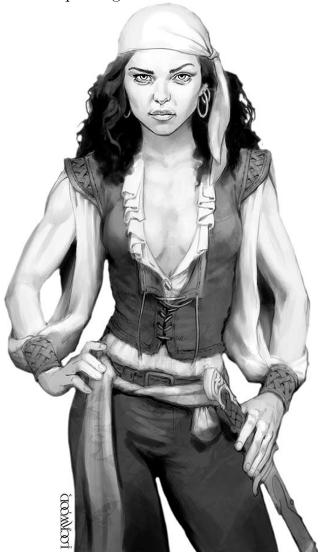
‘Torrent, a Corsair, was never far from trouble in mighty Taux’.

To create something unique, I decided to bind each primary race in the Nameless Realms fiction to a certain element. Some had strong ties, some not so much, but nonetheless each was polarized to either Fire, Air, Water, or Earth. Although there are twelve ‘prime’ races bound to these elements, there can really be a plethora of ‘sub’ races that bend the rules a bit, such as Humans that instead of being of low elemental fire affinity (which is the norm), might have an earth affinity because of something that has happened to a certain tribe of them over the course of passing millennia.