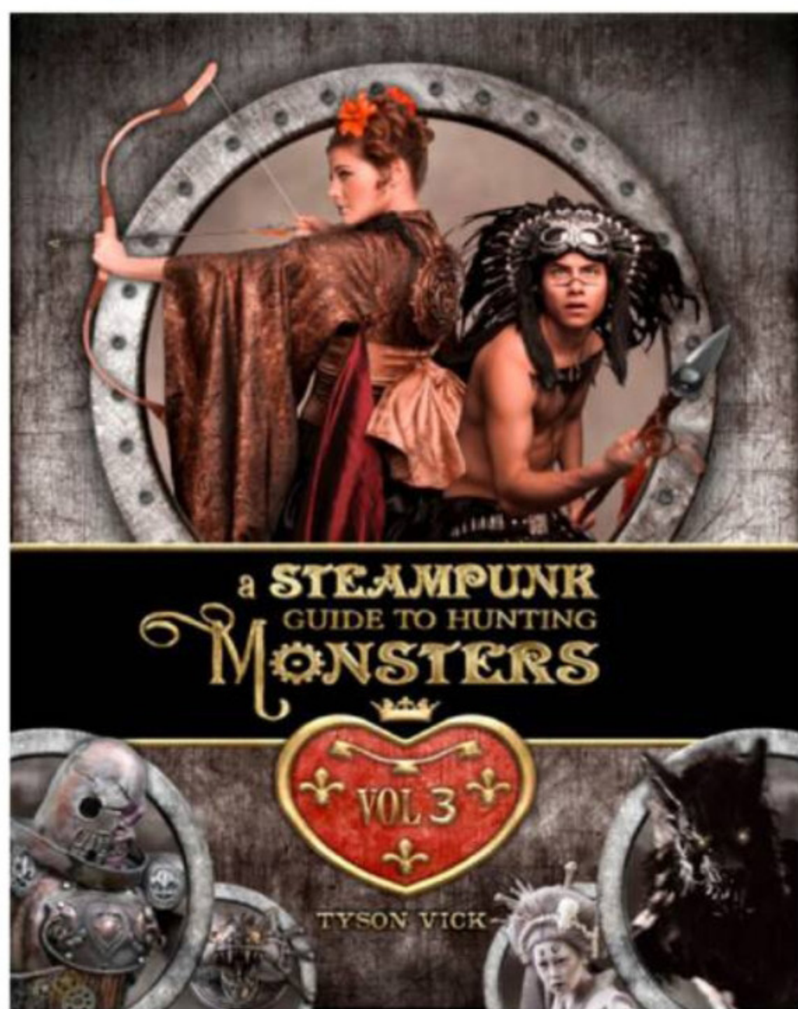
A STEAMPUNK GUIDE TO HUNTING MONSTERS VOLUME THREE

Steampunk Fashion, Photography and Fiction combine in this serialized steampunk fantasy photography magazine by artist Tyson Vick. This illustrated tour de force combines steampunk fairy tales and monster stories with the visual aspect of a graphic novel. Each volume compiles chapters from the free online serial version. Collect all four volumes to read the full story of Miss Philomena Dashwood and her adventures in A Steampunk Guide to Hunting Monsters .