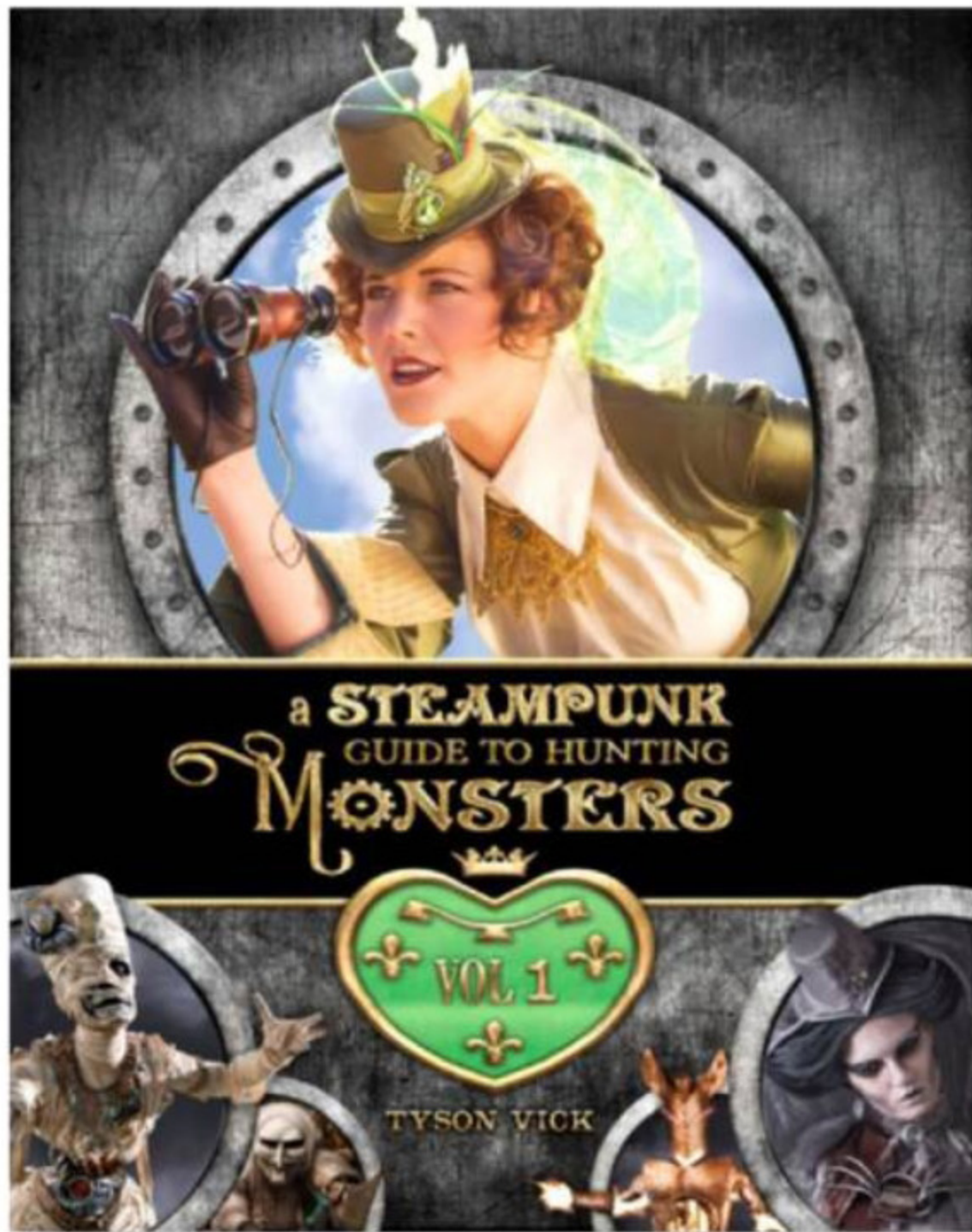
A STEAMPUNK GUIDE TO HUNTING MONSTERS VOLUME ONE

The hunt is on! The beautiful and oblivious Philomena Dashwood joins a world-wide Monster Hunting Tour in hopes of finding adventure. However, she refuses to give up any of her finery or opinions. After a seance gone wrong, the angry ghost of Esme Gorey attacks, and Dashwood comes to the rescue, but one adventure leads into the next, and soon Philomena Dashwood is rushing off to save the missing village children from a witch in the wilderness. The thrills continue when she faces off with a cursed mechanical mummy, and later is whisked away into the sky by a mystical Genie. Along with her new friends, Brunhilde Bamfield and Percy Longville, Philomena Dashwood embarks on an epic odyssey through the realms of fairy tales and monsters.