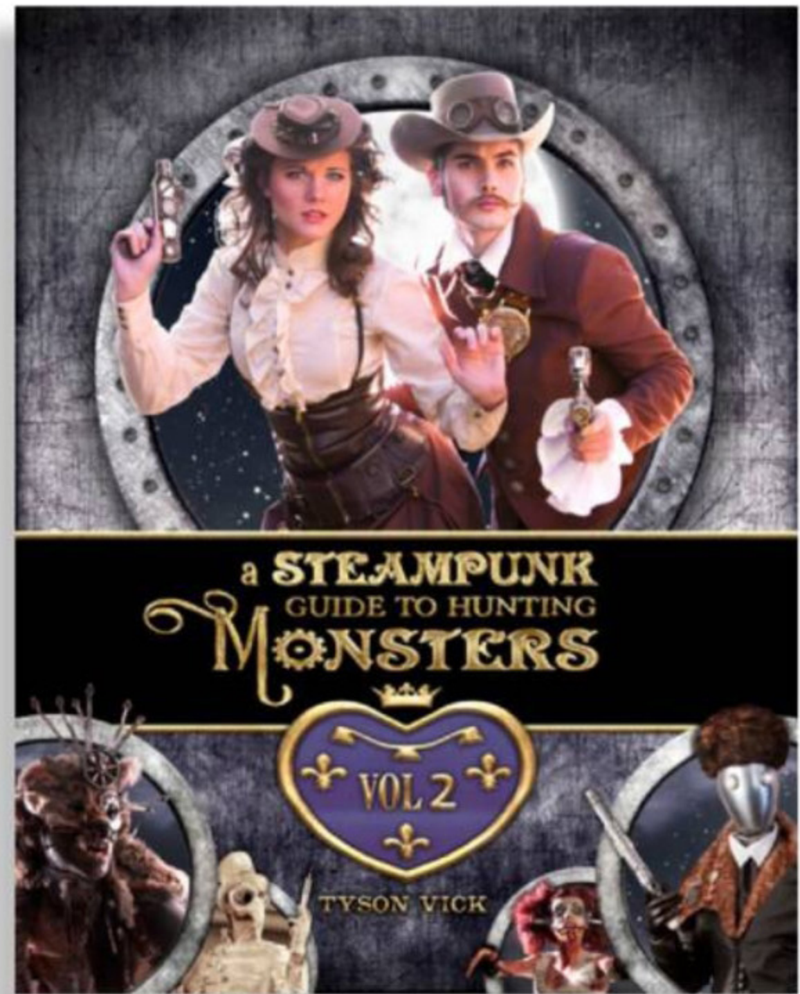
A STEAMPUNK GUIDE TO HUNTING MONSTERS VOLUME TWO

The hunt is on! The beautiful and oblivious Philomena Dashwood joins a world-wide Monster Hunting Tour in hopes of finding adventure. However, she refuses to give up any of her finery or opinions. After a seance gone wrong, the angry ghost of Esme Gorey attacks, and Dashwood comes to the rescue, but one adventure leads into the next, and soon Philomena Dashwood is rushing off to save the missing village children from a witch in the wilderness. The thrills continue when she faces off with a cursed mechanical mummy, and later is whisked away into the sky by a mystical Genie. Along with her new friends, Brunhilde Bamfield and Percy Longville, Philomena Dashwood embarks on an epic odyssey through the realms of fairy tales and monsters.