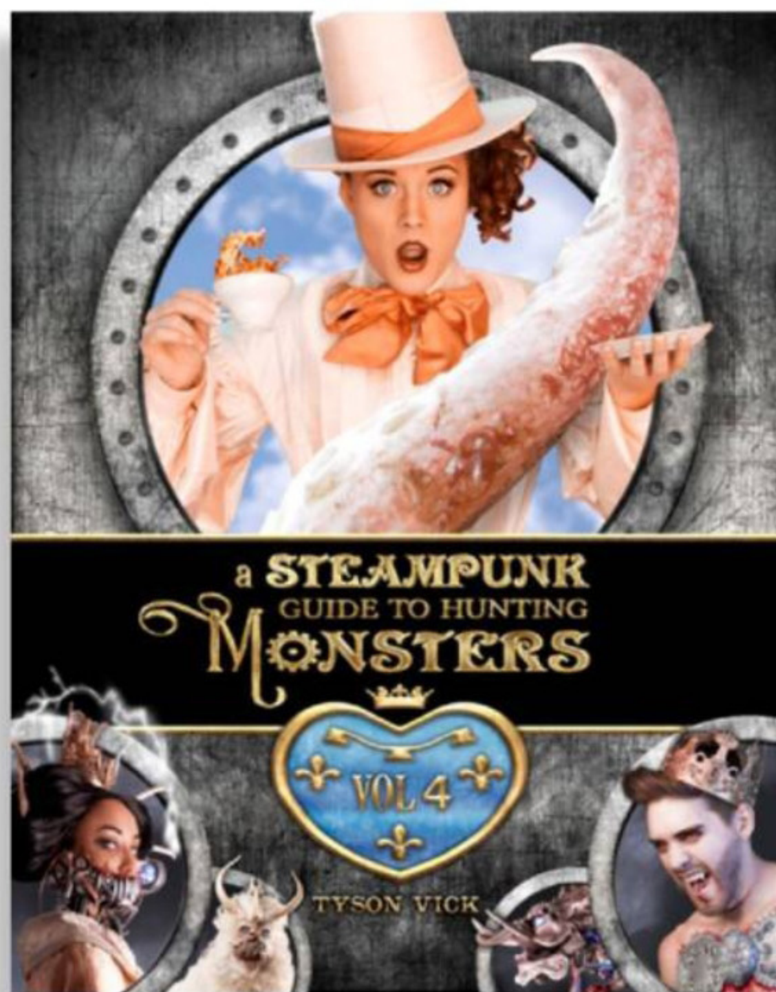
A STEAMPUNK GUIDE TO HUNTING MONSTERS VOLUME FOUR

The danger escalates! Our heroine, Philomena Dashwood, is separated from the monster hunting tour when she is kidnapped by slavers in the wild west and sold to a bridge troll. She must use her wits to outsmart the beast so that she can return to her traveling companions. One adventure blends into another, and soon she must fend off an attack of aquatic arachnids, unravel the tragic history of the ghost of a Geisha, and enter the frightening monster prison of the world-famous monster hunter Lu Yan where the tour is stalked by a Werewolf that wanders within! If this wasn't enough, Philomena must learn to grow in her personal relations too, helping Brunhilde deal with her demonic husband and becoming more accustomed to the friendship of the ever-present Percy.