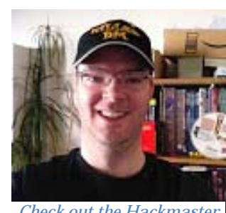
Check out the Hackmaster Combat Wheel over my left shoulder. What a crazy GM tool!

Product names, logos, brands, and other trademarks featured or referred to within this ebook are the property of their respective trademark holders. These trademark holders are not affiliated with Roleplaying Tips. They do not sponsor or endorse Roleplaying Tips or this ebook.