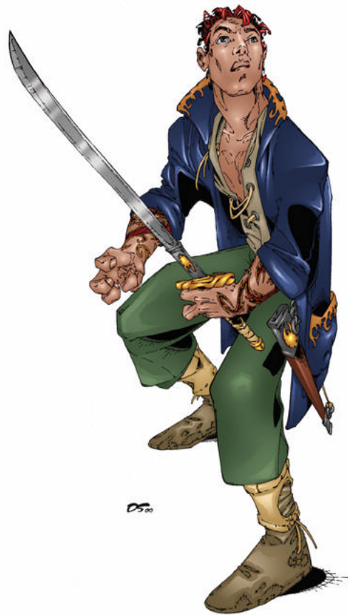
"Rand Al'Thor" by Darryl Sheakly, color by Mike Estlick

If the Composure Skill Check fails by more than 5, the channeler must make a Fortitude save (DC15). If the character succeeds at the Fortitude save, they are unharmed by the attempt to embrace the source, but must begin to Embrace again, taking a full round. If the save fails, the result depends on how badly the roll failed. Subtract the saving throw result from the DC and consult the table on Page 163 of the WoT RPG.