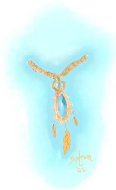
"Well Angreal" by Priest Sidran