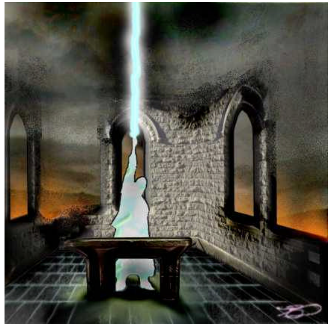
"Breaking of the World" by Brian Danford

Knowledge: Arcana skill check (DC equals 2/3 the creation DC as seen in this netbook).