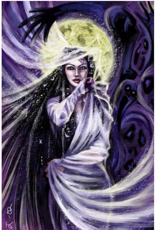
"Sweet Dreams" by Lotta Tjernström

The duration for this feat is the Dreamwalker's level + the number she exceeded her Concentration skill check by in days. Dream Binding is an attack or move action.