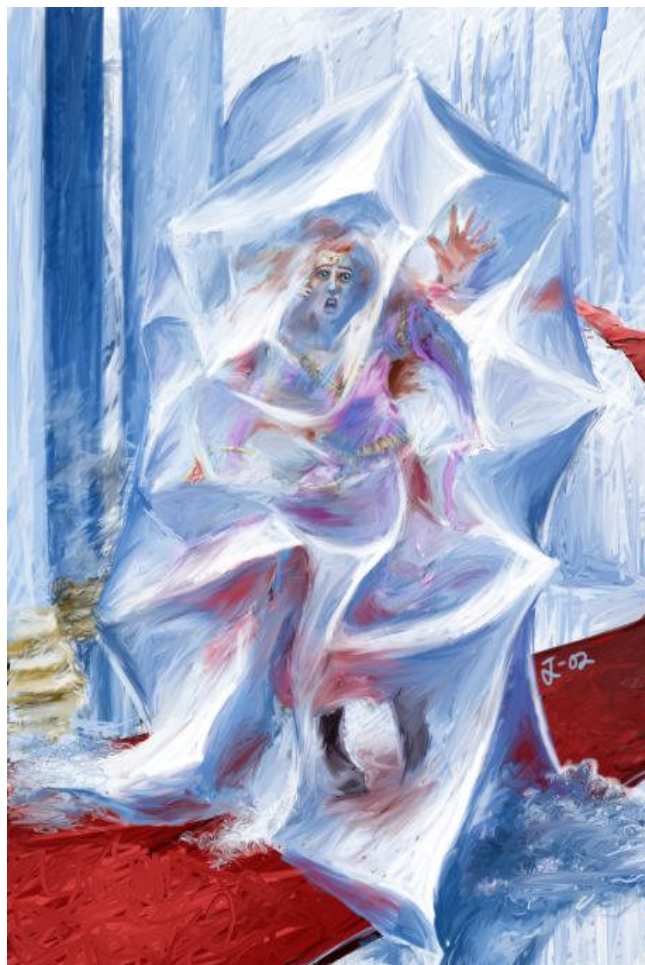
"Ice Princess" by Lotta Tjernström

This weave was created during the Age of Legends shortly after the Balefire weave and was thought lost until rediscovered by the Asha'man. While the Balefire weave burns the target's thread from the Pattern from some point in the past, this weave causes the target's thread to "stretch out". For the target, everything seems to move with unnaturally fast speed. To everyone else, the target moves incredibly slow. For game purposes, the target loses all defense bonuses due to Dexterity and may only move a 5ft step every round. Every other round, the target may take a partial movement. Thus for the target, a round consists of 2 separate 5ft steps and one partial action. During that time, everyone else gets 2 full rounds of action. When casting this weave, the channeler must make a Weavesight check (DC 20) in order to avoid being caught in the effect of this weave. Failure causes the channeler to suffer the exact same effects as the target.