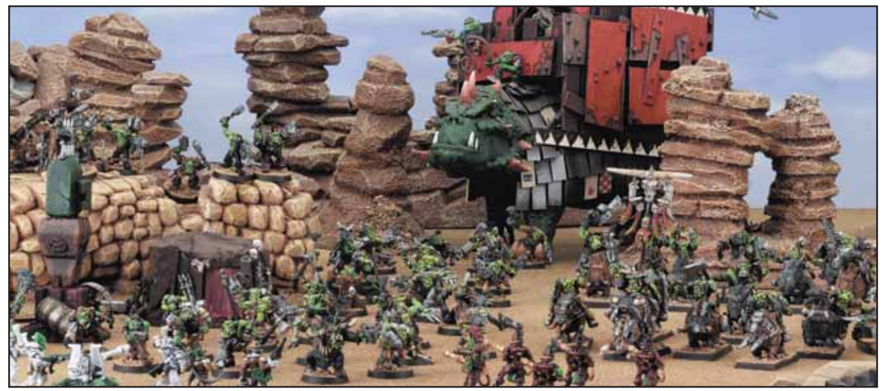
Space McQuirk's Feral Orks swarm into the ranks of the Eldar, a looming Squiggoth on the horizon.