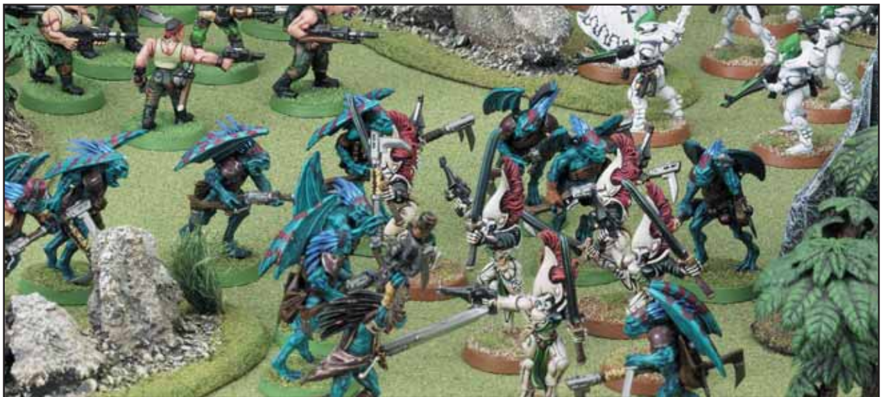
A Kroot Mercenary warband assists the Imperial Guard in staving off an Eldar assault.

Special rules: Punji traps are generally a small pit containing sharp stakes and covered with foliage. Place the small Blast marker over the model that triggered the trap so that the hole in the marker is over the model. Any models fully under the Blast marker are hit automatically, and any partially under are hit on a 4+.