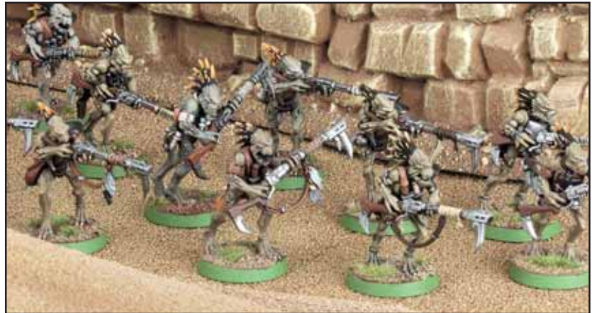
Mercenary Kroot advance through a rocky valley.

Fieldcraft: Kroot are naturally adept in arboreal environments and gain +1 to their cover save in woods or jungles. Kroot in woods or jungles do not have to make a difficult terrain test, they can always make a normal move. If they do not move in the Movement phase, they may see and shoot through 12" of woods or jungle terrain rather than the 6" that would normally be the case.