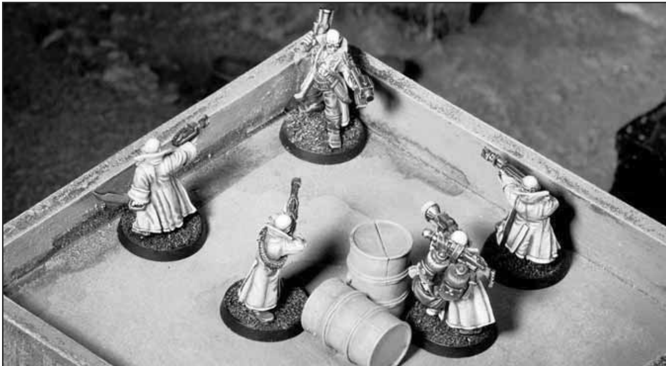
There's mutiny afoot