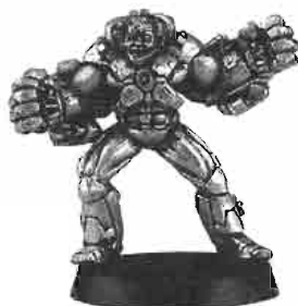
ORRUS 1 059902801 - £5.00

You can get your Spyrer team from the Mail Order back catalogue.