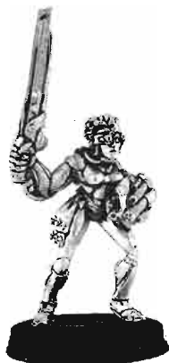
JAKARA 2 059903110 - £4.00