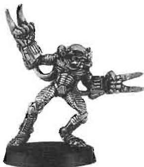
MALCADON 1 059902903 - £5.00