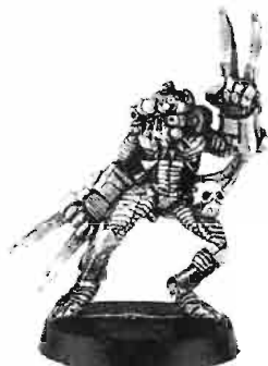
MALCADON 2 059902904 - £5.00