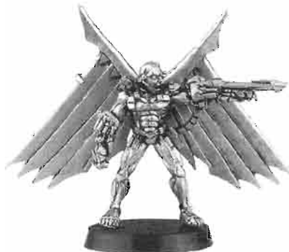
SPYRE HUNTER YELD - £5.00

Call Mail Order on 0115 91 40 000 (US on 1 800 394 GAME) Or you can order online at: www.games-workshop.com