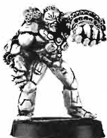
ORRUS 2 - £5.00