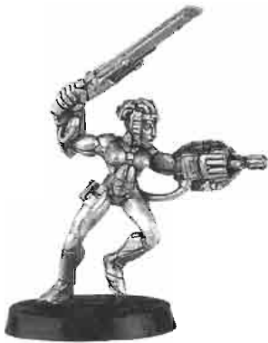
JAKARA 1 059903109 - £4.00