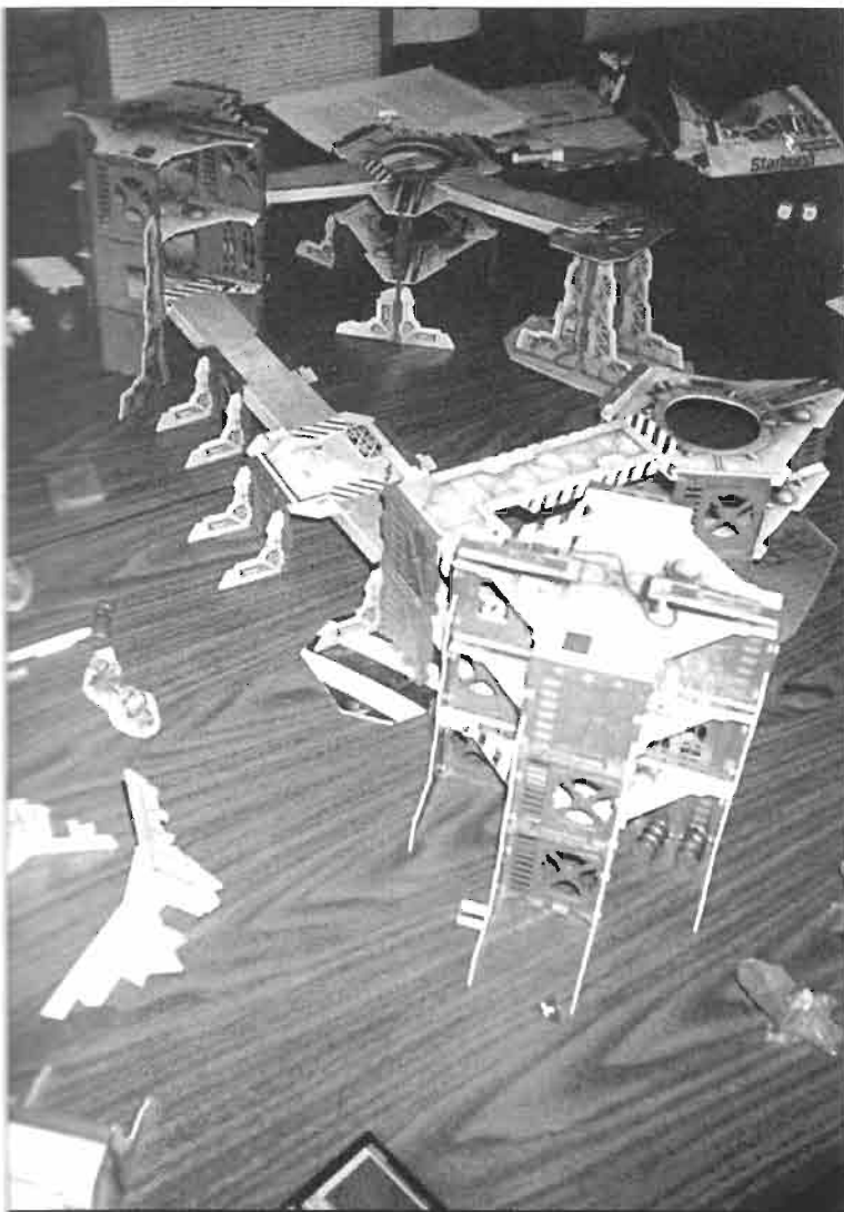
The dangerous and foreboding depths of the Underhive...

may not use more than one single handed weapon unless he has more than two arms (one arm must be used to steady the extra burden).