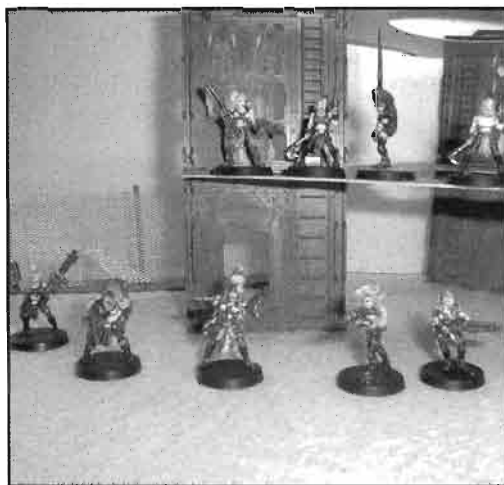
The girlies get ready to kick some!

If a gang fails a bottle roll, or one player voluntarily bottles out, the game ends immediately. The gang that bottles out loses, and the other gang automatically wins.