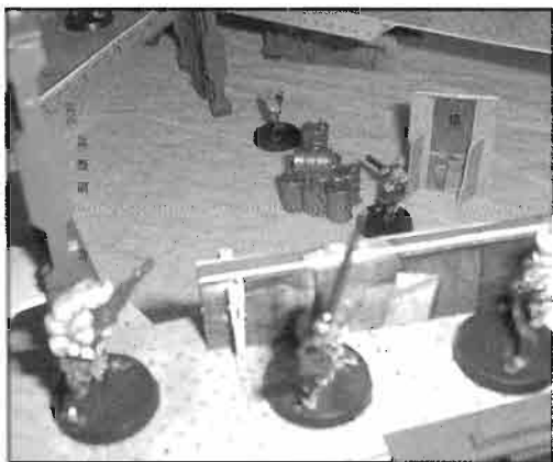
Eschers take cover, high up where the gunk can't ruin their hair-does.