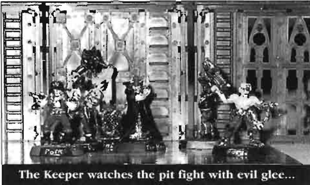
The Keeper watches the pit fight with evil glee...

Any gang leaders who fail to make it past the group stage