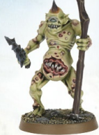
Plaguebearers of Nurgle