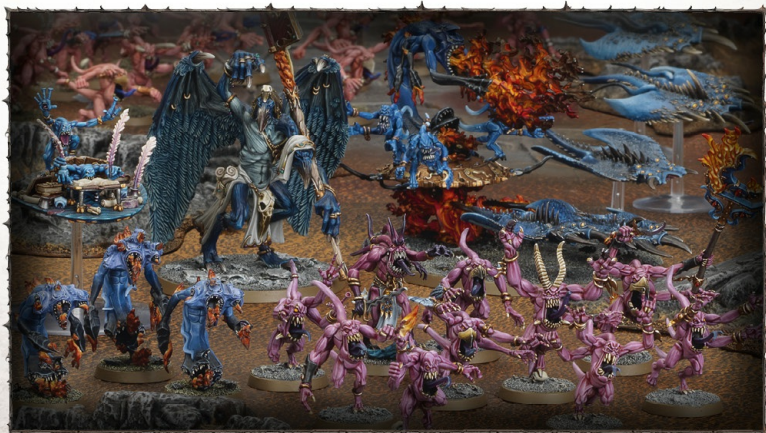
Mutagenic flame sears the air as the Daemons of Tzeentch twist reality to their own peculiar ends.