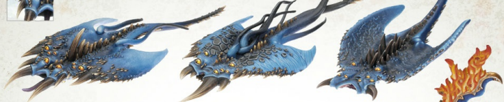
Screamers of Tzeentch