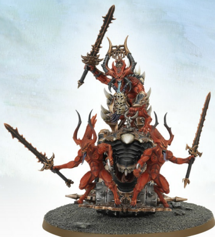
Blood Throne of Khorne