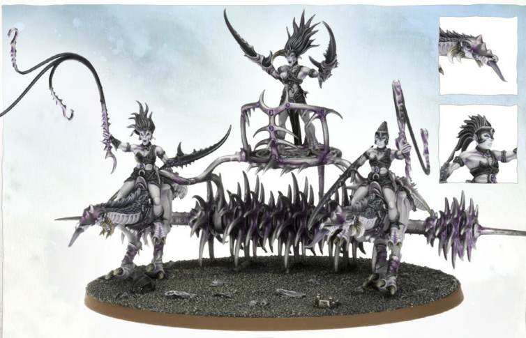
Helllayer of Slaanesh