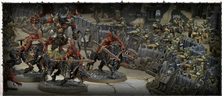
The brazen warriors of Khorne charge headlong into the trenchlines of their Imperial Guard prey.