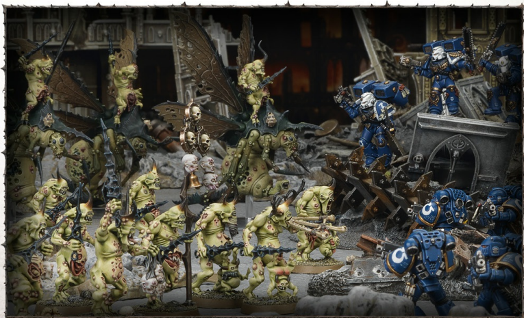
A chanting horde of Plaguebearers and Plague Drones falls upon its Space Marine foes.