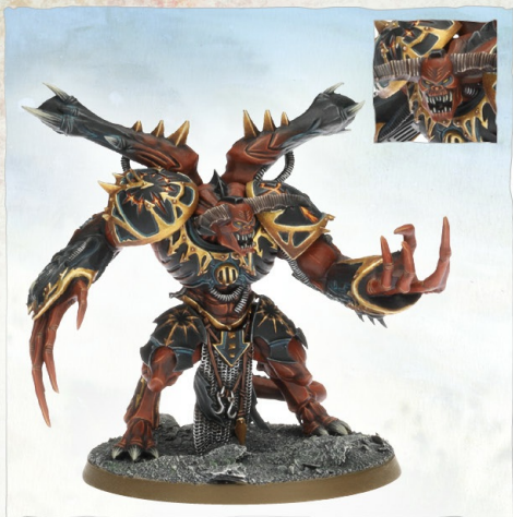
Daemon Prince of Khorne