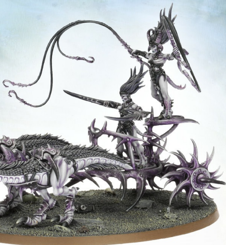
Seeker Chariot of Slaanesh