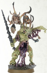
Herald of Nurgle