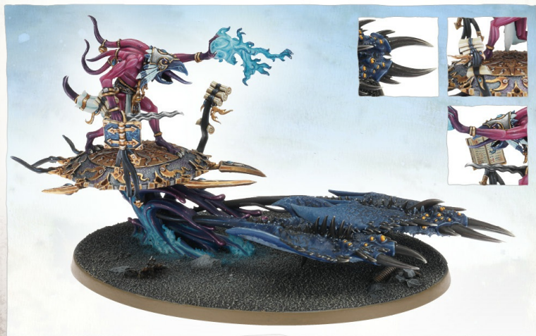
Herald of Tzentch on Burning Chariot