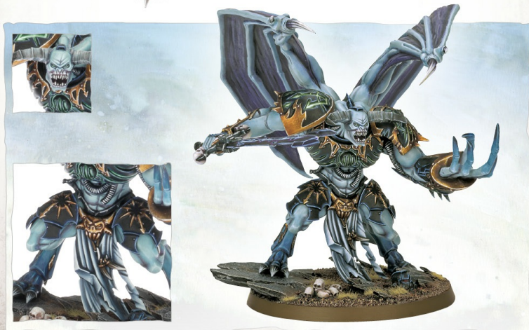
Daemon Prince of Tzeentch