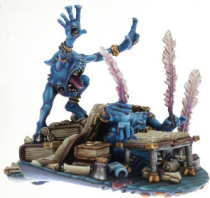
The Blue Scribes