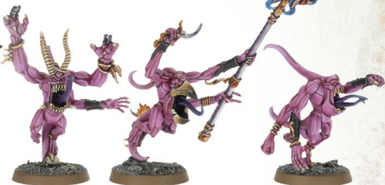
Pink Horrors of Tzeentch