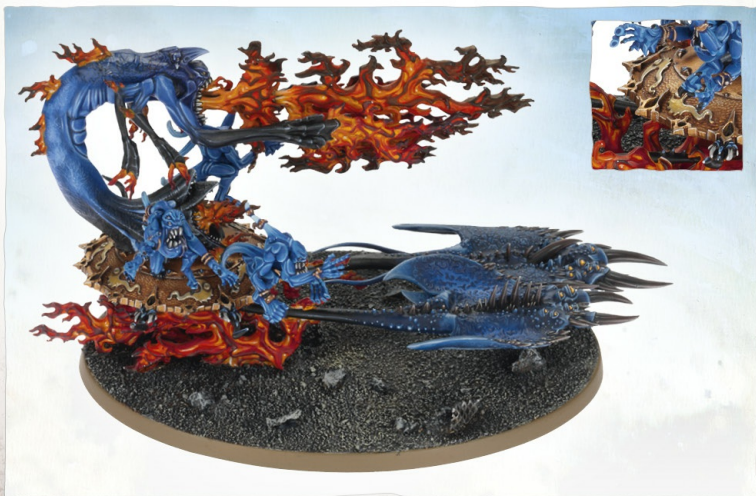
The Burning Chariot of Tzeentch