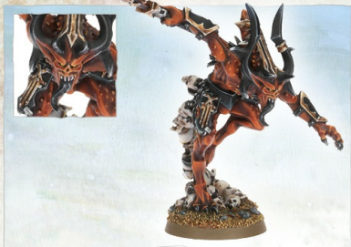
Herald of Khorne