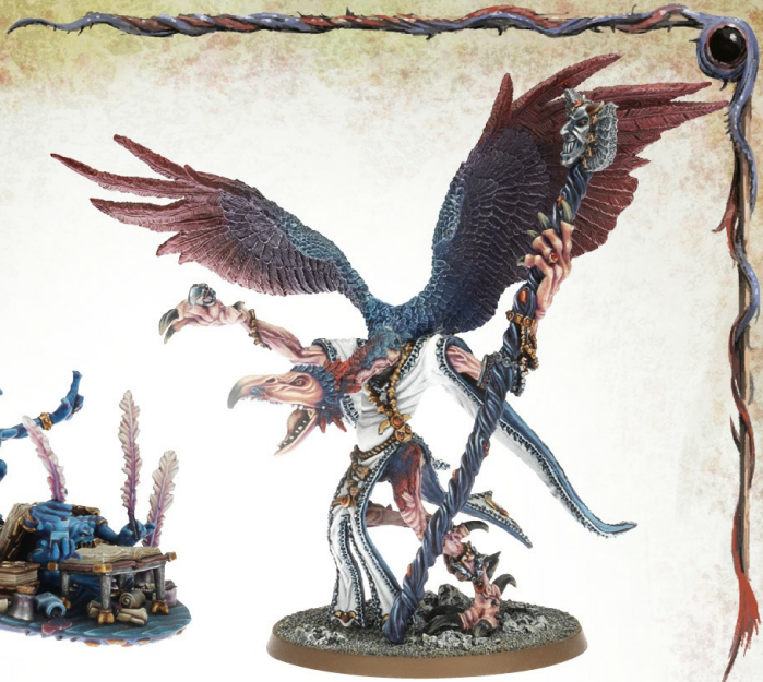
Lord of Change