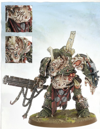
Daemon Prince of Nurgle