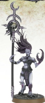
Damonettes of Slaanesh