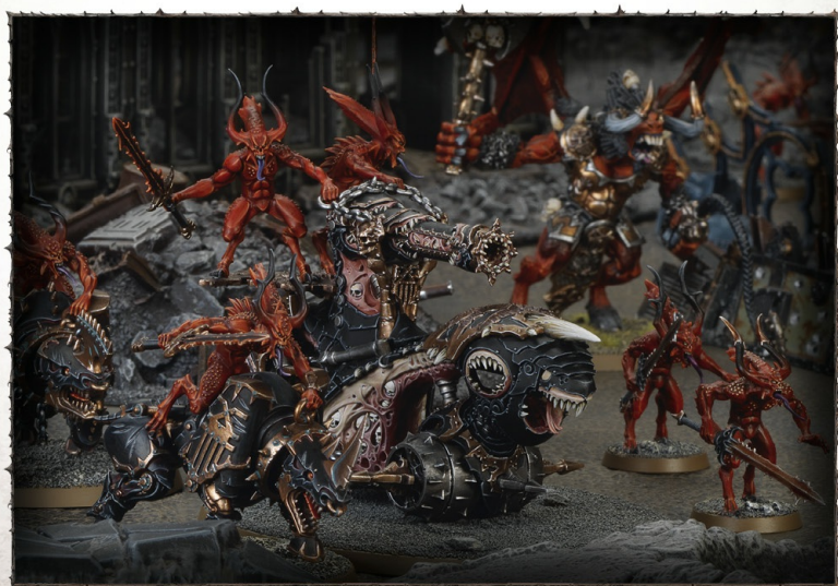
A Skull Cannon of Khorne grovels towards the foe, its gruesome weapon spitting death.