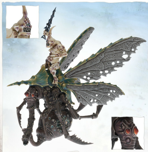
Plague Drones of Nurgle