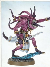
Herald of Tzeentch