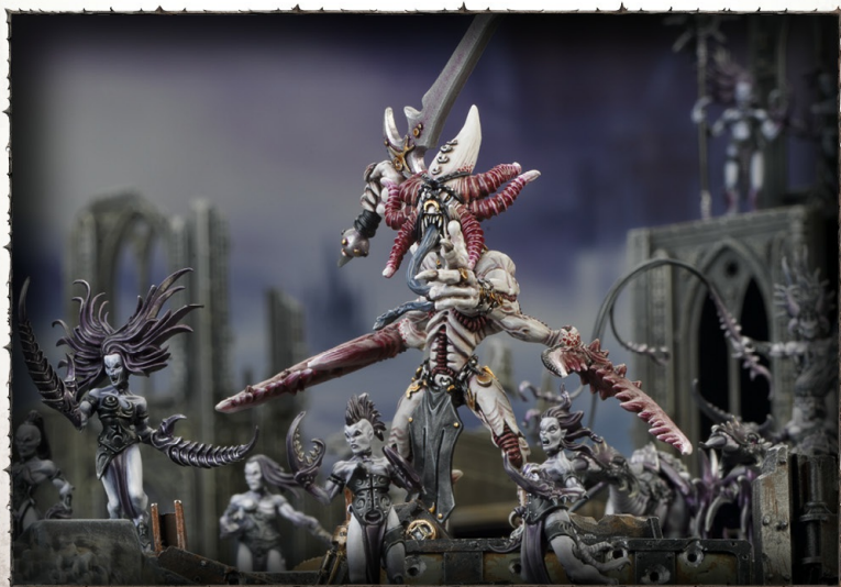
A Keeper of Secrets orders its Daemonette handmaidens to advance further into the city.