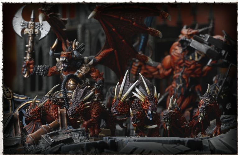
Karanak and his Flesh Hounds prowl the shattered ruins, monsters storming forwards in their wake.