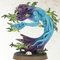
Flamers of Tzeentch