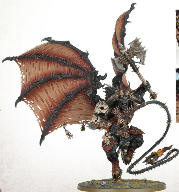
Bloodthirster of Unfettered Fury