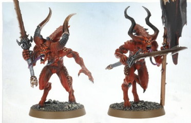
Bloodletters of Khorne