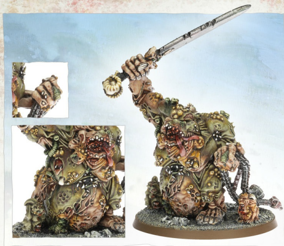
Great Unclean One