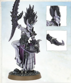
Herald of Slaanesh