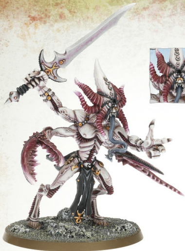
Keeper of Secrets