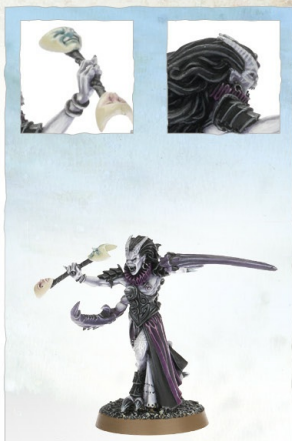
The Masque of Slaanesh