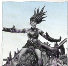
Exalted Seeker Chariot of Slaanesh