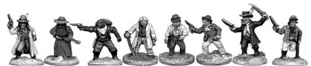
OW-7 Shootists 2