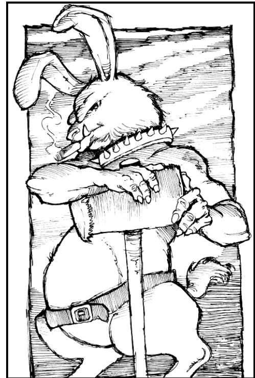
Artwork by Andrea Sfiligoi

Beastmen are, as the name implies, somewhat bestial and somewhat human. In appearance they range from some that could pass as a man by hiding a tail here or a patch of fur there, to others that look like nothing so much as bipedal forest creatures, with something between the two extremes being more common. This also includes the foul serpentmen found in the east. Beastmen can be found ranging through the eastern mountains of Talomir. Clannish and aggressive in the extreme, Beastmen only rarely gather in sufficient numbers to