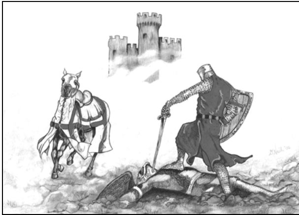
Artwork by Donna Faye Nail

The consequence of failing a challenge must be determined prior to the attempt. They should be agreed upon and need to be in keeping with the severity of the task. Example: Dropping down from a single-story roof may result in a twisted ankle and movement reduction if failed, while falling from a six-story building may result in death.