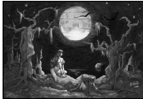
Artwork by Donna Faye Nail

When rolling 1d6 to determine where the encounter takes place, subtract 1 from the roll if you are on the border and add 1 if you are in the heartland.