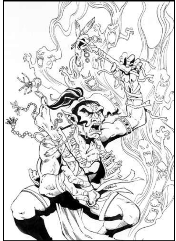
Artwork by Andrea Sfiligoi

While the majority of goblins are to be found beyond the borders of the Established Lands, small bands still inhabit the woods and lonely places of the west.