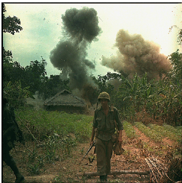
USMC ON S&D MISSION DURING OPERATION GEORGIA, 1966.

Once you know your squad is going on a Mission roll 2d6 on the Mission Type Table appropriate to your AO to determine what that Mission will be.