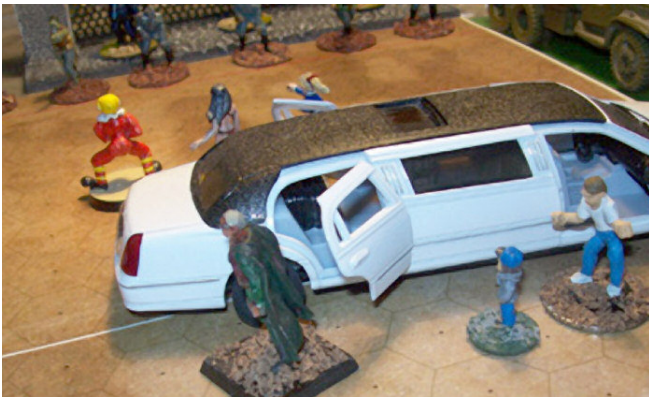
Top The baiters have arrived. Bottom The baiters step out.

revolve around New Hope City. New Hope City is a backwater community of one million or so folks both basics (humans) and aliens. Tucked away from the prying eyes of Gaea Prime, almost anything goes in NHC and wealth and fame can be won and lost in a variety of ways. I'm not going to divulge too much but here's a looksie at the "alive and well" sport of Zed racing in New Hope City.