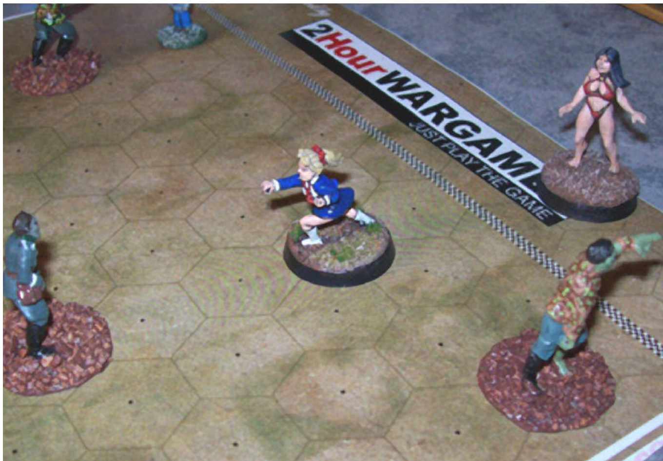
Boy Scout Billy's last chance.

out, Bambi has whipped her zed into a frenzy and he's now in first. Lucky for her, when M&M fell to the ground earlier in the race she dodged out of the way of the two zeds that fell upon him. Looks like we have an opening for a baiter for next week's races!