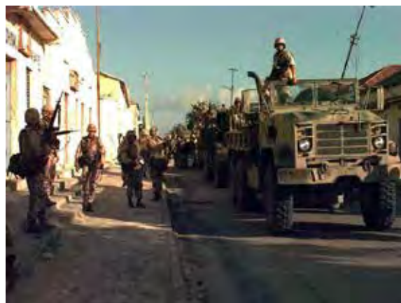
2 nd BN, 3 rd INF guarding a supply convoy, 1999

While they were not happy with losing their M48's to the 2 nd Brigade veterans from Europe they are confident that their M8's can continue to prove superior to anything they come up against. Their last two Sheridan's, dubbed "Thing One" and "Thing Two", are seen as lucky vehicles by their crews, with both vehicles bearing the scars of multiple attempts to destroy them since they were air transported to Kenya in 1997. The 2 nd of the 73 rd has recently received eight Casspir APC's and 90 new recruits to bring it back up to strength.