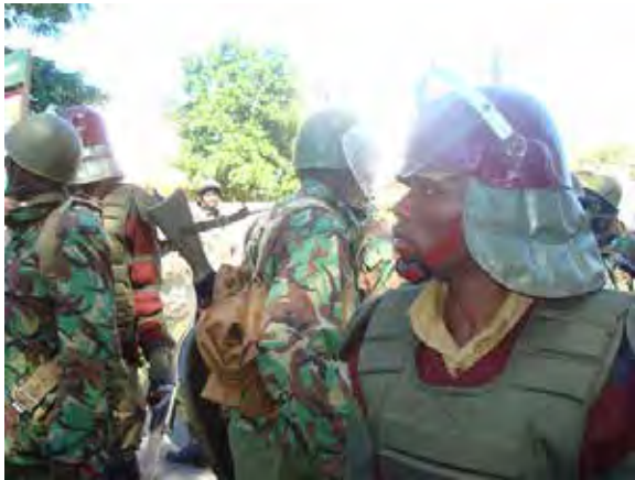
GSU Police, Nairobi, 1998

Companies A and D have been deployed to Moyle and Wajir along with KPR units to assist the American and Kenyan military in those areas, while companies H and I have been deployed to fight bandits and cattle thieves in the Eastern Province. Company B has recently arrived in Garissa to assist in garrisoning the town, Company E is at Lokichar to guard the oil wells there and Company F is at Kisumu.