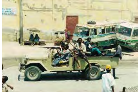
Technical, Somalia, January 2001

helicopters and light armored vehicles. As the war has gone on several of the better trained units have become adept at using their Technicals to act more as organized light armored cavalry formations instead of the disorganized mob attacks of 1997 and 1998.