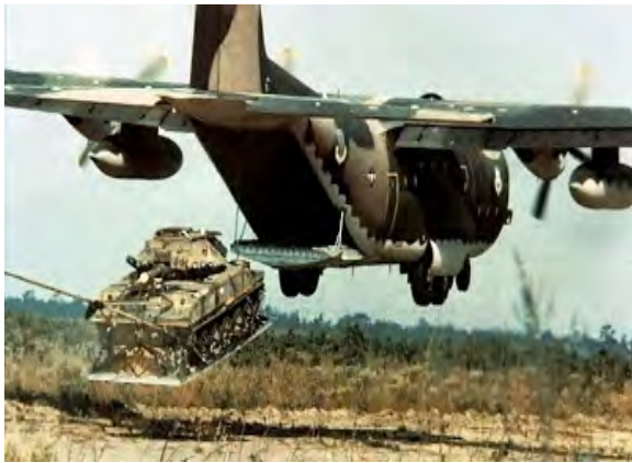
Sheridan air-dropped south of Nairobi, 1997

take quite the toll of the small force of Zambian armor (Ferrets and PT-76 light tanks) backing up the volunteer brigade.