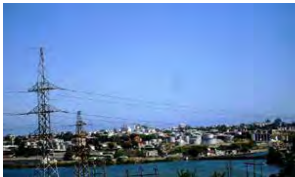
Mombasa port and refinery

The refinery runs around the clock processing oil into gasoline, lubricants, diesel fuel, jet fuel and bunker fuel. The damage from the attack has been fully repaired but only due to heroic efforts by Operation Harvester to gather spare parts and electrical equipment, efforts that were very expensive in lives and resources.