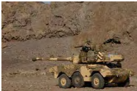
Sagaie attacking Somali marauders, 1999

These three Foreign Legion units have seen extensive action, fighting against Ethiopians, Eritreans and Somalis in small and large scale actions since 1995. They have earned their reputation for fierceness and aggression, a reputation earned at a high cost in lost men and equipment over the past six years. The 2 nd Infantry Regiment has taken particularly heavy casualties, reduced to 600 men from its original 1230, while the 1 st Cavalry has lost almost a third of its complement.