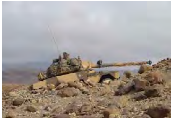
13 th Foreign Legion Demi-brigade, Djibouti

with French troops ranging far into Eritrea, Somalia and Ethiopia to attack rebels, Somali Islamist, Ethiopian and Eritrean forces. The French take many casualties from improvised bombs and mines and ambushes as their enemies avoid large scale engagements.