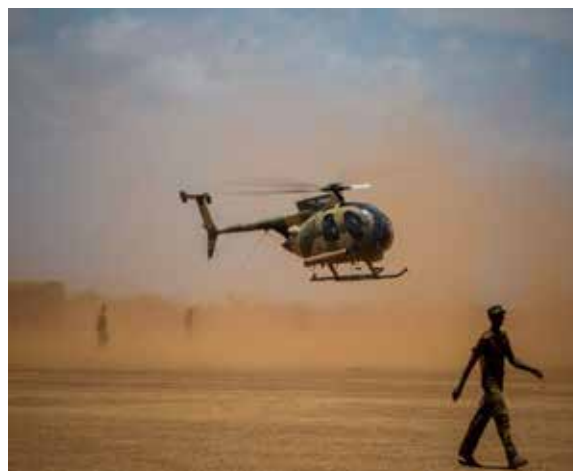
MD500 taking off from Wajir, March 2001

The Air Cav was a vital part of the defense of Kenya against the Tanzanians and they paid the price for that effort, losing many of their helicopters to SAM's and AA guns. Those pilots who remain are all veterans of that time and as such are highly skilled in attack and evasion.