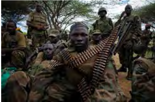
LRA soldiers, CAR, 2001

In the eastern provinces of the Central African Republic (CAR), some eight hundred LRA guerrillas organized into bands of varying sizes supported logistically by the Joshua Brigade from northern Orientale Province, reinforced by one thousand marauders and ex-CAR soldiers, are making substantial territorial gains with the mutiny and desertion of much of the country's army in 1999, which essentially left the country almost defenseless.