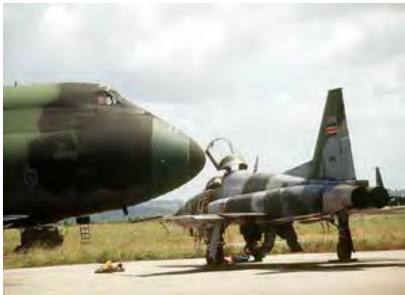
Kenyan F-5E with US C-5, Moi AB 1997

The 2 nd was crucial in the effort to stop the Tanzanian effort against Mombasa, losing over a dozen Tucano and Hawks shot down by Tanzanian AA guns and missiles while doing so. The squadron is being prepared to deploy to support the 3 rd Brigade against the Somalis.