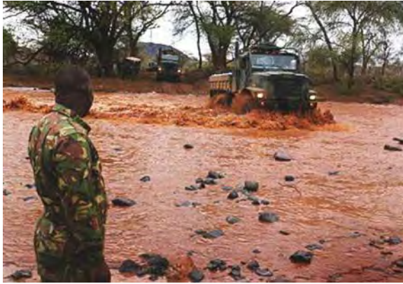
Kenyan forces on a relief mission during the worst of the flooding, March 1998

second convoy arrives from the US. With US logistics being strained even further by the efforts to help civilians during the flooding, the Somali and Sudanese invaders still retain a foothold in northern Kenya.