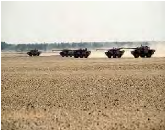
AMX-10RC tanks in action, Djibouti 1998