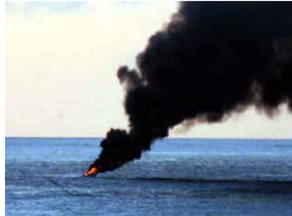
Pirate vessel, afire and sinking, photographed by the USS Edwards, Dec 2000

these pirates there is a force of several ships that represent the last contingent of Soviet forces operating in Eastern Africa. They are crewed by what remains of the Soviet forces that escaped the nuclear fires at Maputo and Victoria or managed to make it to shore from their sinking ships. The Soviets have two bases, one at Mafia Island and another at Kilwa Masoko on the Tanzanian mainland, where they brew alcohol to fuel their vessels and to sell to local warlords in exchange for food and ammunition.