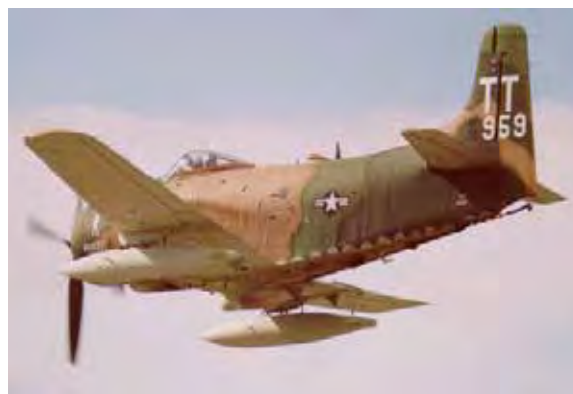
AD-4N over Northern Kenya, June 1998

The battalion's strength has since been augmented by six AD-4 Skyraiders from Chad (two of which were only useful to provide spares) that were in storage in Mombasa waiting to be shipped to collectors when the war broke out and three FTB337G Milirole aircraft that were obtained by Operation Harvester. Its pilots are a colorful batch of men who are veterans of Vietnam and/or firefighting air units and thus are masters at low level ground support missions.