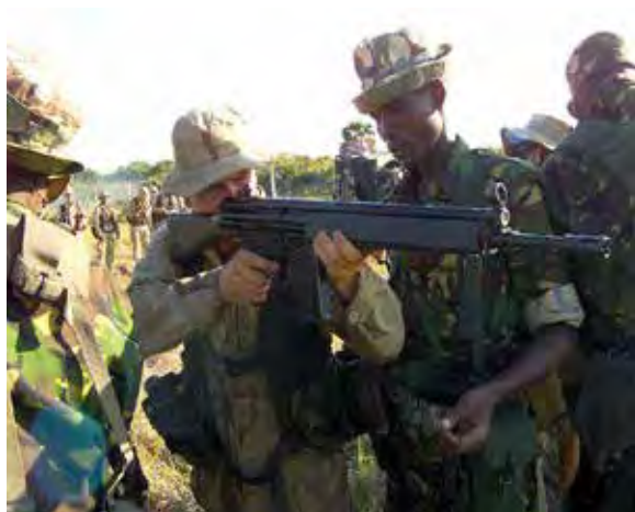
Kenyan soldiers and US Marines, Pemba, 2000

The 7 th Battalion assisted the USMC in the taking of the island and is part of the garrison force there. They have trained extensively with the USMC since taking Pemba and are now considered one of the most elite forces in the Kenyan Army.