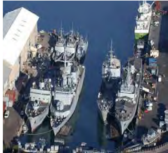
French naval flotilla in port in Réunion, May 2000

The 10,000 ton RV Marion Dufresne was originally assigned to service the districts of the Crozet and Kerguelen Islands, and the smaller islands of Amsterdam and St-Paul, delivering supplies, fuel, and personnel to the three permanently manned bases there. With the outbreak of WWII it has been taken over by the French Navy as a transport and logistics vessel, able to transport several hundred armed and equipped soldiers. It has been armed with two 12.7mm machine guns and two 20mm autocannons.