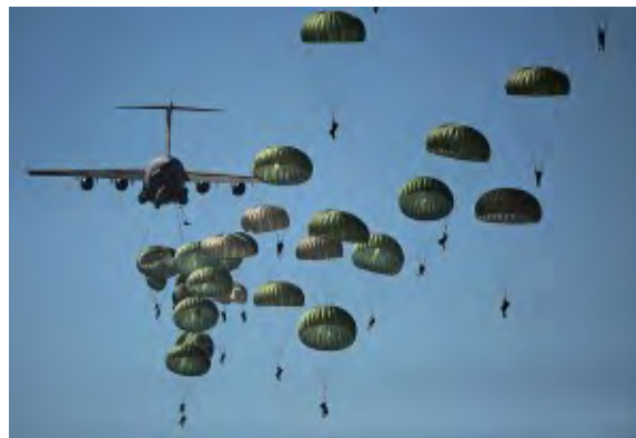
Parachute drop near Kisumu, February 1998

Even now, after absorbing several hundred new recruits from American and European volunteers, it is still significantly under strength.