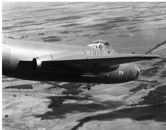
South African Canberra approaching Maputo, Dec 10 1997

Three South African 38kt weapons delivered by missiles detonate over Angola's capital of Luanda, targeting the government, the refinery and the main bases of the Cuban and Angolan bases in the city, destroying much of the city along with the refinery there. The third warhead detonates almost directly over the airbase that harbors most of the Cuban air power in Africa, destroying all the aircraft based there.