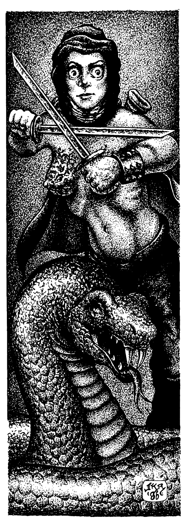
Harka Bey Assassin

Porta is worshiped by sailors who wish safe voyage across the unknowable deep seas. As a demon, she commands some of the