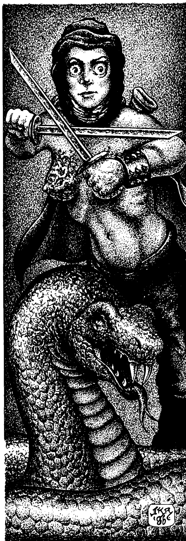
Harka Bey Assassin

Porta is worshiped by sailors who wish safe voyage across the unknowable deep seas. As a demon, she commands some of the