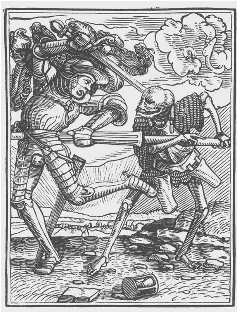
From "The Dance of Death" (1523-25) Hans Holbein the Younger