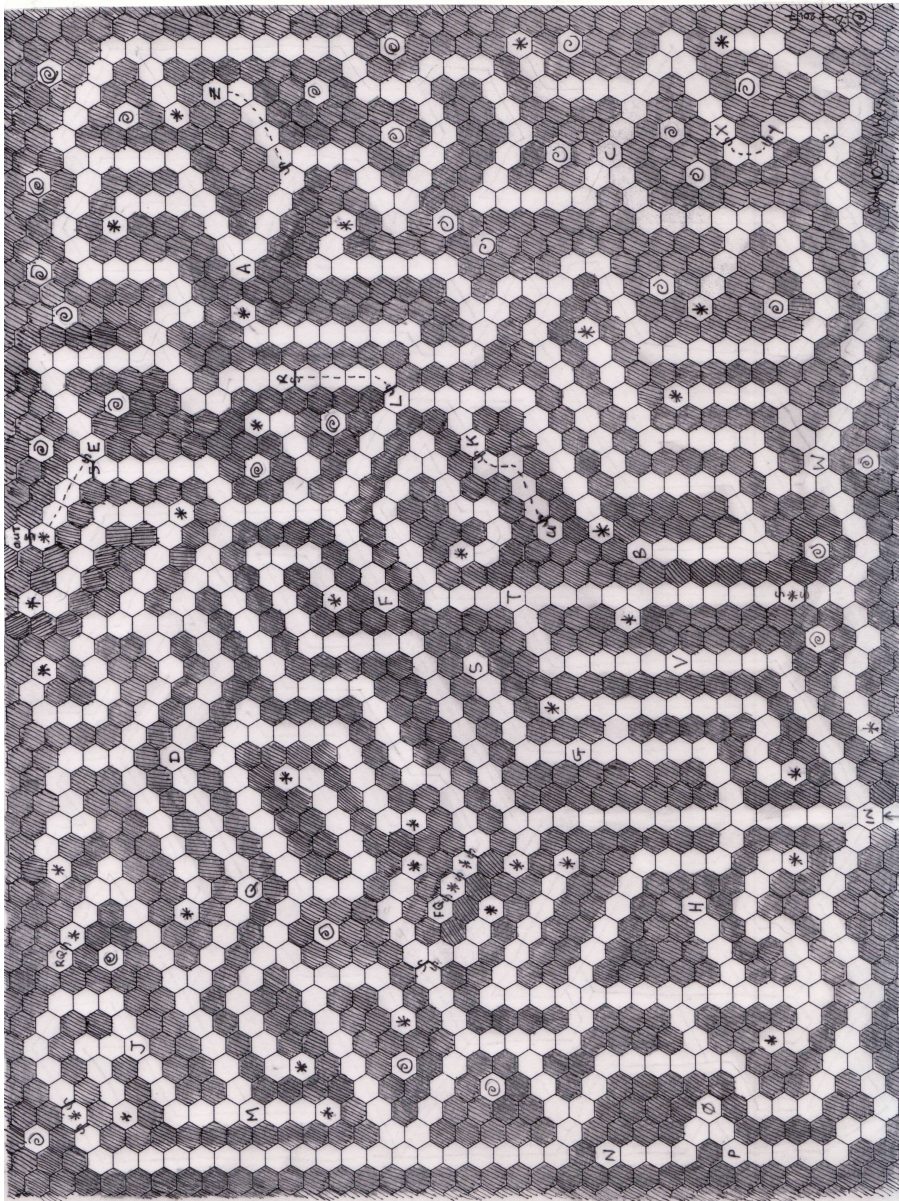
THIS WAS THE ORIGINAL VERSION OF THE MAP (Also available as free A4 PDF on request).