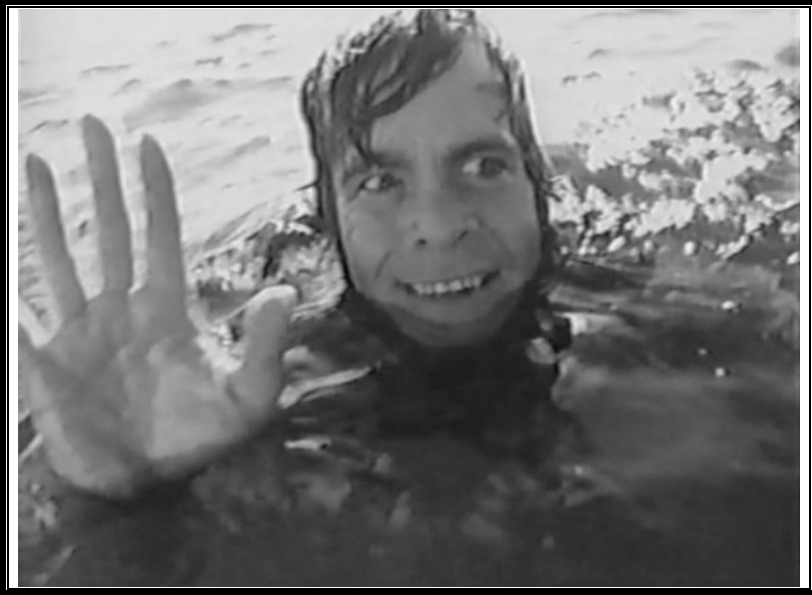
Doug McClure – “Satan’s Triangle” - 1975

There’s a long forgotten, cult TV movie from 1975 called “Satan’s Triangle” (AKA “Devil’s Triangle”)*. It’s a cool, demonic piece set at sea in the Bermuda Triangle and starred Doug McClure and Kim Novak. It’s a film with a twist and it’s (SPOILER) that final look on the now-possessed McClure’s face, at the end of the film, which inspired this module.