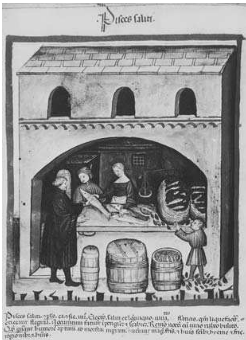
Buying fish. From Tacuinum sanitatis in medicina , 14th century. Cod. Vind. Series Nova 2644, fol. 82v.