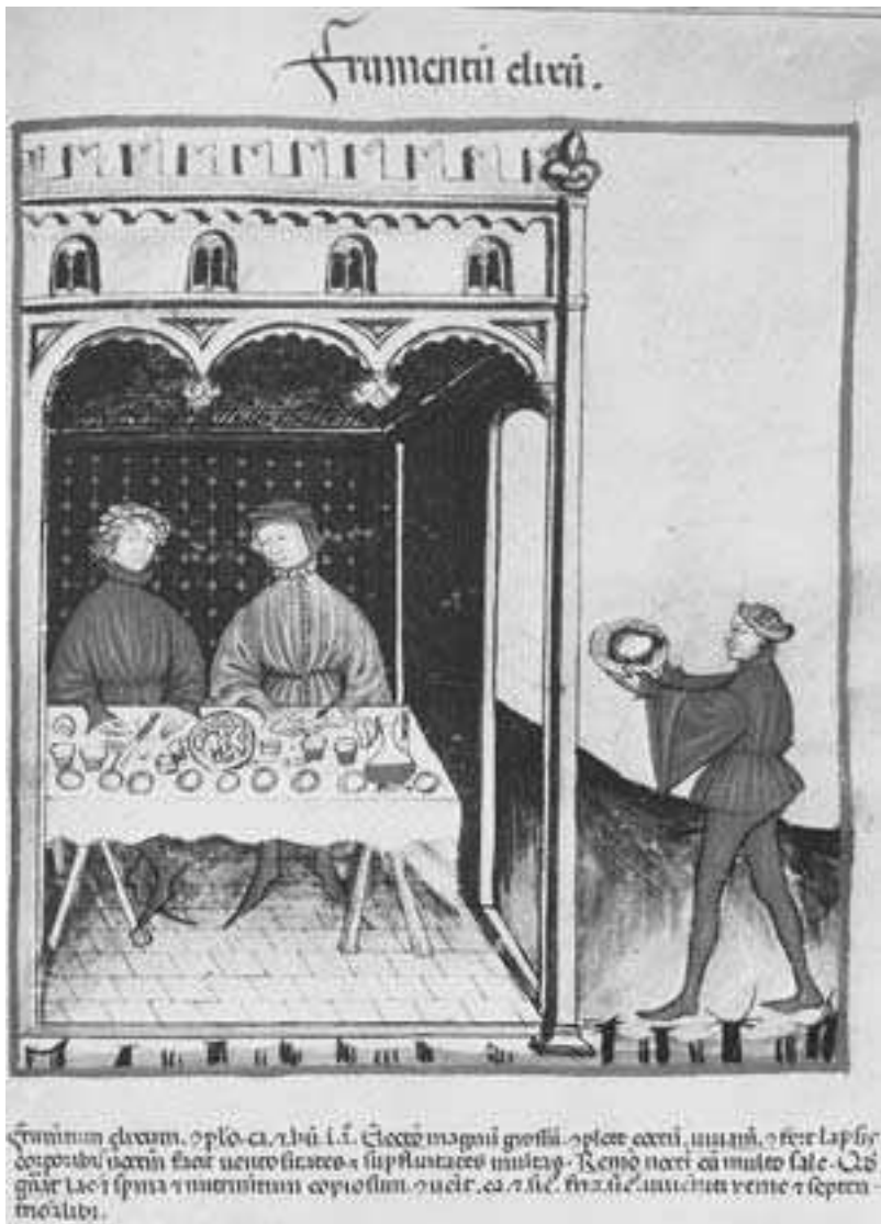
Serving frumenty. From Tacuinum sanitatis in medicina , 14th century. Cod. Vind. Series Nova 2644, fol. 53r.