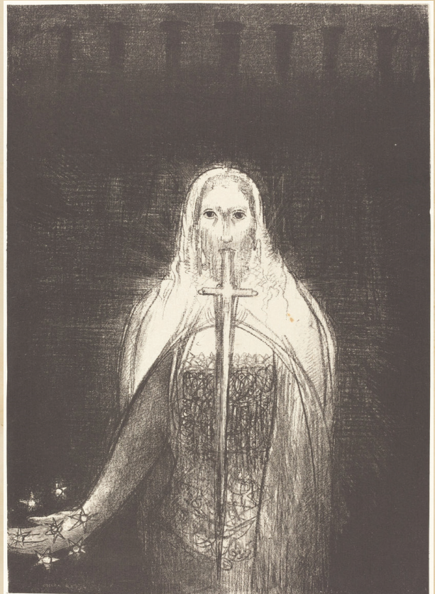
... Et il avait en sa main droite une épée, et de sa bouche sortait une épée à deux tranchants.

Like the bastard's halos, the magical cloaks were created by the Grigori for their children. Knowing they nephilim would have no place in the natural order the cloaks were given created to protect them from the elements. Anyone wearing this cloak is comfortable in temperatures from -10 to 110 degrees Fahrenheit. In addition, they stay dry, even in the strongest rains.