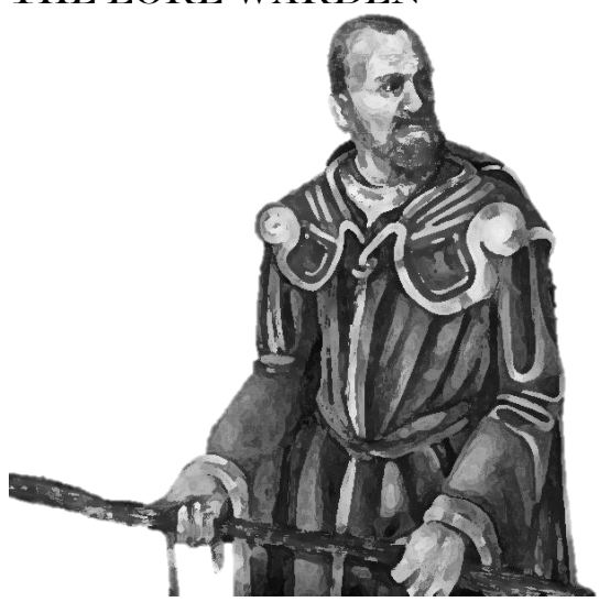
THE LORE WARDEN

Highly respected, Lorewardens have located and deeply connected with the true forces of nature. They have a solemn duty to guide and teach everyone to cherish and understand the nature of the Land, regardless of race, class or alignment. The Lorewarden does not use magic, psionics or technology to acquire or maintain her skills; she is in harmony with energies beyond the ken of most people, and it is that fact which gives her life and purpose.