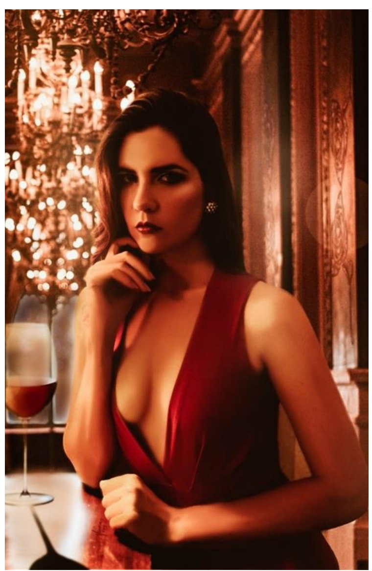
Lady busk: A ghouf's tale