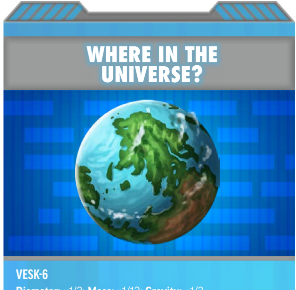
Diameter: ×1/2; Mass: ×1/12; Gravity: ×1/3 Atmosphere: Normal; Day: 54 hours; Year: 20 years

On the outskirts of the jungle stands a stone entranceway overgrown with moss. Stone-carved lizards encircle an empty socket in the gray stone. A constant low rumble emits from within, as slowly swinging pillars move over a floor inlaid with