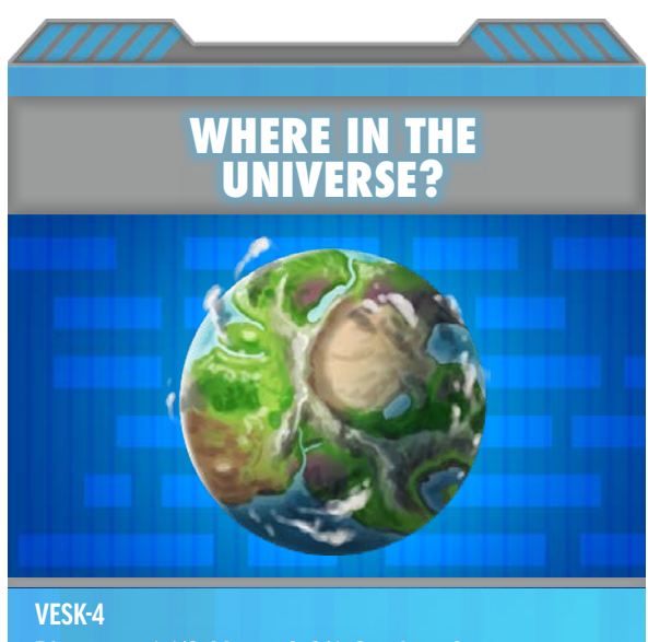
Diameter: ×1–1/2; Mass: ×6–3/4; Gravity: ×3 Atmosphere: Normal; Day: 25 hours; Year: 8 years

Venture-Captain Naiaj sends the PCs to Vesk-4, a resource-rich mining colony in the Veskarium. Deep within the arid Lodelands