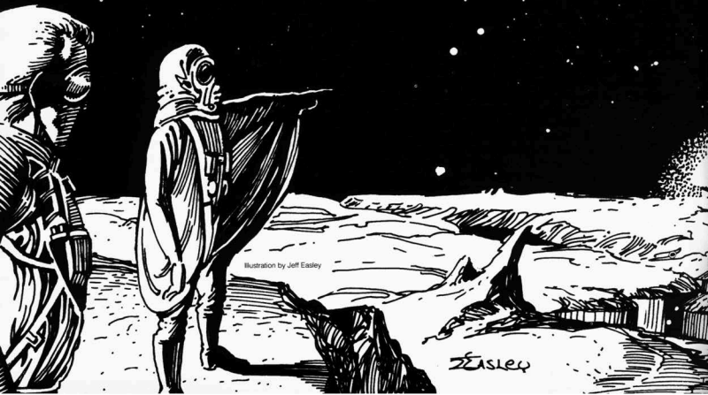
Illustration by Jeff Easley

Before him stretched a red plain, strewn with yellow-speckled boulders. To his eye, the ground had the same gentle swelling consistency as his mother's oatmeal. Plants, resembling giant fuzzy blue mold, swayed gently in the roasting breeze; they threw complex shadows from the light of the eight bright moons overhead. The air was dense enough to feel like paste; it clogged his lungs, nearly choking him. His feet dragged, held in the grip of 6 Gs. "Oh s_____," he said, "not again!"