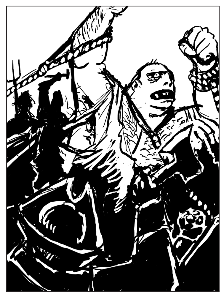
Volya is torn apart by a mob