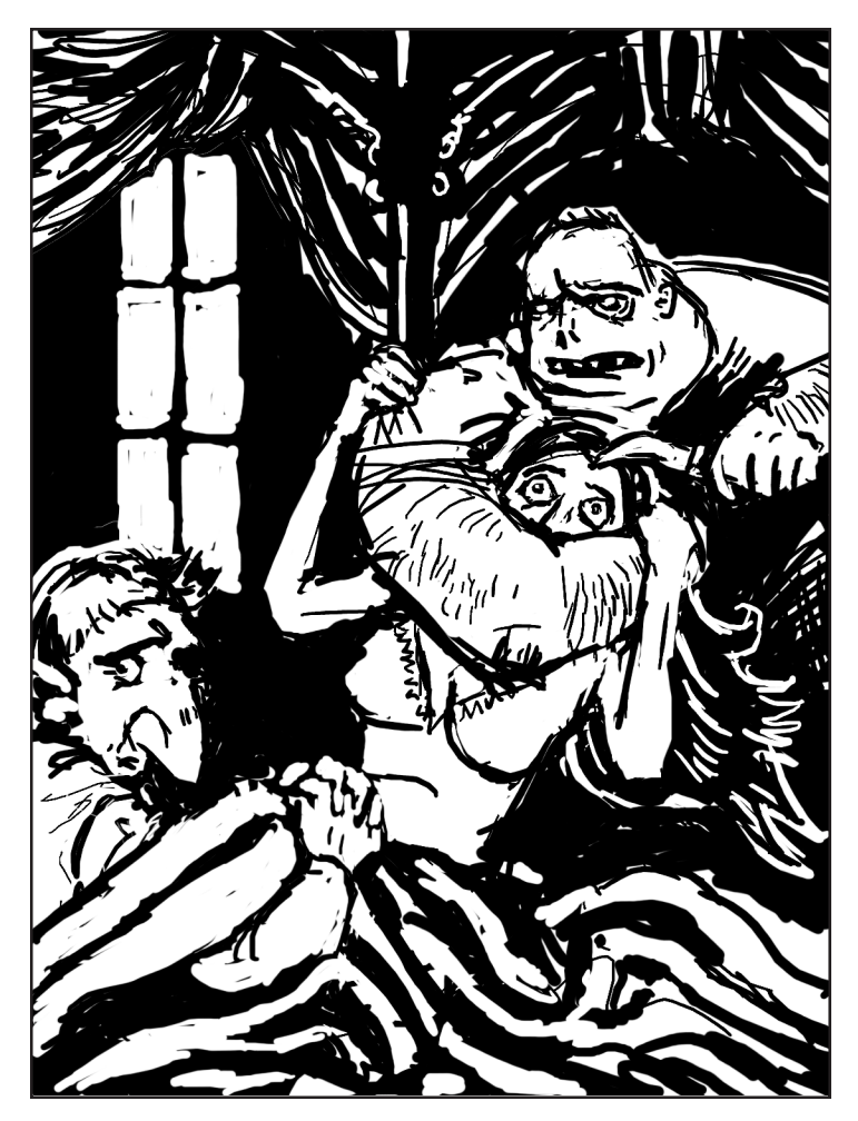
Minions do horrific things