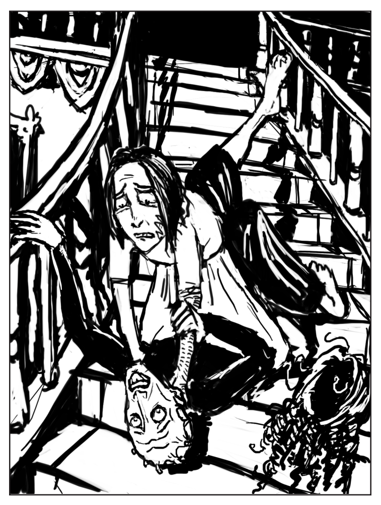
A minion will cause the demise of the Master