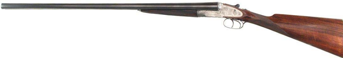
England, Bozard & Co. Dbl. Shotgun, 1880, 1 shot per trigger, Top Break, 16 ga, 8.5 lb.

Also: Remington Dbl. Shotgun, 1877, 1 shot per Trigger, Double Barrel, Top Break, 30" barrel, 12 or 10 ga, 8.4 or 8.8 lb.