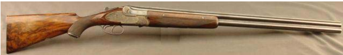
Belgium, Heym Hammerless Over/Under, 1908, 1 shot per Trigger, 2 barrel Over Under, Top Break, in 20, 12 or 10 ga, 8.2, 8.6 or 9 lb.