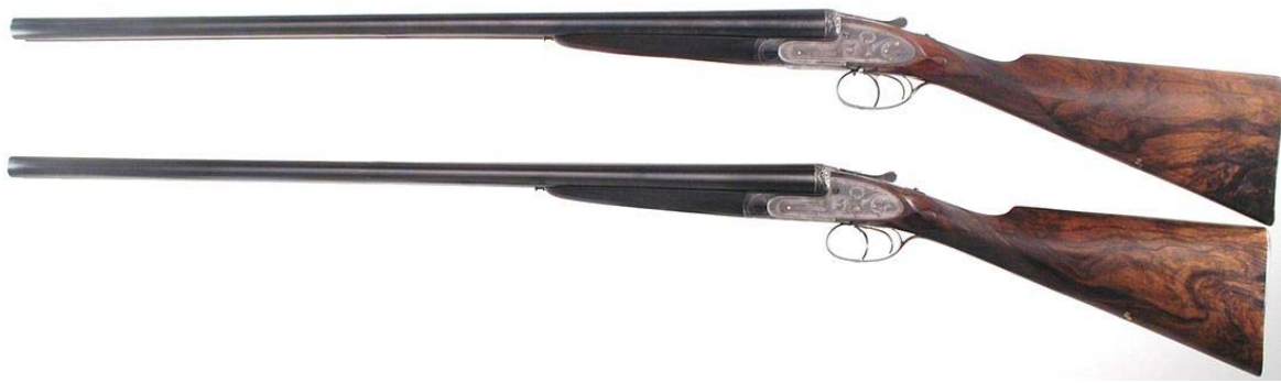
England, Purdey Hammerless Dbl. Shotgun, 1904, 1 shot per Trigger, Top Break, 12 ga, 7.2 lb. (set)