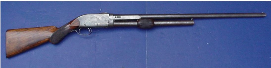
USA, Spencer Pump Shotgun Mod. 1882, Pump Action, 5 shot Tube Mag under barrel, 12 ga, 9 lb.