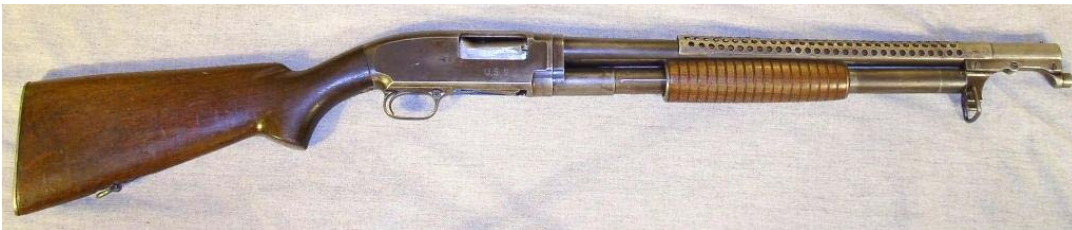
USA, Winchester Mod 1912 Hammerless Trench Shotgun, 1912, Pump, 12 ga, 20-inch barrel, 5+1 shot tubular mag under barrel. It had a M1917 bayonet attachment.