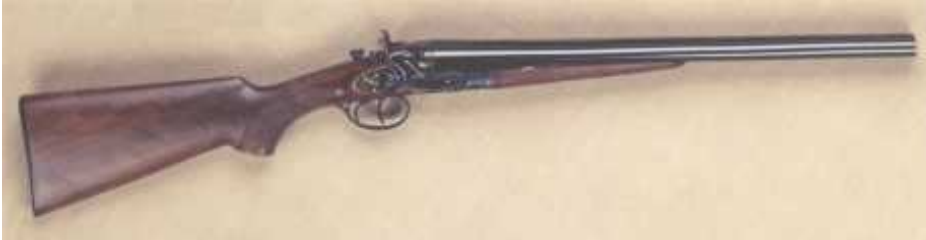
USA, Remington Dbl. Scattergun, 1877, 1 shot per Trigger, Double Barrel, Top Break, 18" barrel, 12 or 10 ga, 7.8 or 8 lb.

Also: Remington Dbl. Shotgun, 1877, 1 shot per Trigger, Double Barrel, Top Break, 30" barrel, 12 or 10 ga, 8.4 or 8.8 lb.