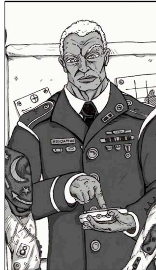
Done Deal 21

Benjamin is cold, stubborn, and impatient. He won't tolerate any attempts at deception or inappropriate behavior. He will, however, show some respect for a worthy opponent.