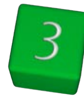
Min die + Max die = 10

Basic actions use your Mid die—the middle value of the three dice you rolled. Some abilities and other traits use your Min (lowest rolling) or Max (highest rolling) die instead, or some combination, like your Min+Max (lowest rolling plus highest rolling). If an ability does not specify a die, use your Mid.