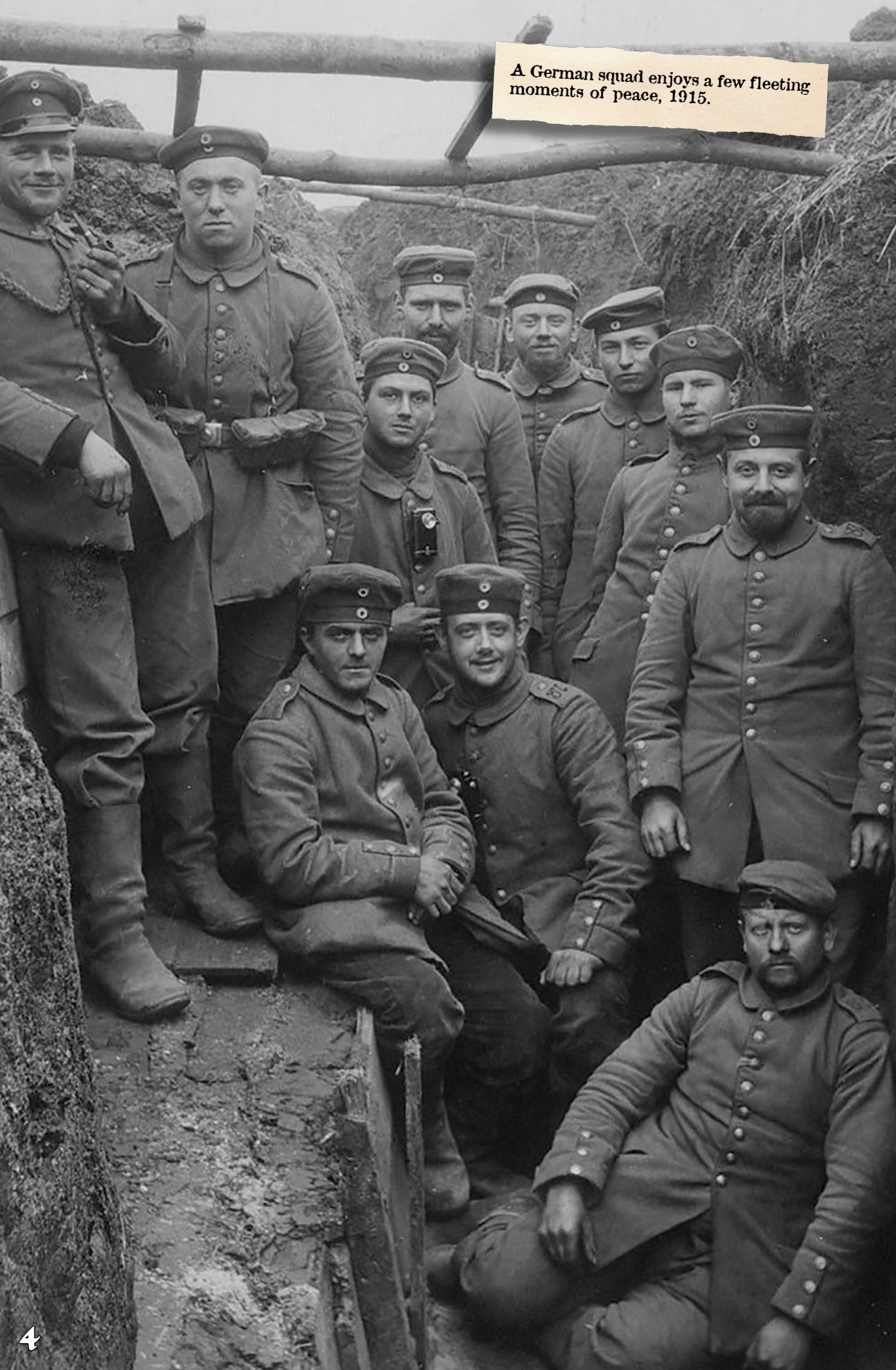
A German squad enjoys a few fleeting moments of peace, 1915.