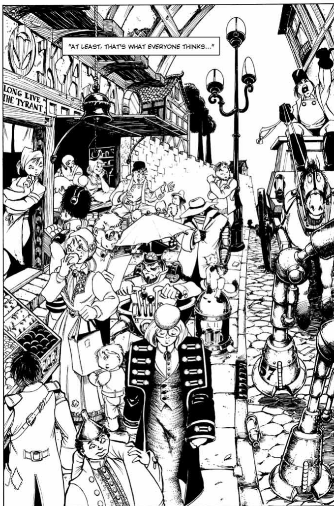
girlgeniusonline.com Girl Genius® & ©2000 Studio Foglio, LLC

Soon after, the peace fractured, as the Great Houses resumed their squabbling, and rushed to fill in the void that the loss of the Heterodynes and the Other had left. In a few short years, it was as if the peace had never existed.