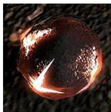
Acid Anomaly Artifact Table