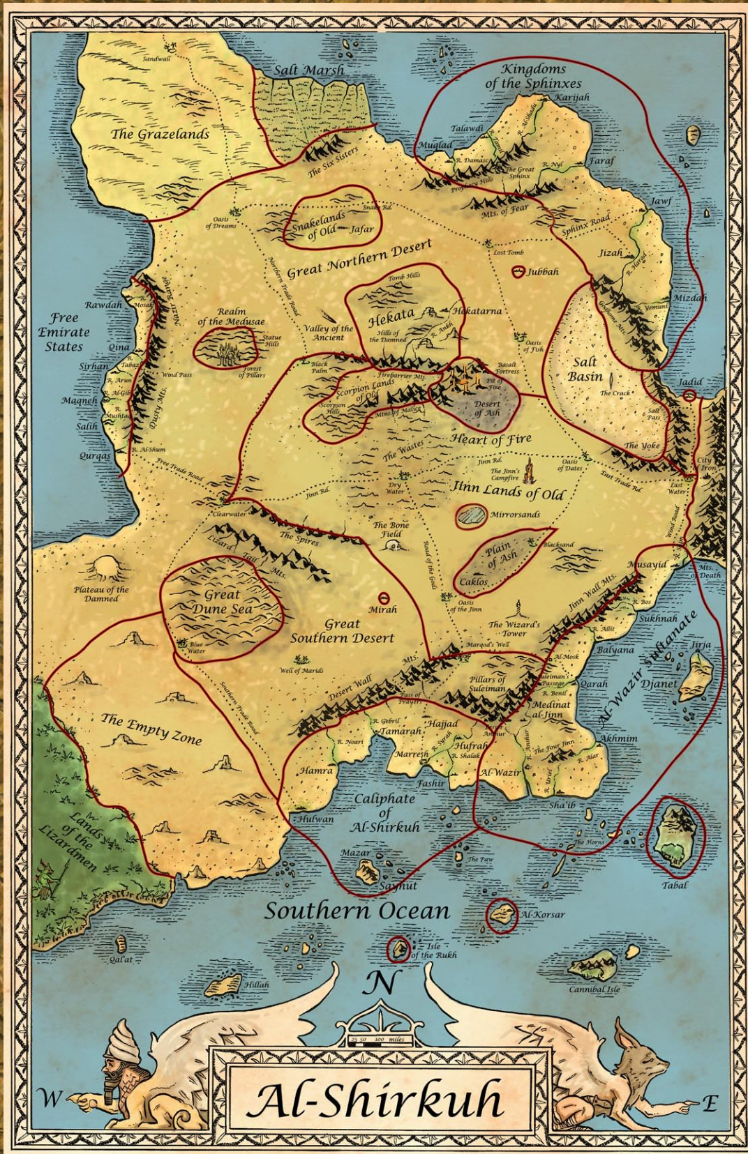
This version of the Al-Shirkuh map is an early prototype. It may not be the final map used for the Canvas Map.