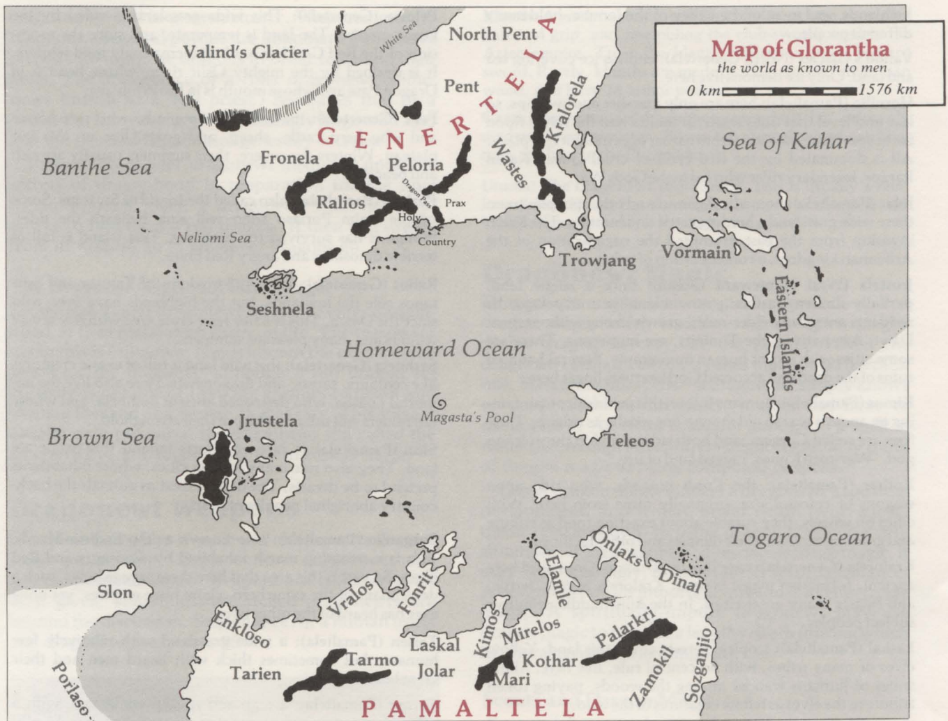
This is a map of the world of Glorantha as known by men. There are significant land masses beyond the map boundaries, but these are inhabited by giants, immortals, gods, and other magical creatures.

the Brown Sea, which splits into other lesser seas. The Neliomi current rips great icebergs from Valind's Glacier and sends them south. The main Banthe current enters the homeward swirl of Magasta's Pool.