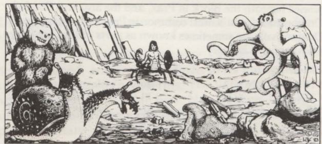
Here we see an association of some of the chaos creatures of Glorantha. To the left, the trained dragonsnail of a jack o' bear confronts a smallish gorp. Behind the gorp a walktapu watches, sure that the dragonsnail will quickly finish-off the amorphous chaos-slime. To the rear a scorpion man warily approaches the others.