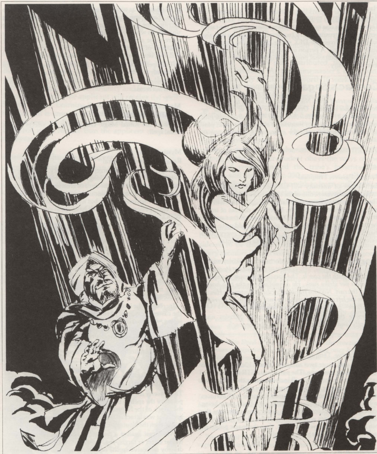
Nikolos summons a delectable nymph. Besides the common uses of such a being, Nikolos intends to question her closely about the area she commands.

Lance roll is unsuccessful the sorcerer still loses the Magic Points. Armor and spells which protect against physical damage will work normally. The substance under the effect of the Form/Set can be used again and again as a Lance, for the Form/Set spell's duration.