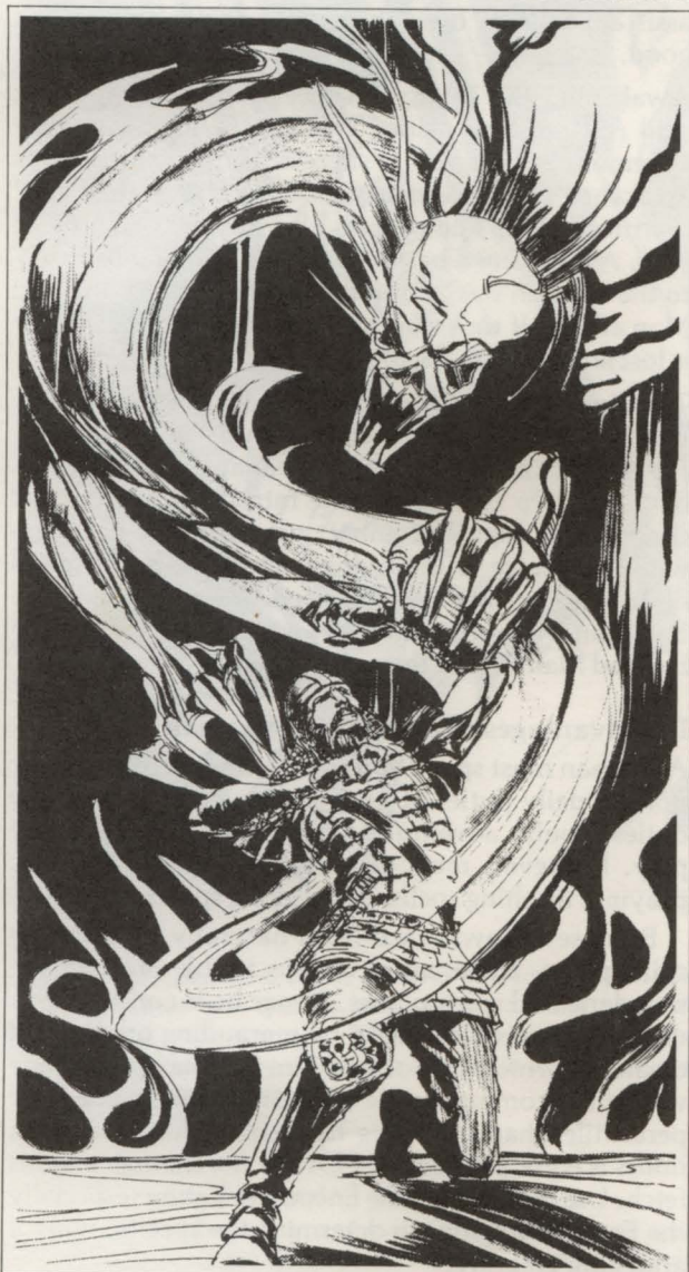
Cormac battles a Wasting Disease spirit. Cormac must overcome the spirit's magic points with his own while the spirit must overcome Cormac's STR.

who wish to try to learn a spell from a shaman must first make his acquaintance. This is done by seeking him out, presenting a gift worth a minimum of 500 pennies per spell point desired, and then spending time in the area ingratiating himself to the tribespeople through acts of friendship, kindness, and protection. In general, the more gifts distributed, the better the stranger's chances. At the gamemaster's discretion, the shaman may require a gift worth 10 weeks of what the shaman thinks the stranger's income is, if that amount is larger than the traditional gift.