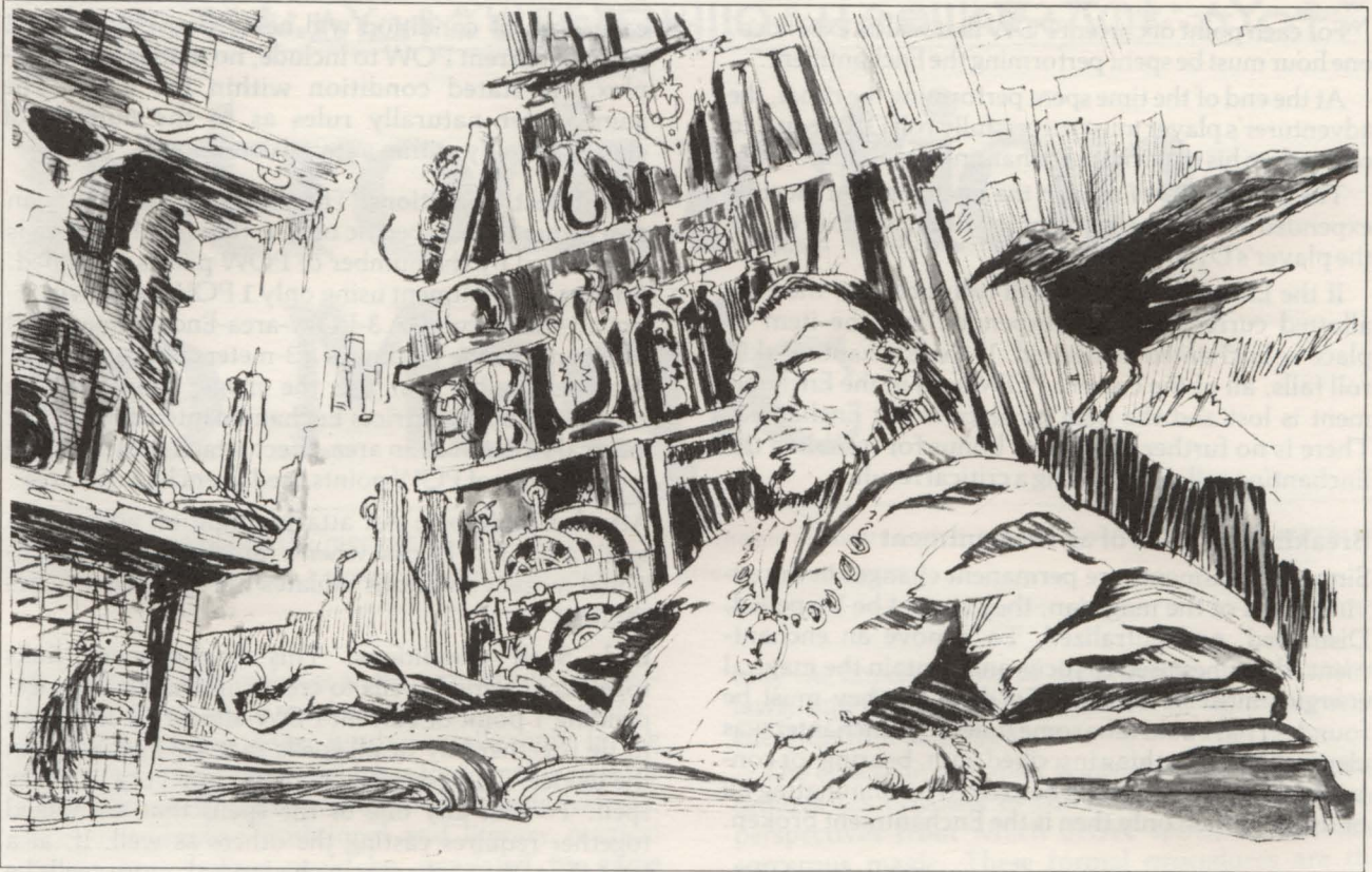
Here is Nikolos in his study, during a pause in his research into various types of summonings. All about him lie the instruments of sorcery: vials of strange animal parts and mixtures of rare chemicals, books on the arcane arts, magical implements, and cages for various live creatures.