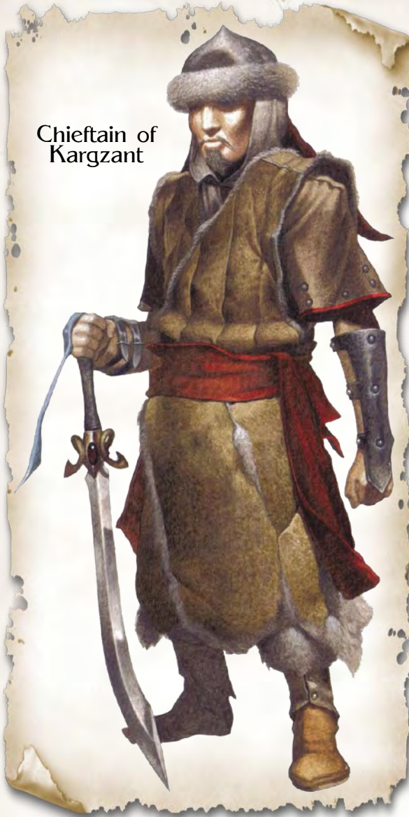
Chieftain of Kargzant

nomads simply moved on, remaining dominant in the wide lands of Pent. Recently, the Empire of Wyrms Friends have brought a tribe of horse nomads from Pent to Prax where they conquered the native beast riders and secured the border for the empire. The Pentans are shamanistic and loyally follow a very ancient religion. Their religion centres on worship of the sun and of horses, both of which are contacted through ancestors. Men primarily deal with salamanders; women with gnomes. Ancestor spirits are never integrated, but respectfully invited to reside in a fetish.