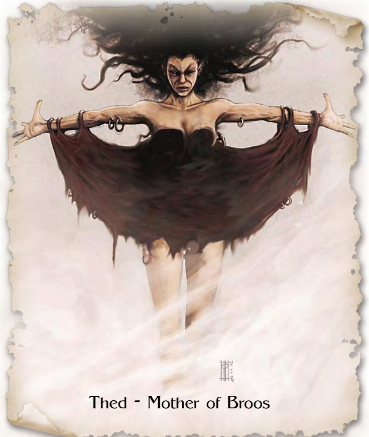
Thed - Mother of Broos

Spirit Ally: Any friendly Chaotic spirit.