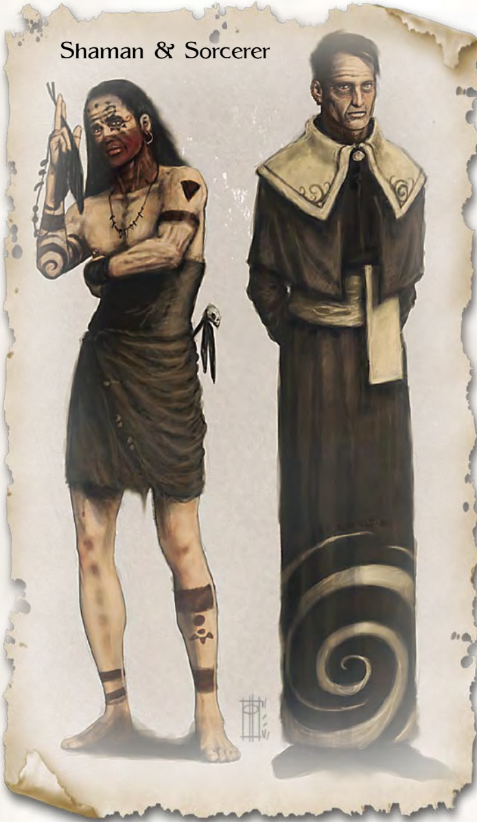
Shaman & Sorcerer

Churches usually include one or more saintly orders, which provide specialised magic for the worshipper. These so-called 'Low Orders' may belong to a single church but many saints