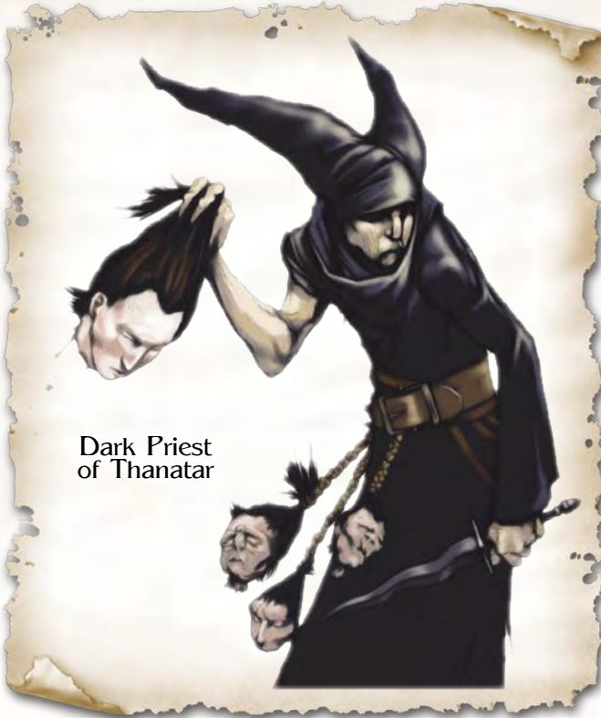
Dark Priest of Thanatar