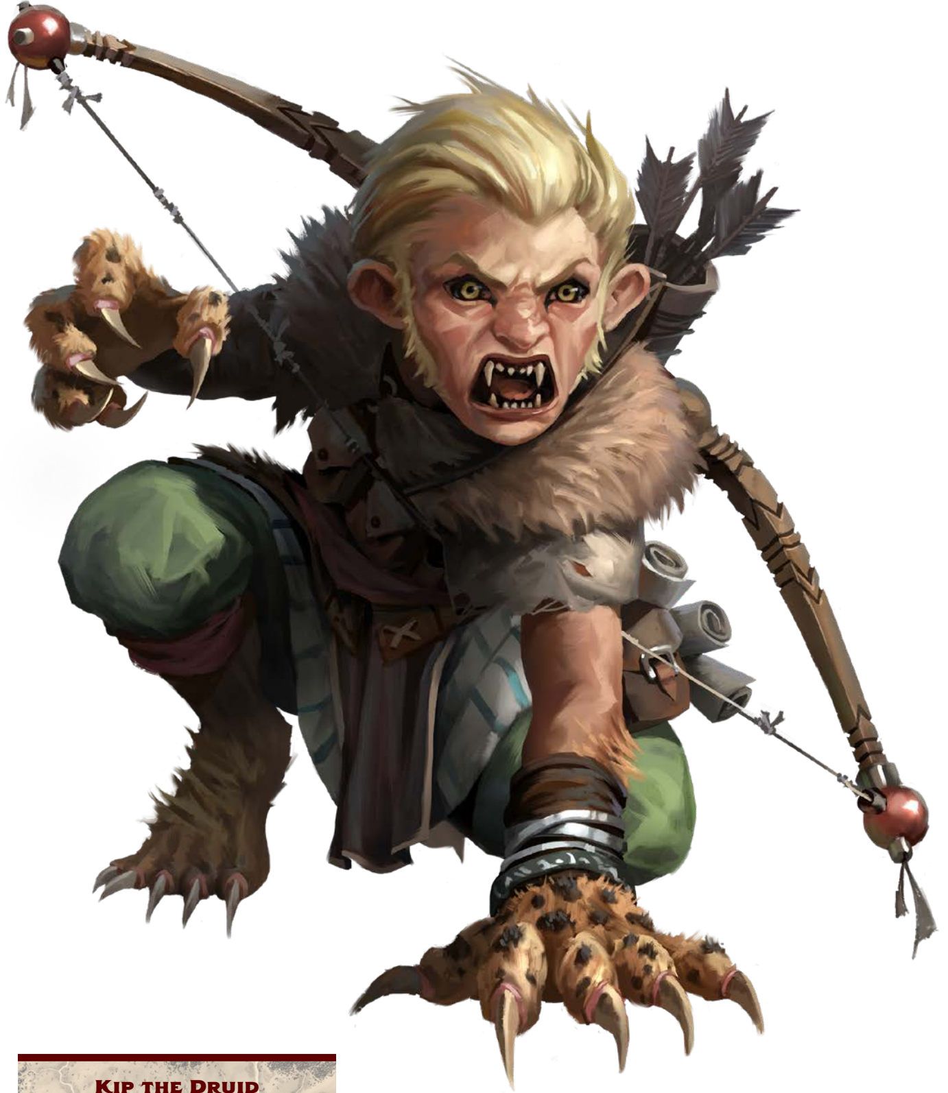
KIP THE DRUID