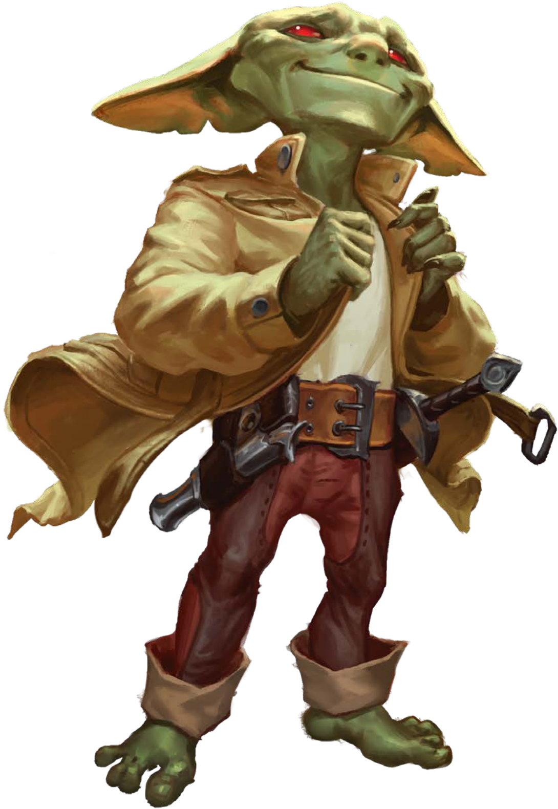
ZIG, EXPEDITION LEADER