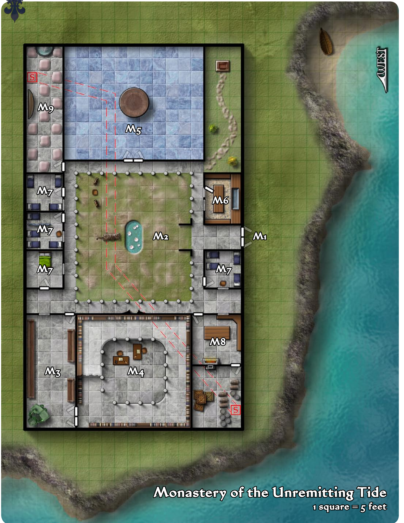
Monastery of the Unremitting Tide 1 square = 5 feet