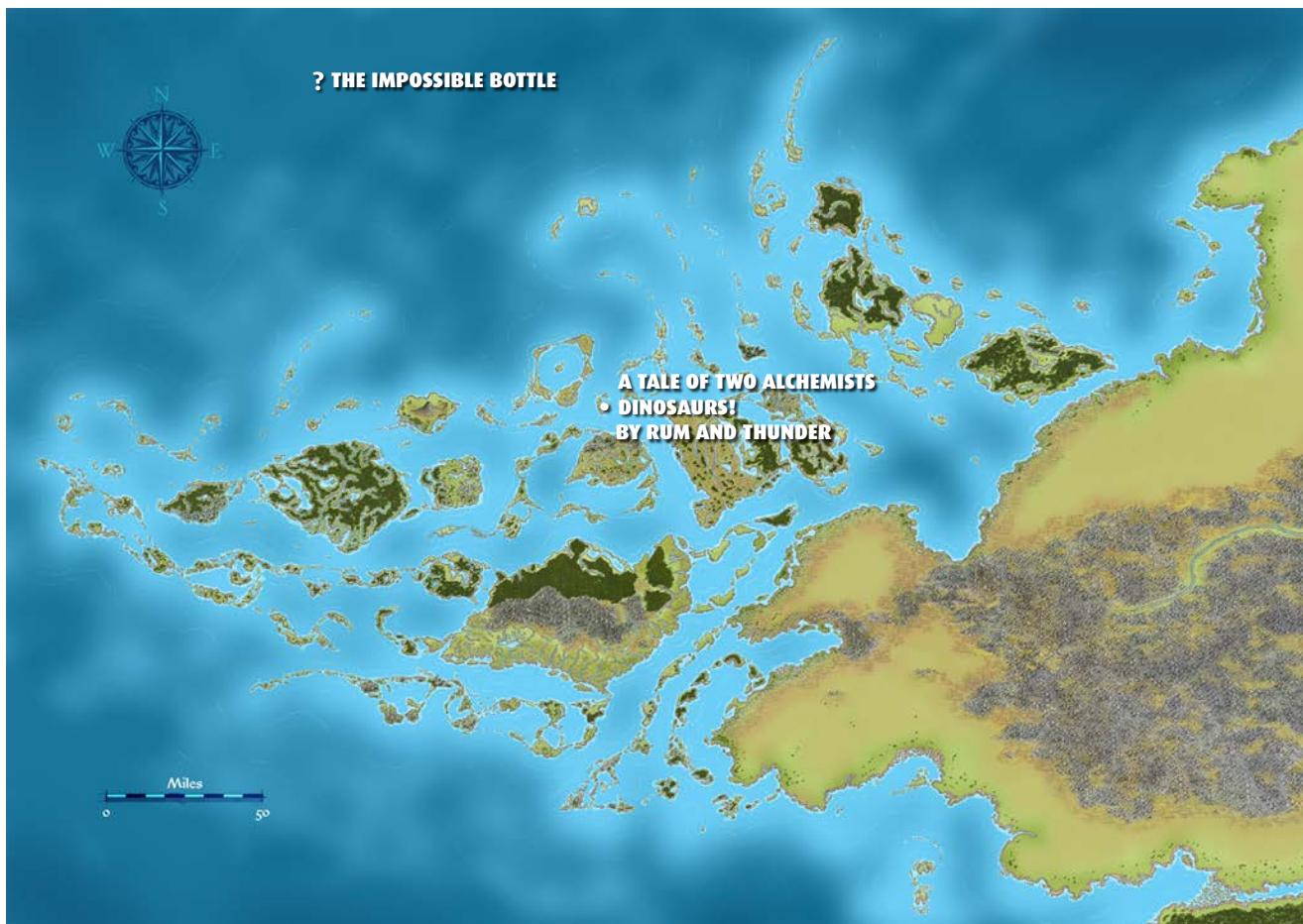
Cartography by Rob Lazzaretti

After completing Treacherous Waters, at the beginning of each new adventure, when you add a new Adventure Deck to your game box, remove all cards with the Basic or Elite trait that have adventure deck numbers at least 3 less than the adventure deck you just added. (Treat the set indicators B , C , and P as 0.) Do not remove Blessings of the Gods.