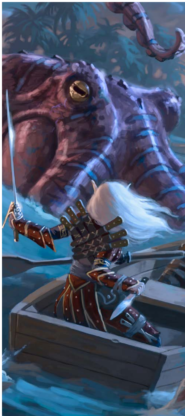
Illustration by Craig J Spearing