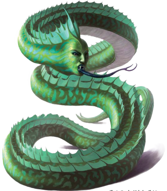
Illustration by Nicholas Cloister

CHOOSE ANY CLASS 2 OR LOWER SHIP AS YOUR SHIP.