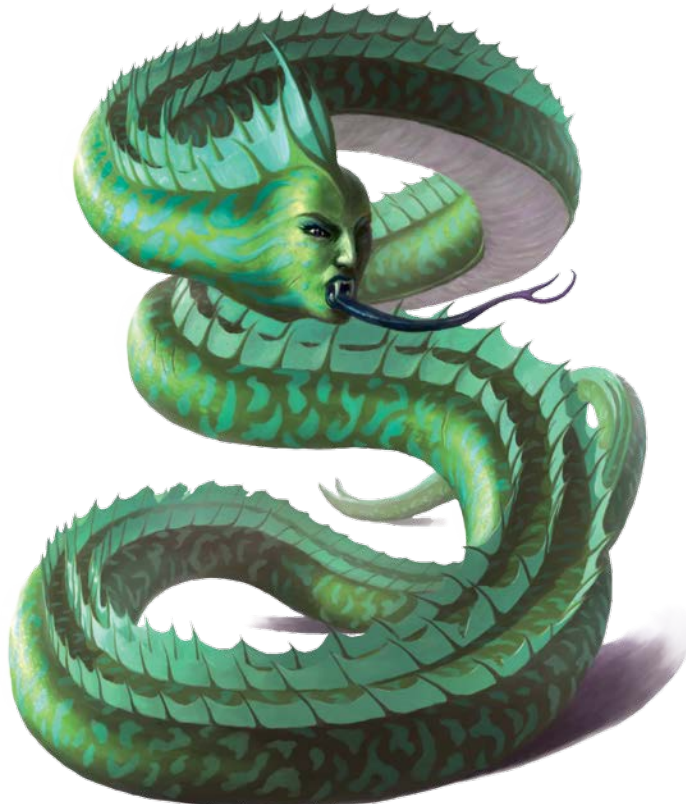
Illustration by Nicholas Cloister

CHOOSE ANY CLASS 2 OR LOWER SHIP AS YOUR SHIP.