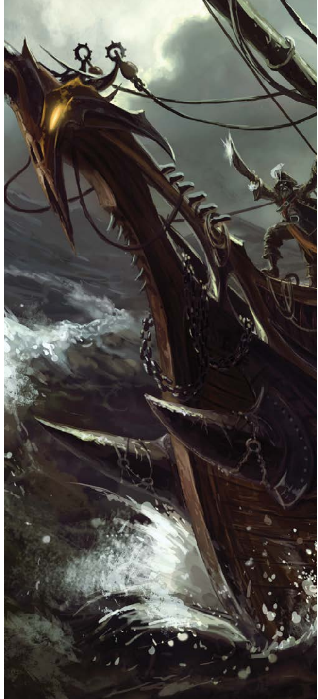
Illustration by Mariusz Gandzel