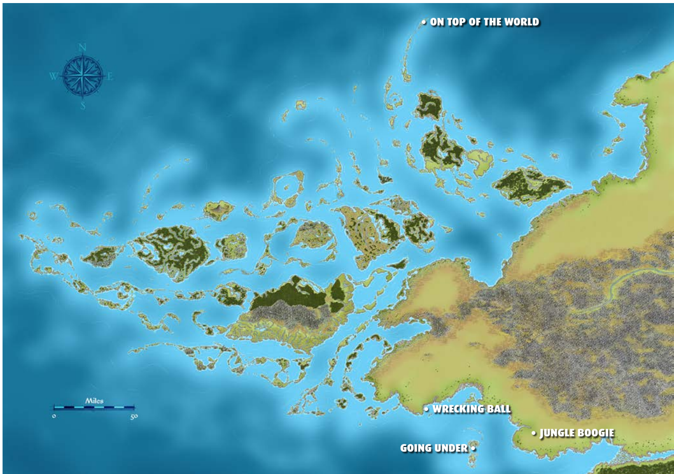
Cartography by Rob Lazzaretti

After completing Treacherous Waters , at the beginning of each new adventure, when you add a new Adventure Deck to your game box, remove all cards with the Basic or Elite trait that have adventure deck numbers at least 3 less than the adventure deck you just added. (Treat the set indicators B , C , and P as 0.) Do not remove Blessings of the Gods.