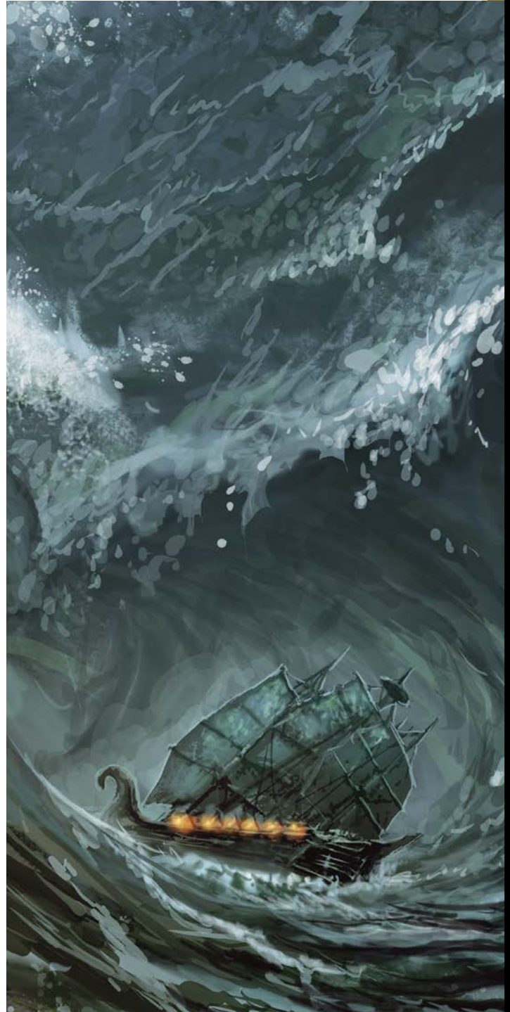
Illustration by Mariusz Gandzel