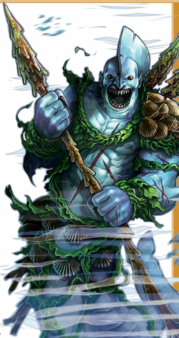
Illustration by Victor Perez Corbella

When you defeat the henchman Hammerhead Shark from a location deck, display it next to this scenario. For each such henchman displayed, the difficulty to defeat the villain Adaro Barbarian is increased by 2.