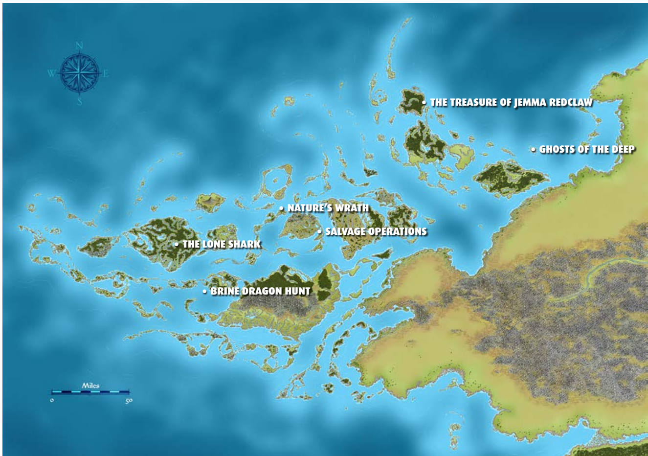
Cartography by Rob Lazzaretti

After completing Treacherous Waters , at the beginning of each new adventure, when you add a new Adventure Deck to your game box, remove all cards with the Basic or Elite trait that have adventure deck numbers at least 3 less than the adventure deck you just added. (Treat the set indicators B , C , and P as 0.) Do not remove Blessings of the Gods.