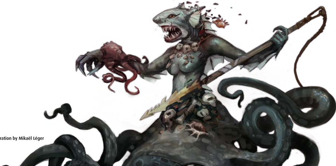
Illustration by Mikaël Léger

The difficulty of checks to defeat banes that have the Animal trait is increased by 4.