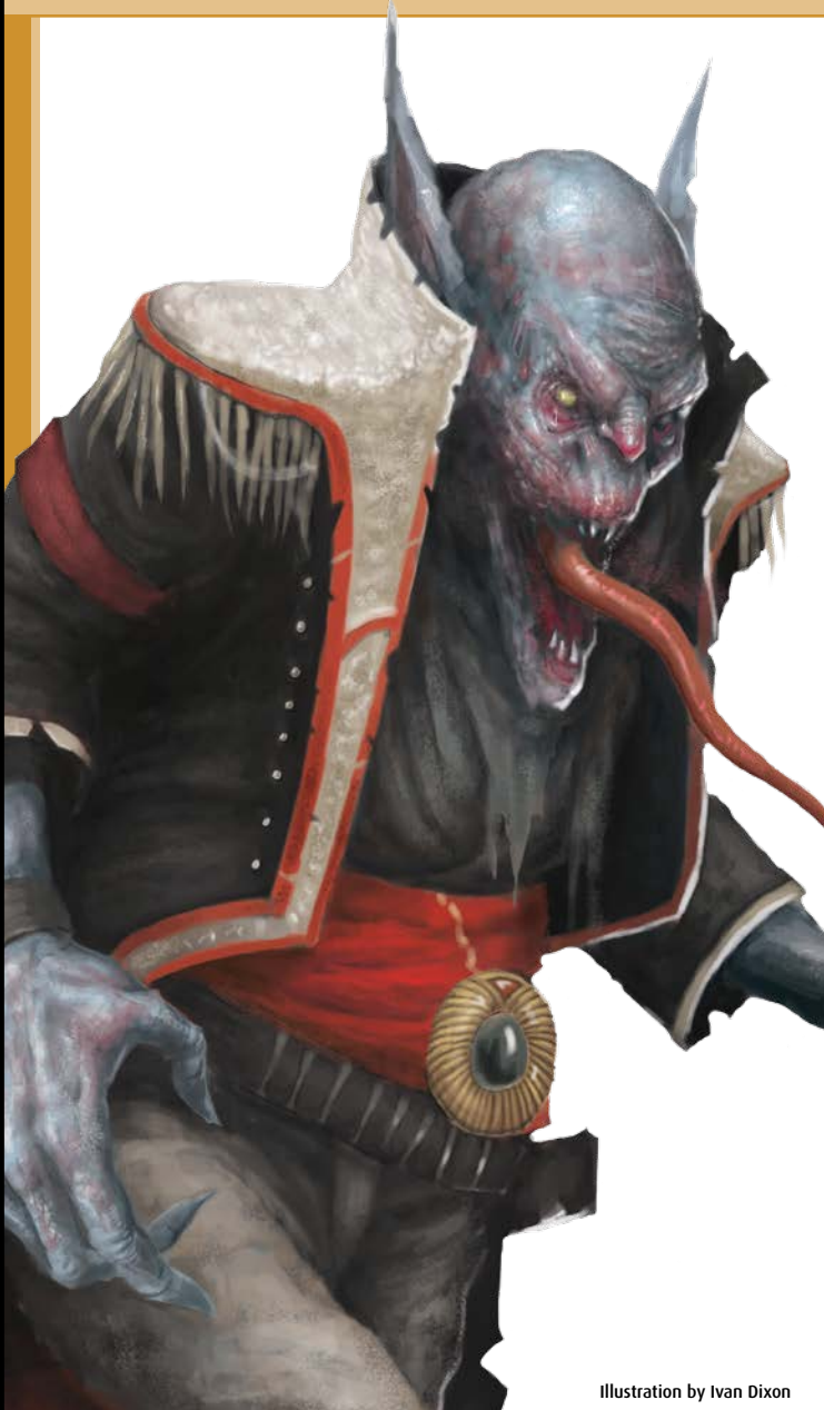
Illustration by Ivan Dixon