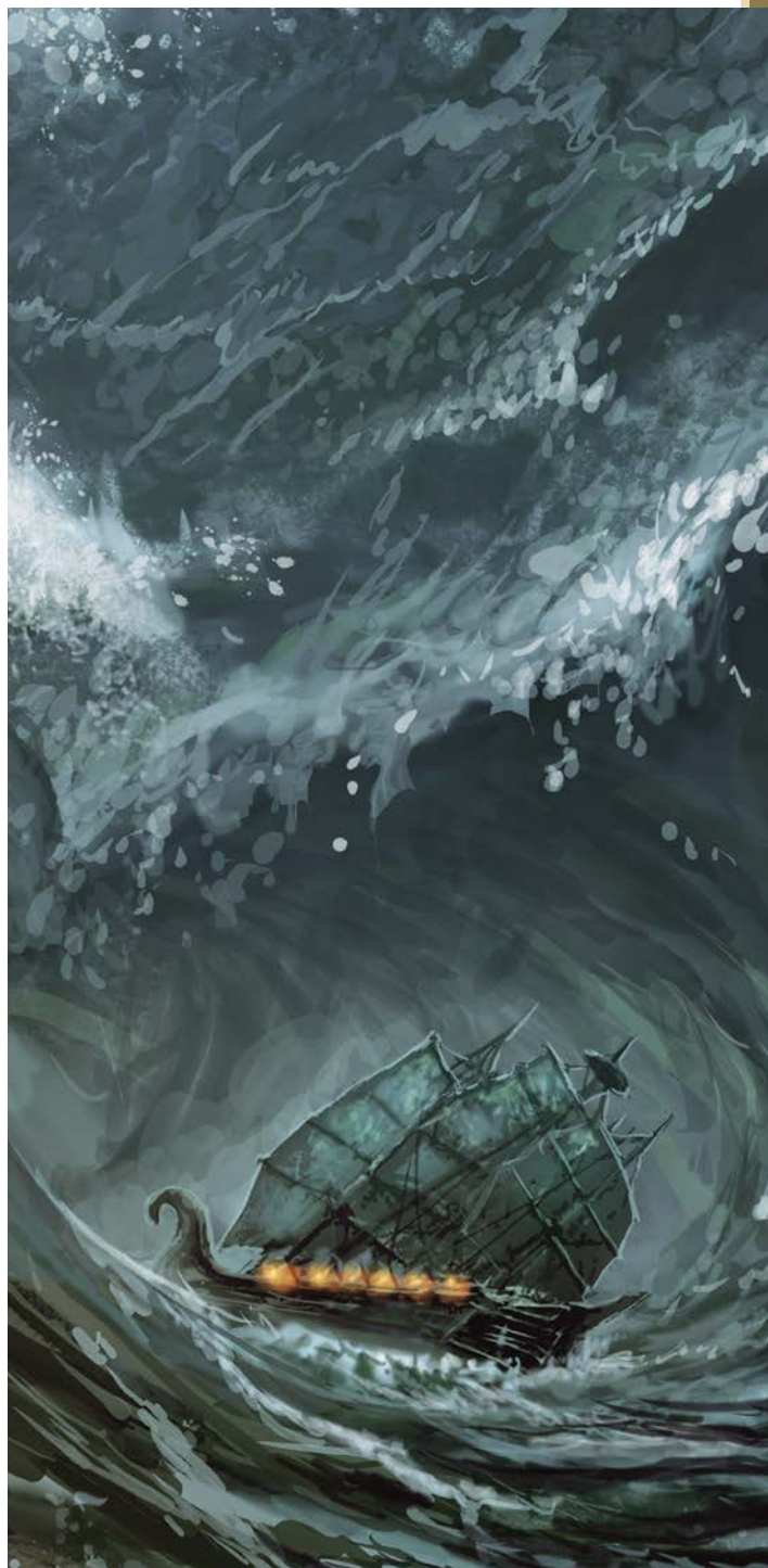
Illustration by Mariusz Gandzel